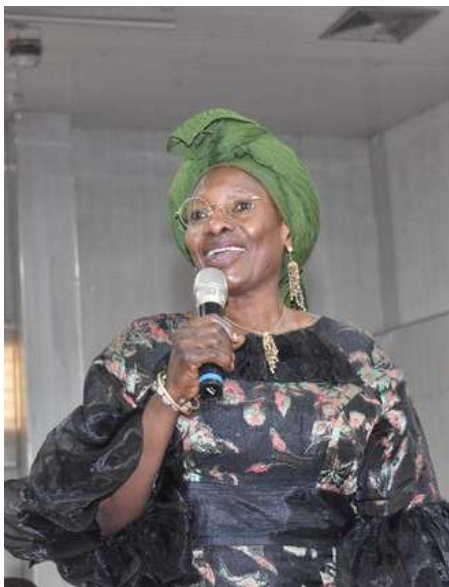
Former Minister of Women Affairs, Mrs. Pauline Tallen

He stated that fostering a culture of innovation and research excellence within universities was his target.