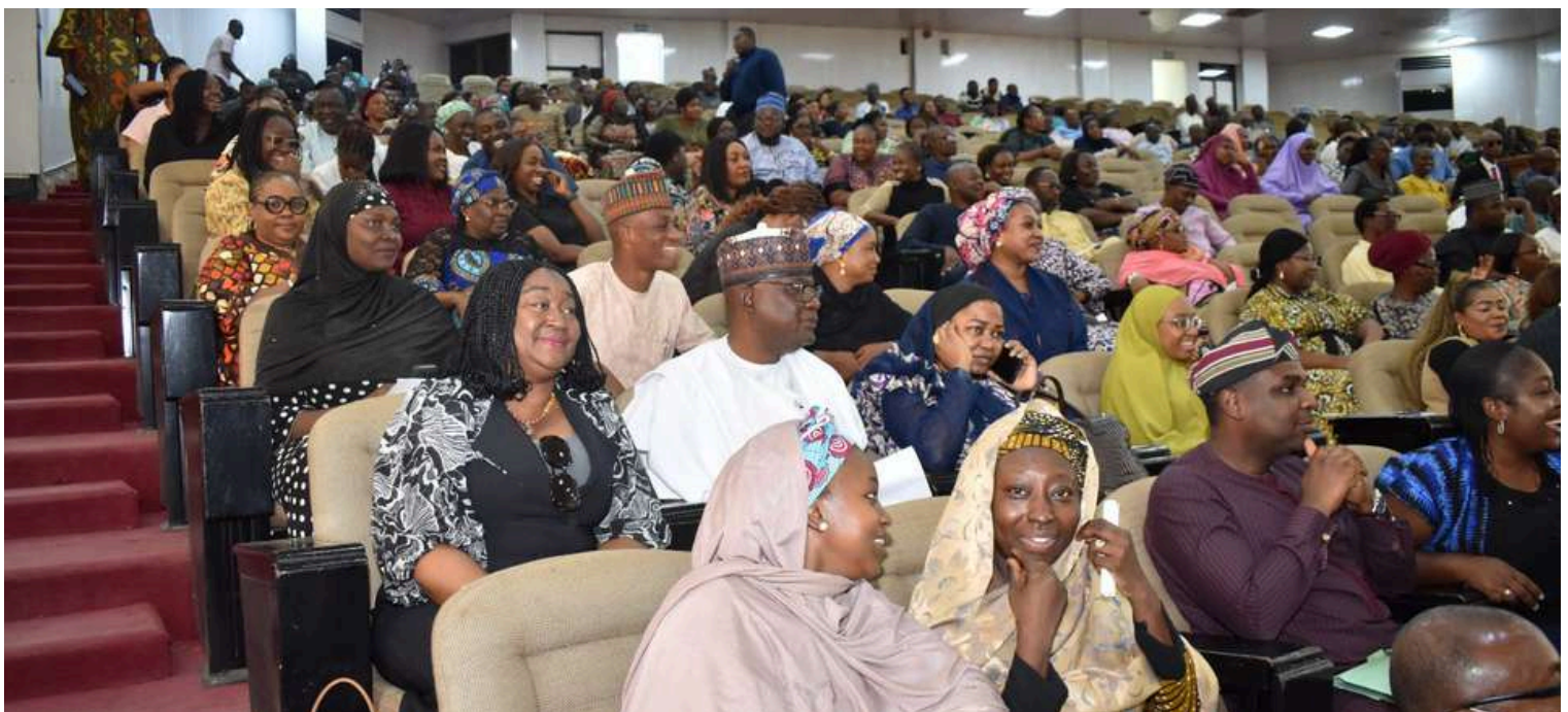
Cross Section of NUC Staff at the New ES Assumption of Duty Ceremony