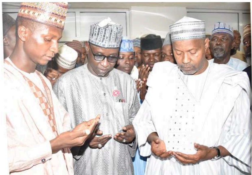
The New ES of NUC Committing his First Day in Office to God's Hands