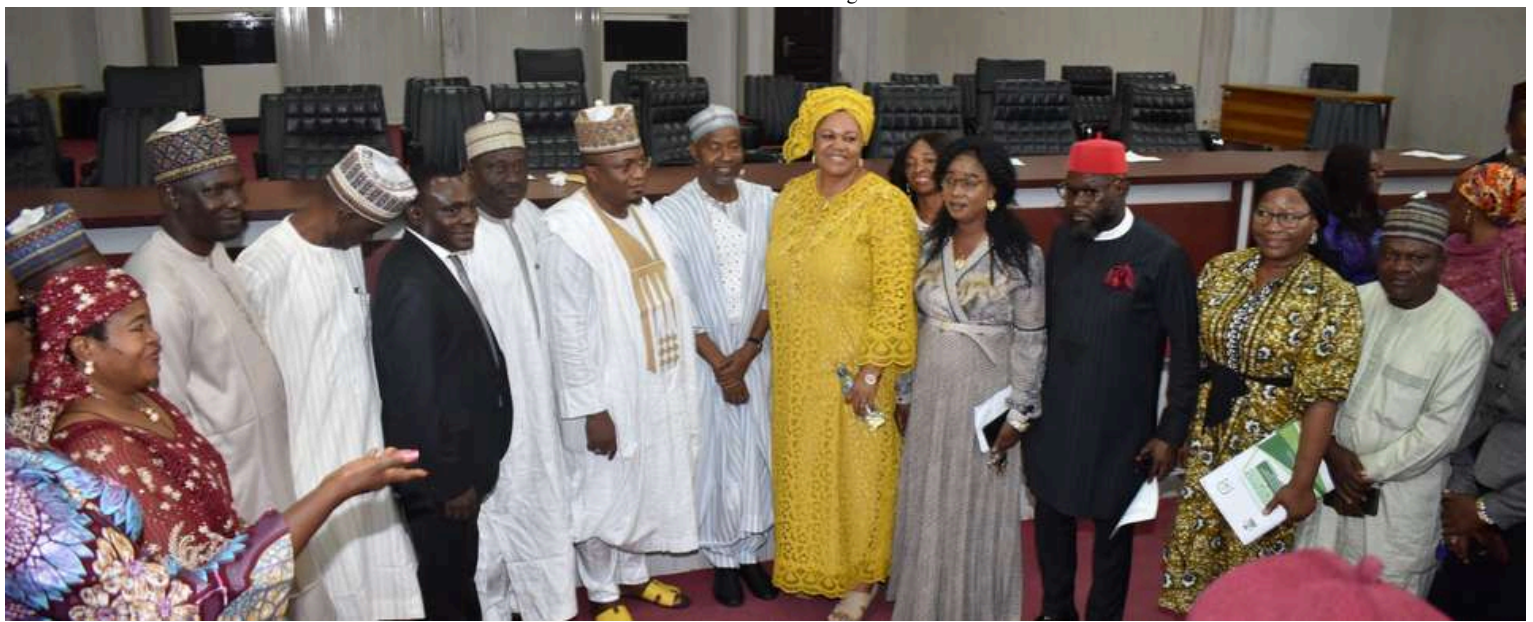
The New ES with Some NUC Directors and Deputy Directors