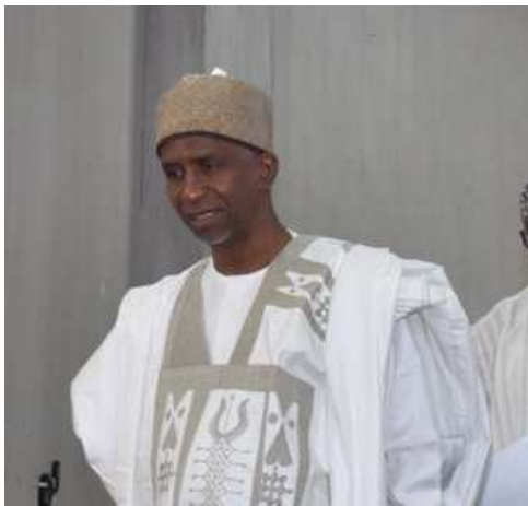
ES Elder Brother at the Event