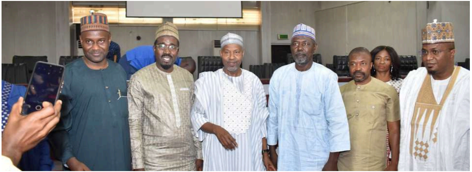
The New ES with Some Dignitaries