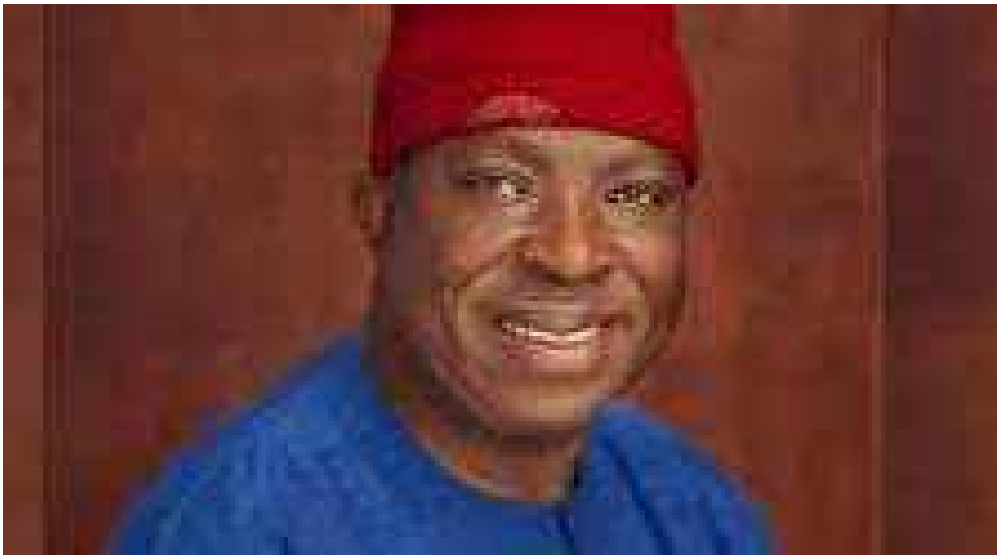
Senator Victor Umeh

with 6 states has the least number of universities (21), while the South East with 5 states has 36 universities.