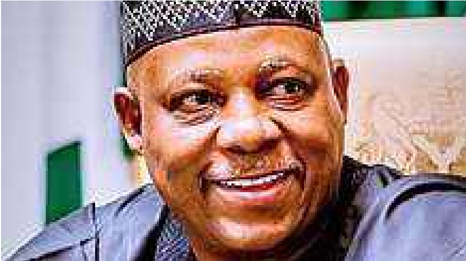
Vice President, Senator Kashim Shettima, GCON

General Christopher Musa as Chief Kaduna and the people of Southern of Defence Staff as evidence of the Kaduna at heart,” he stated.”