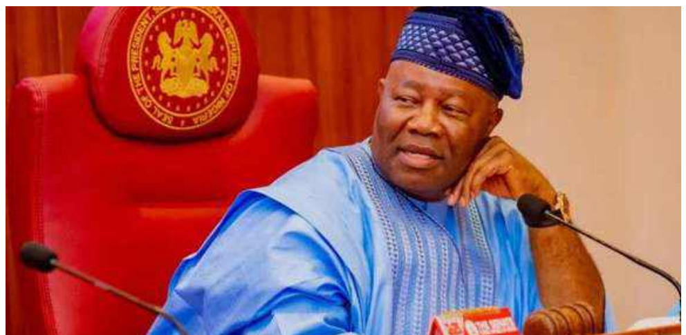
Senate President, Senator Godswill Akpabio

S takeholders in the education sector have posited that establishing specialized Universities would rapidly and technologically develop the nation. This was made known at a one-day public hearing on Bills for an Act to establish the Federal University of Information Technology, Ikare-Akoko, Ondo State and Federal University of Education, Technical, Gombe organized by the Senate