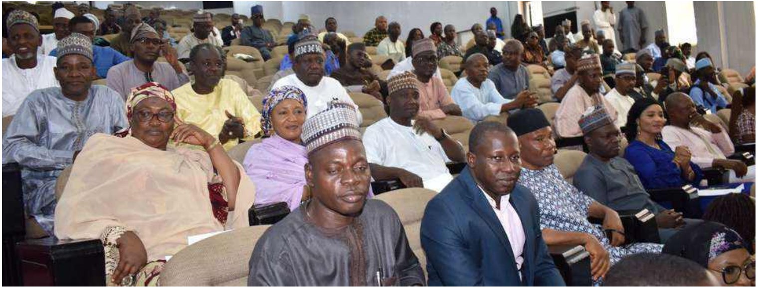
Cross Section of NUC Staff at the New ES Assumption of Duty Ceremony