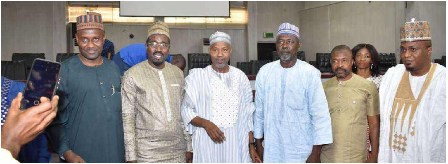
The New ES with Some Dignitaries