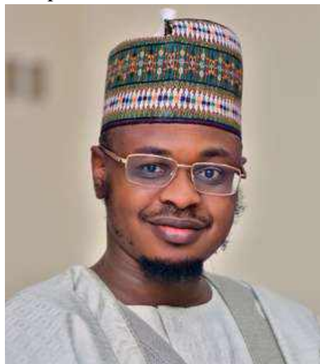
Former Minister, Isah Ali Pantami

The Federal University of Education, Technical, Gombe (Establishment) Bill focuses on technical education, a critical sector in the journey towards industrialization and skill development.