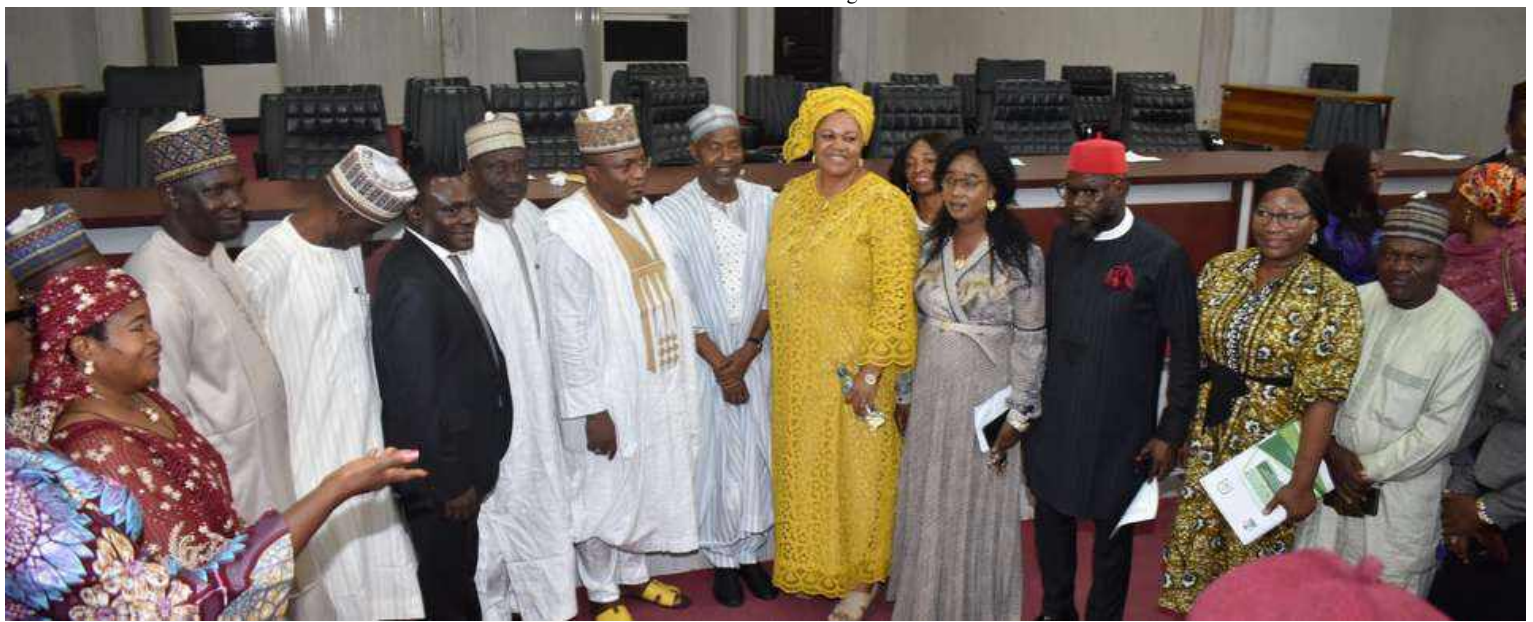
The New ES with Some NUC Directors and Deputy Directors