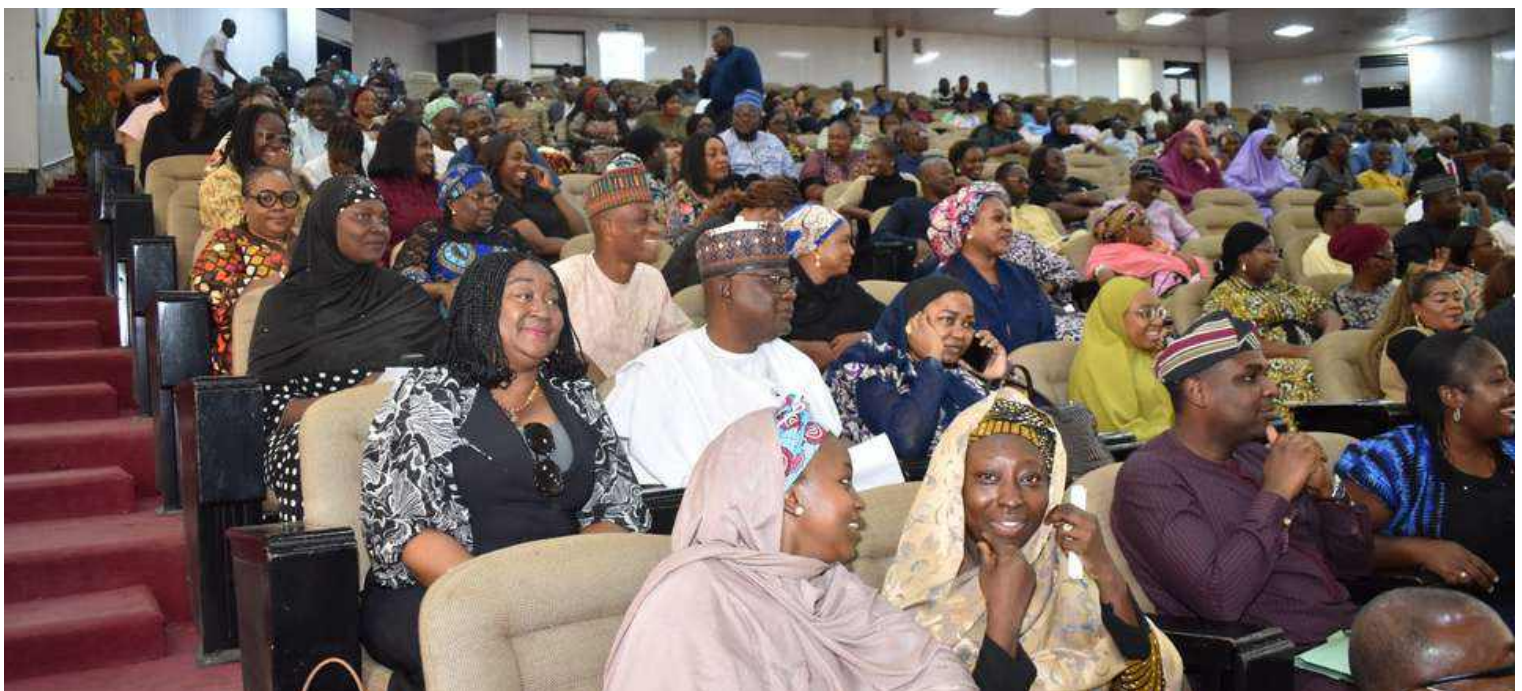
Cross Section of NUC Staff at the New ES Assumption of Duty Ceremony