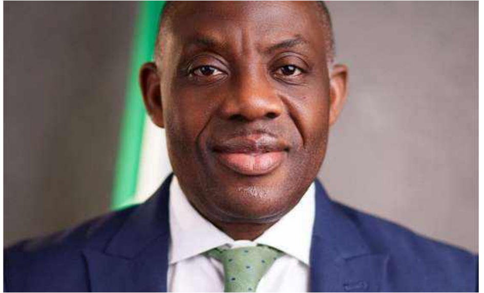
Minister of Education, Dr. Maruf Tunji Alausa