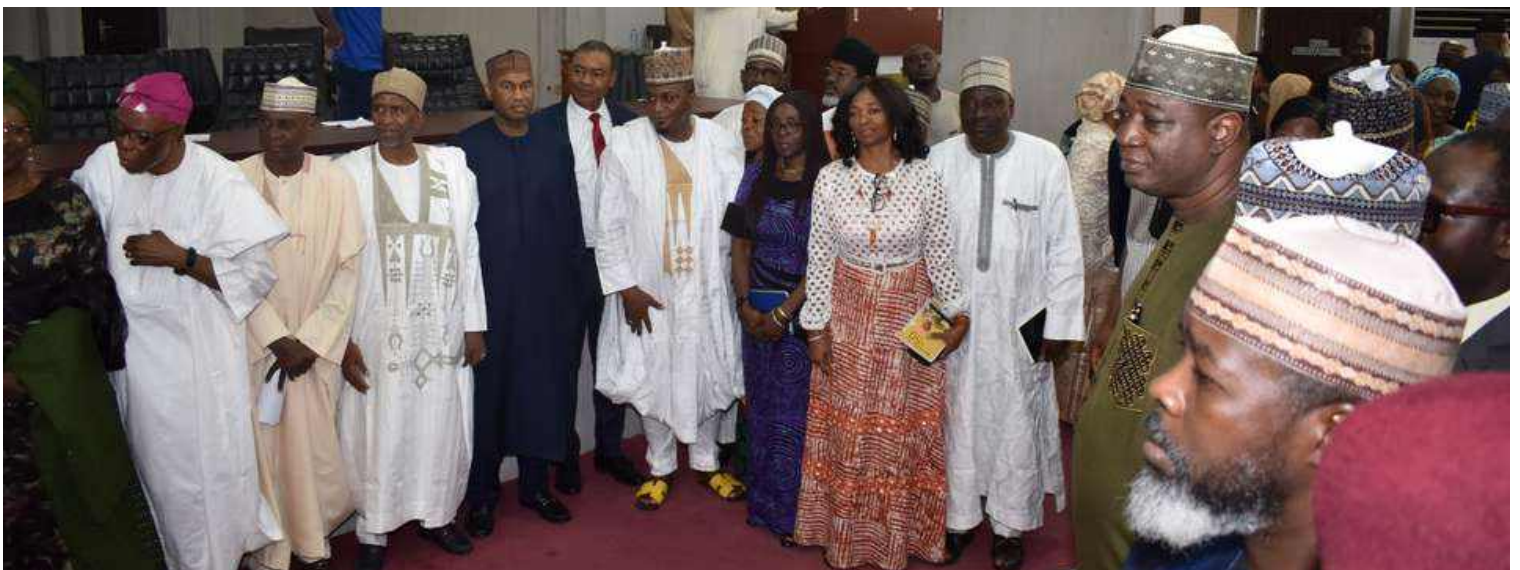
Some Dignitaries at the ES Assumption of Duty Ceremony