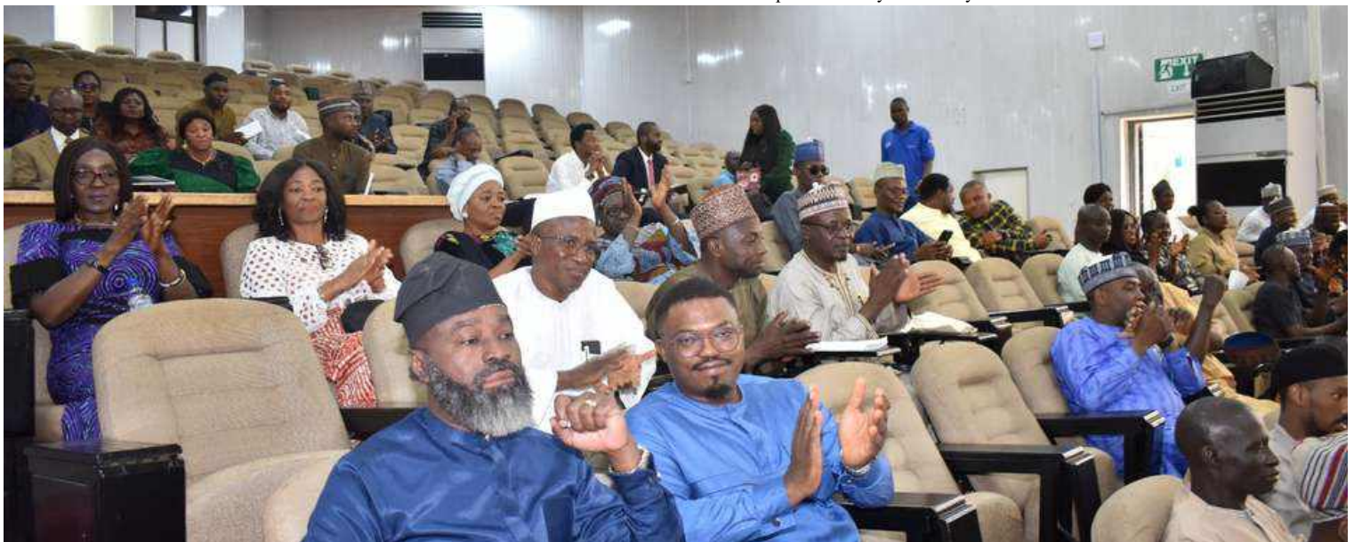
Cross Section of NUC Staff at the ES Assumption of Duty Ceremony