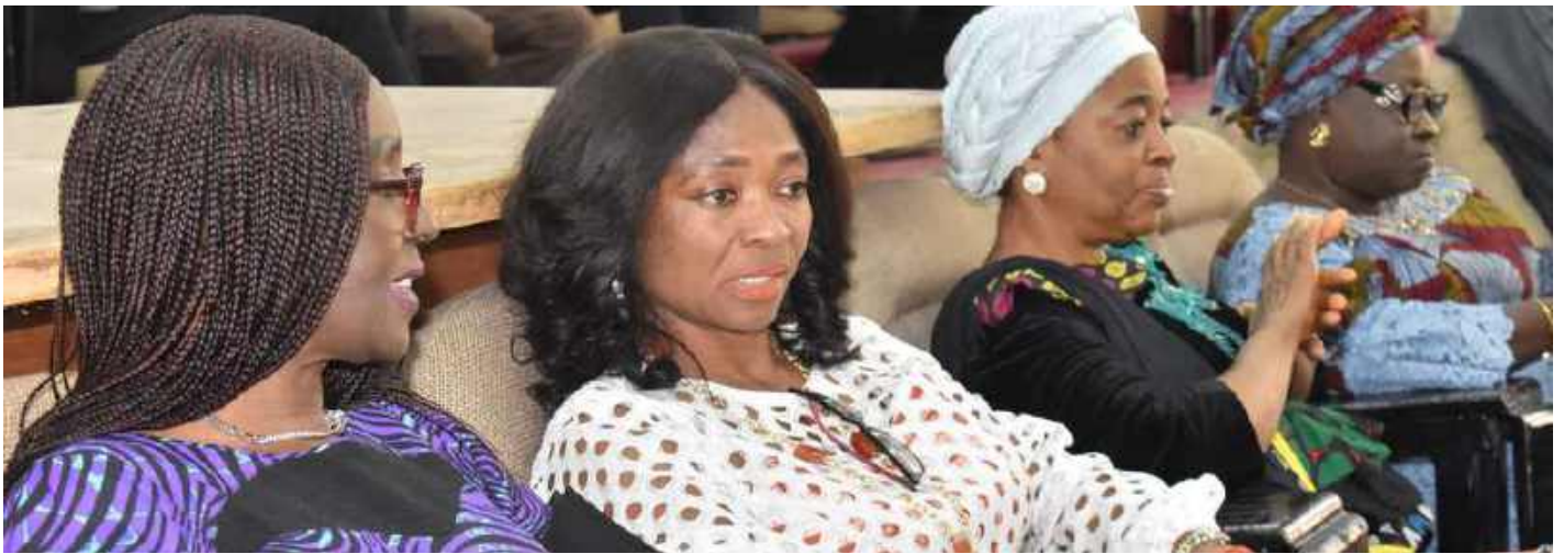
Cross Section of NUC Female Directors