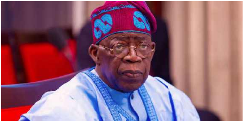
President Bola Ahmed Tinubu, GCFR