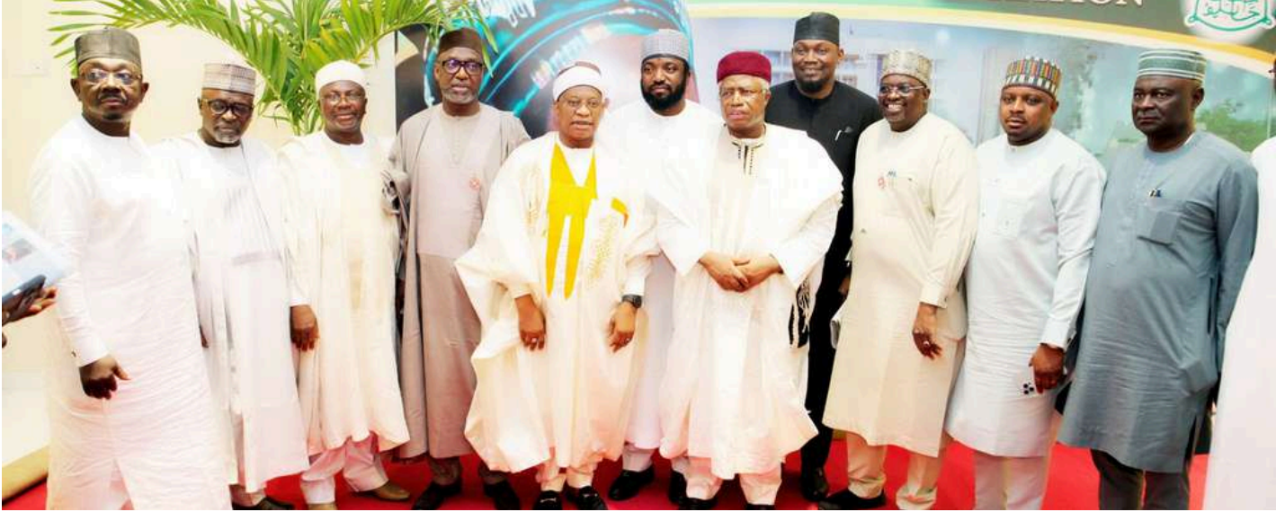
Cross Section of Alumni at the Annual General Meeting