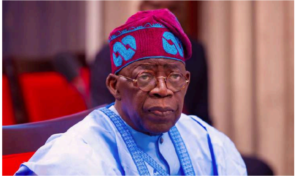
His Excellency President Bola Ahmed Tinubu GCFR

The President Bola Tinubu has approved the renaming of the University of Abuja (UniAbuja) to Yakubu Gowon University. He did this in honour of Nigeria's former Head of State, General Yakubu Gowon (Rtd), who recently marked his 90th birthday.