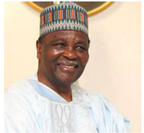
Former Head of State, Gen. Yakubu Gowon

The renaming aligns with President Tinubu's ongoing