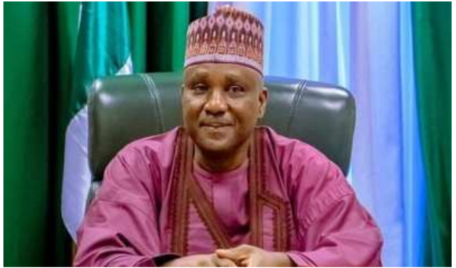
Speaker of the House of Representative, Rt. Hon. Tajudeen Abbas

“This showed that the funding of education, especially public universities, would continue to drop based on government priorities, especially now when the federal government is facing insecurity challenges such as Boko Haram, Lukurawa insurgents,