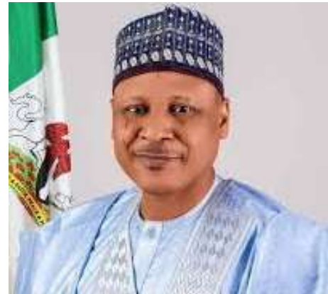
Minister of Information, Mohammed Idris

According to the Minister, the renaming recognizes Gowon's