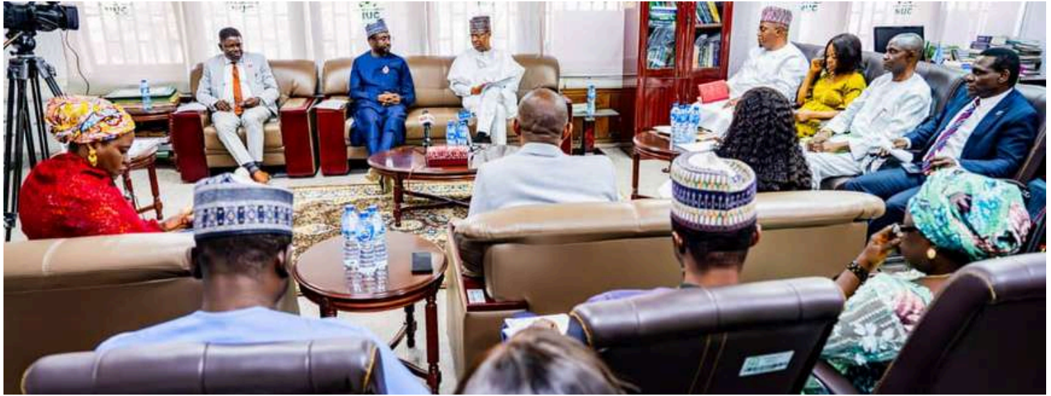
Cross Section of NUC Officials and NITDA Delegations at the Meeting

skills such as digital literacy, communication, numeracy and entrepreneurial skills in its recently developed Core Curriculum Minimum Academic Standards (CCMAS) for Nigerian universities. He said a collaboration with NITDA would not be out of place, considering the rapidly changing Information and Communications Technology (ICT) space as well as the dynamics of the digital economy ecosystem.