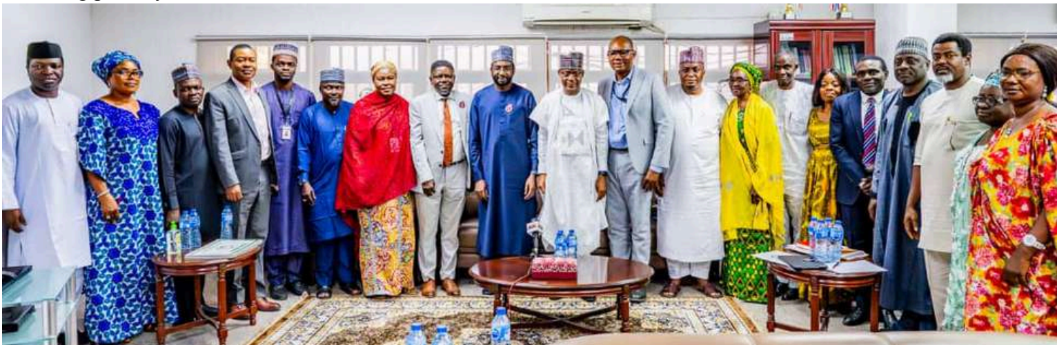
The Immediate Past Ag. ES in a Group Photograph with the NITDA Delegations and some NUC Officials