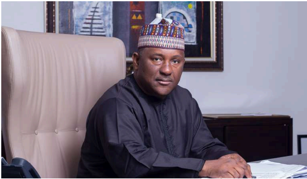
Chairman of ASR Africa and the BUA Group, Abdulsamad Rabiu