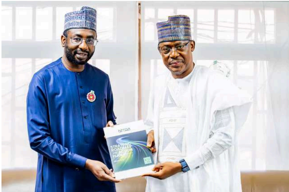
The Immediate Past Ag. ES of NUC Receiving NITDA Strategic Document from the DG of NITDA

universities cannot be left behind in the pursuit of improved digital literacy, stressing that the collaboration was necessary if Nigeria would meet its target of building a knowledge-economy.