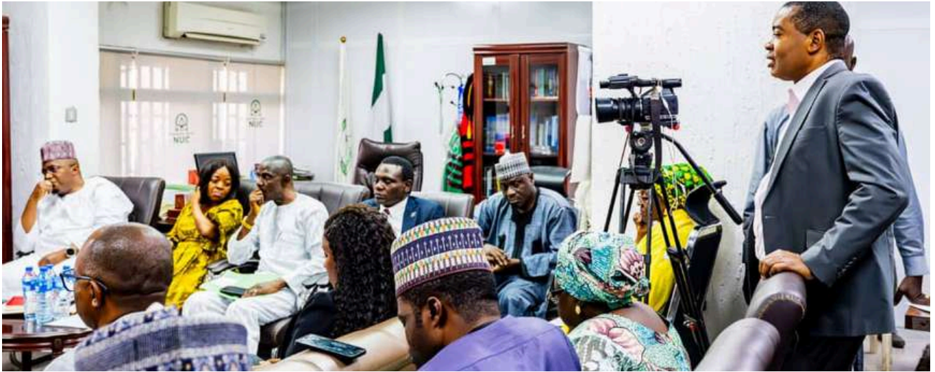
Cross Section of NUC Directors in the Meeting

this can be replicated and embedded in the curriculum of our universities. This would promote digital inclusion, and financial inclusion and deepen economic inclusion for all Nigerians irrespective of their locations across Nigeria.