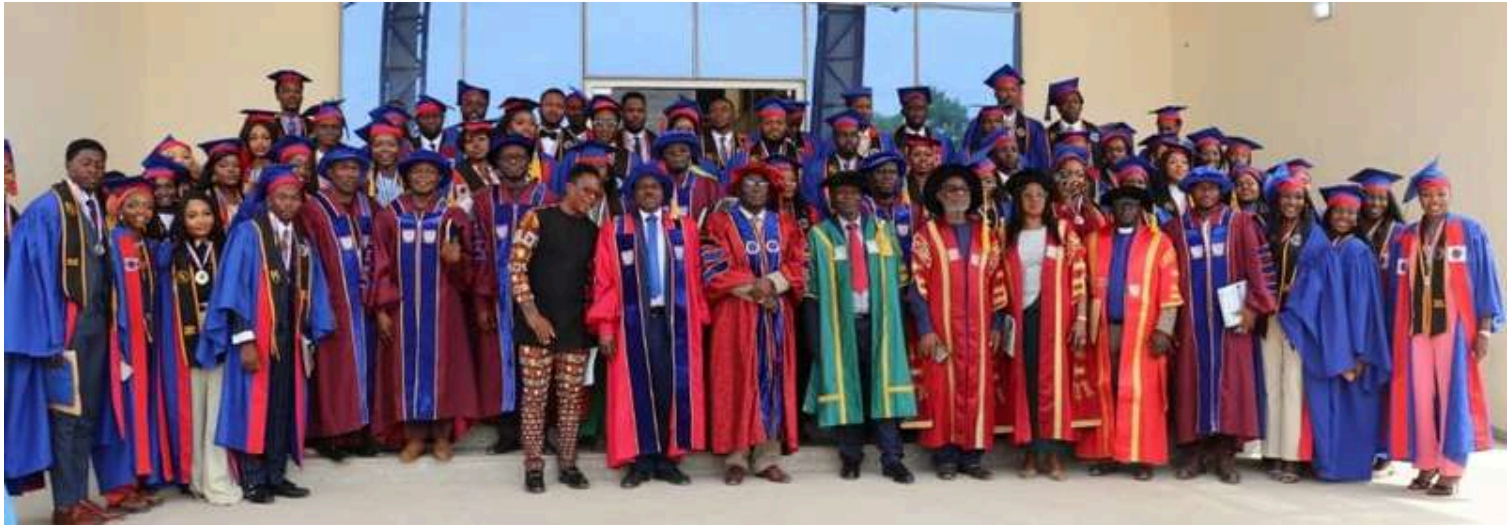
Group Photograph of Participant at the Convocation