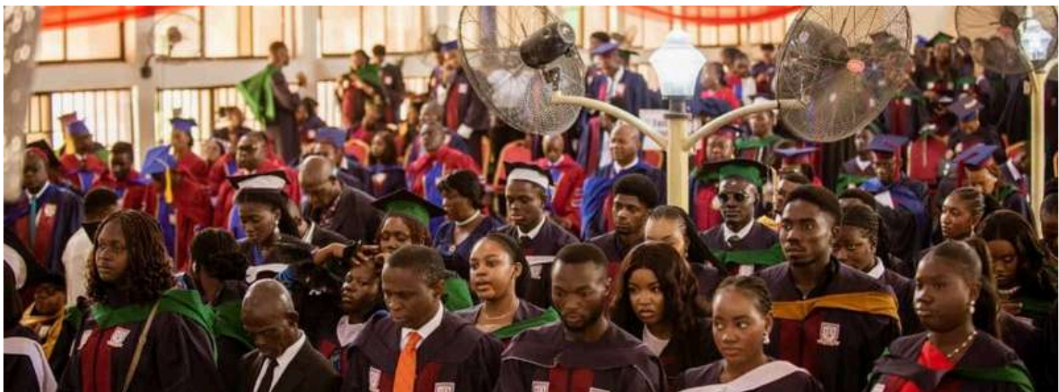
Cross Section of Graduands During the Convocation

In his remarks, the Special Guest of Honour, Gen.(rtd) Martin Luther Agwai (CFR), commended the University for its demonstration of academic excellence and for infrastructural development in the span of 19 years of its existence. He commended the Governing Council and the Chairman Board of Trustees and President of ECWA Worldwide for the great role they played in raising the standard of