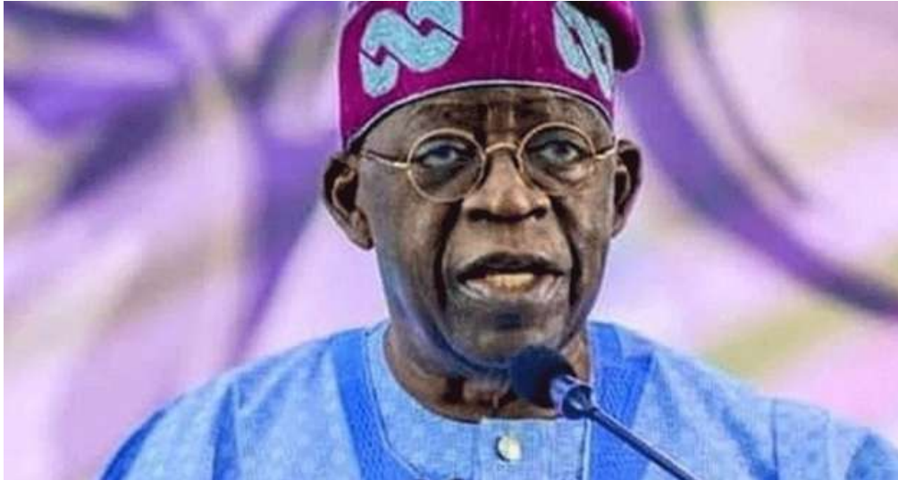
President Bola Ahmed Tinubu, GCFR