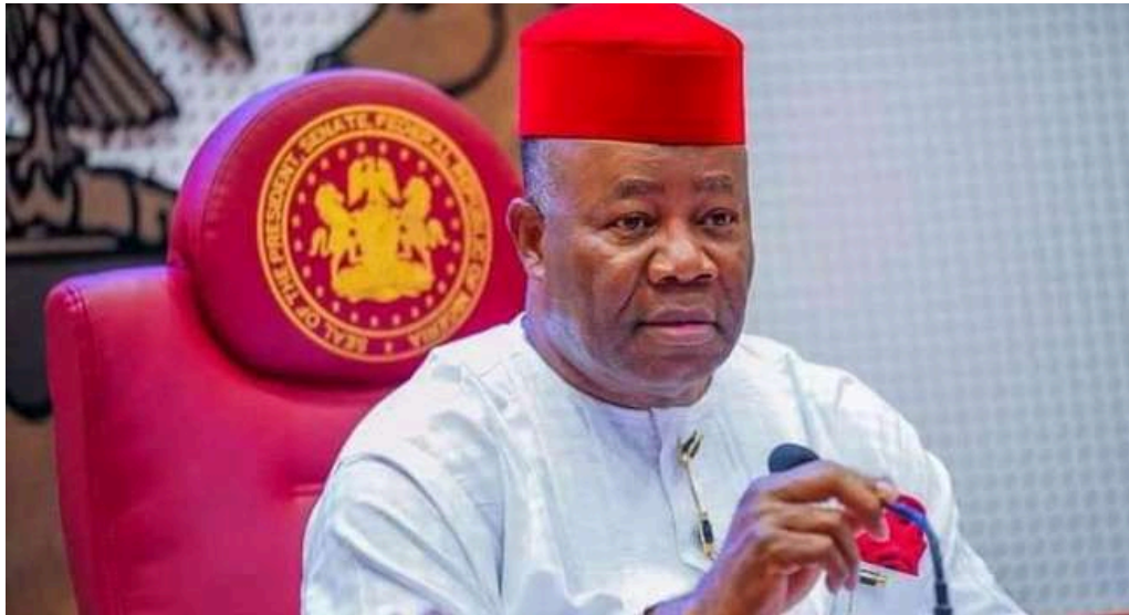
The Senate President, Senator Godswill Akpabio