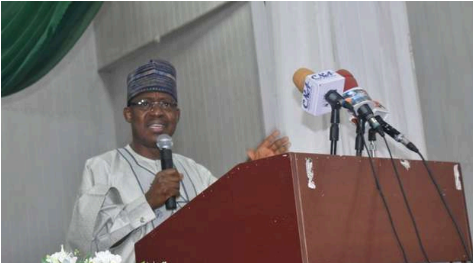
Ag. ES Addressing Participants at the Conference

The National Universities Commission (NUC), has, in collaboration with the Commonwealth of Learning (CoL), Vancouver, Canada, organised a Stakeholders' Capacity Building Workshop for Graduate Employability Strategies and Framework from Thursday, 24-Saturday 26, October 2024, at the Idris Abdulkadir Auditorium, NUC.