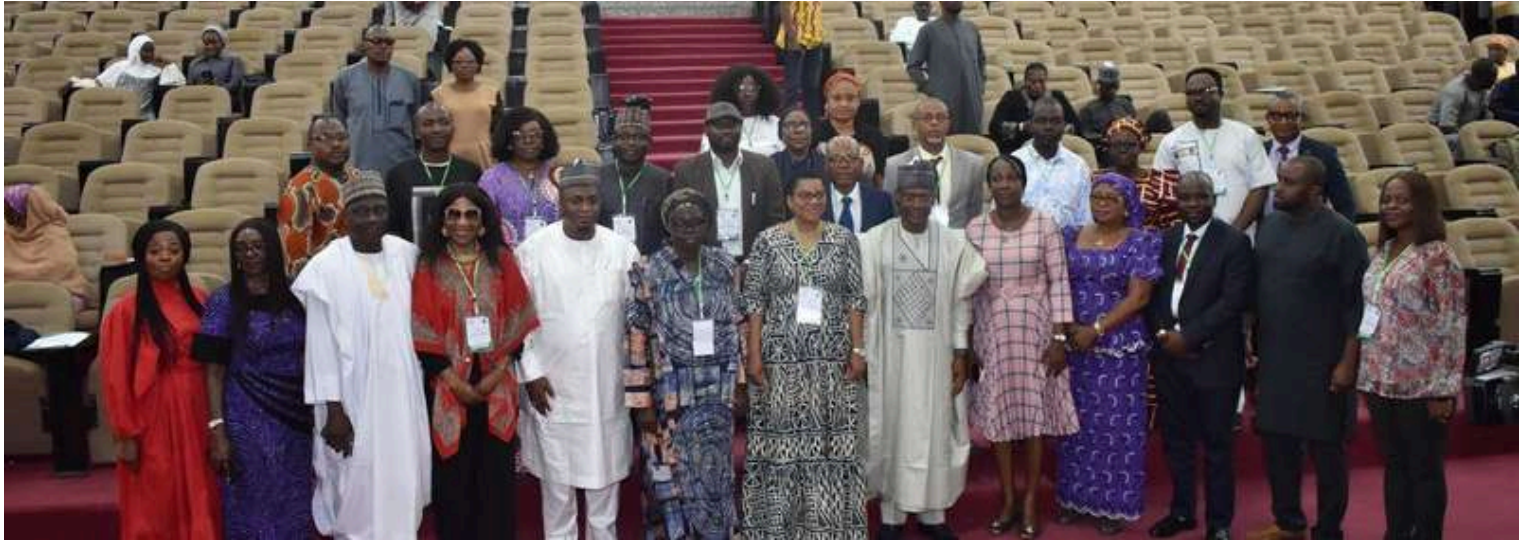
The Ag. ES with Participants in the Conference in a Group Photographs