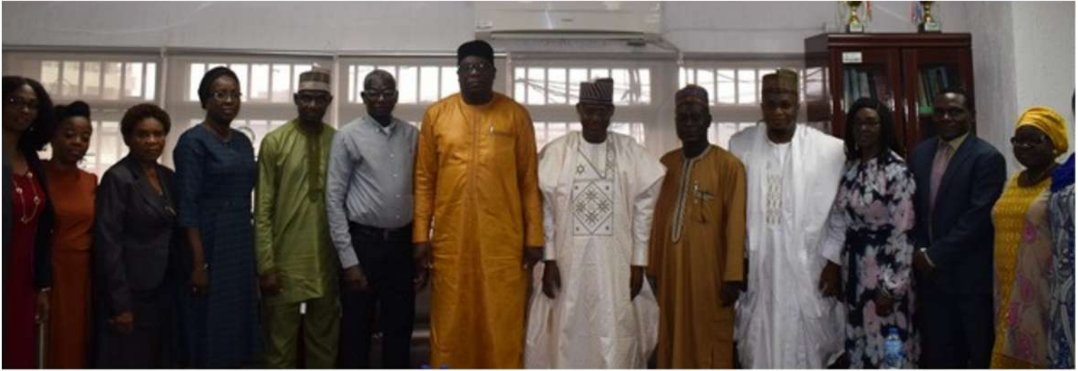
The Ag. ES and the Head of Zambian Delegations in the Middle with NUC Directors

This relationship had seen Nigeria contributing to development of The Gambia, after its independence, in the areas of defense, judiciary, education, among others.