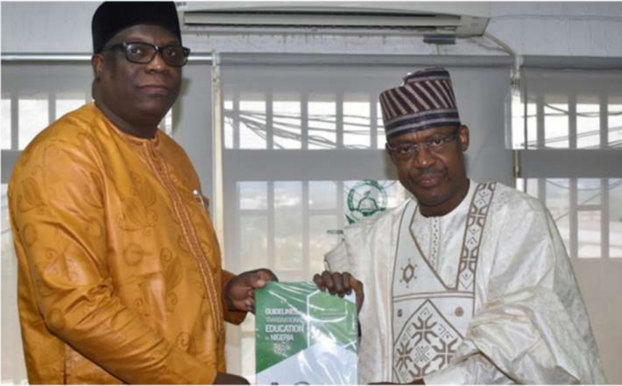
The Ag. ES Presenting a Souvenir to the Head of the Zambian Delegations

He said it is the reason Nigerians travel a lot to acquire the golden fleece of university education and that the interest has never waned.