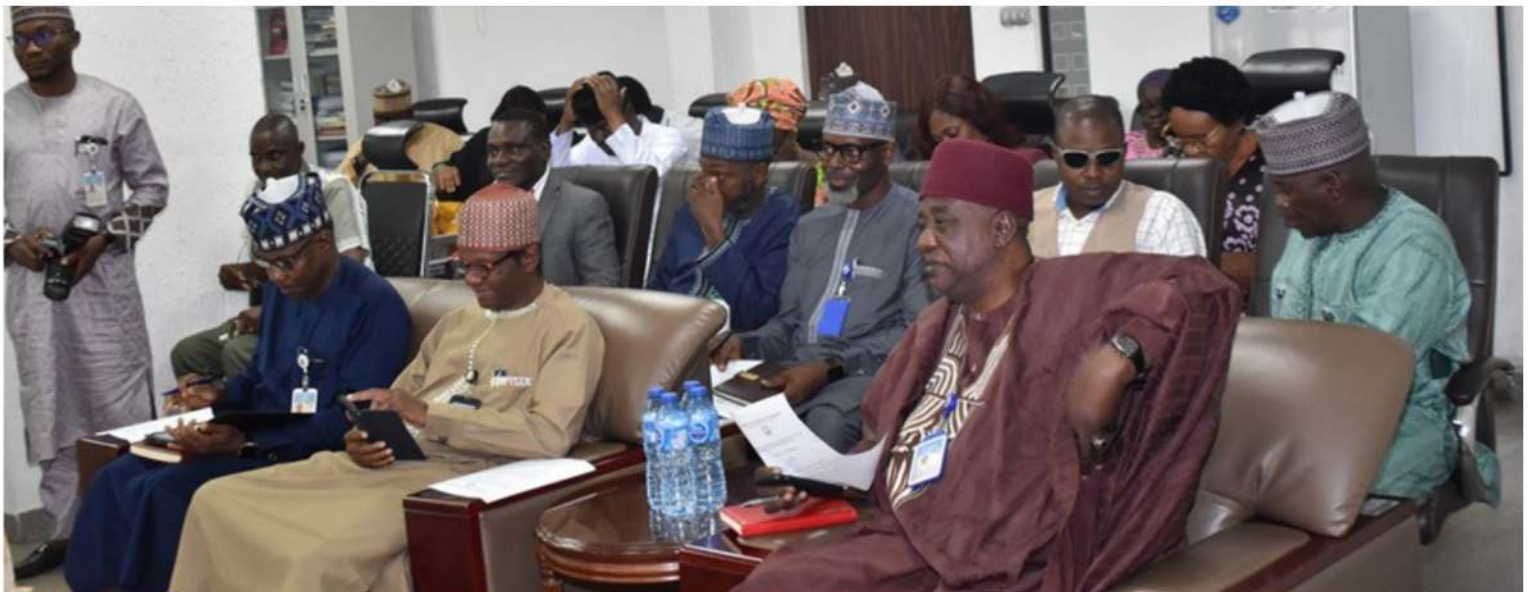
Cross Section of Delegations from Nasarawa State University

He said that the CCMAS also gave consideration to the evolving courses such as Artificial