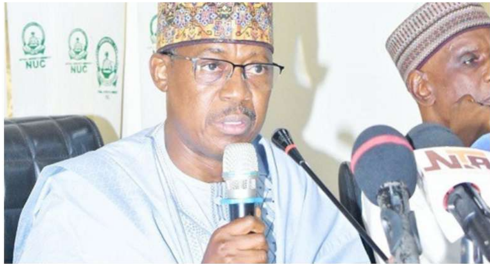
Acting Executive Secretary of the NUC Addressing the CIPEN Delegation

He stated that with NUC as the regulator of university education