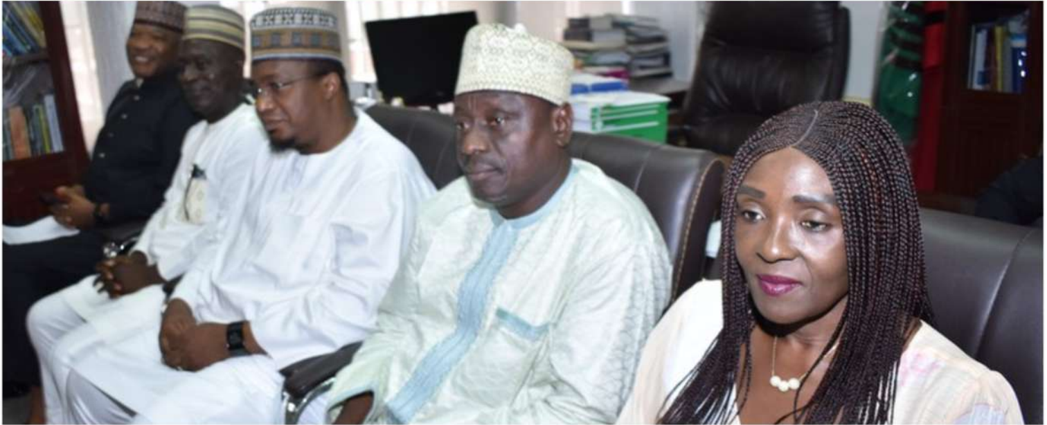
Cross Section of NUC Directors

Intelligence, ICT/Digital transformation, Digital literacy, Critical Thinking, Entrepreneurship, all with a view to making the Nigerian graduates more relevant in the global space.