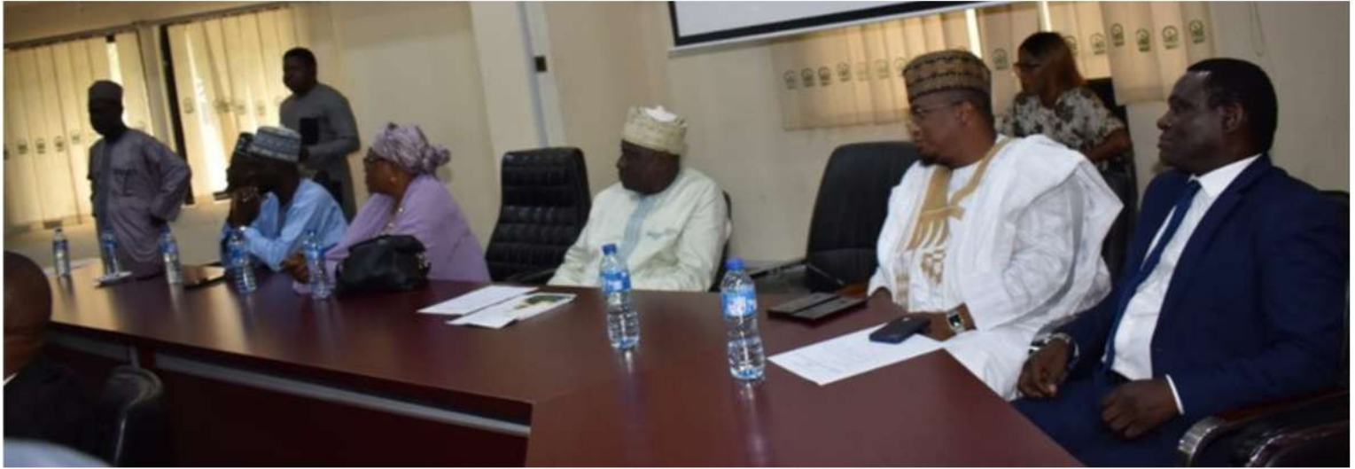
Cross Section of NUC Directors at the Meeting