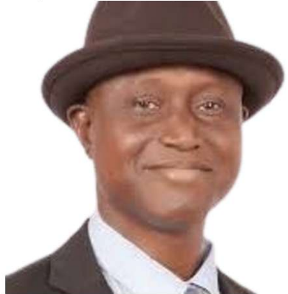
The Ag. ES welcomes the President of CIPEN to NUC

Welcoming the high-powered delegation, the Acting Executive Secretary informed them that the NUC is an agency of the Government saddled with the mandate and responsibility to ensure the orderly development of a well-coordinated Nigerian University System (NUS). He further said the Commission