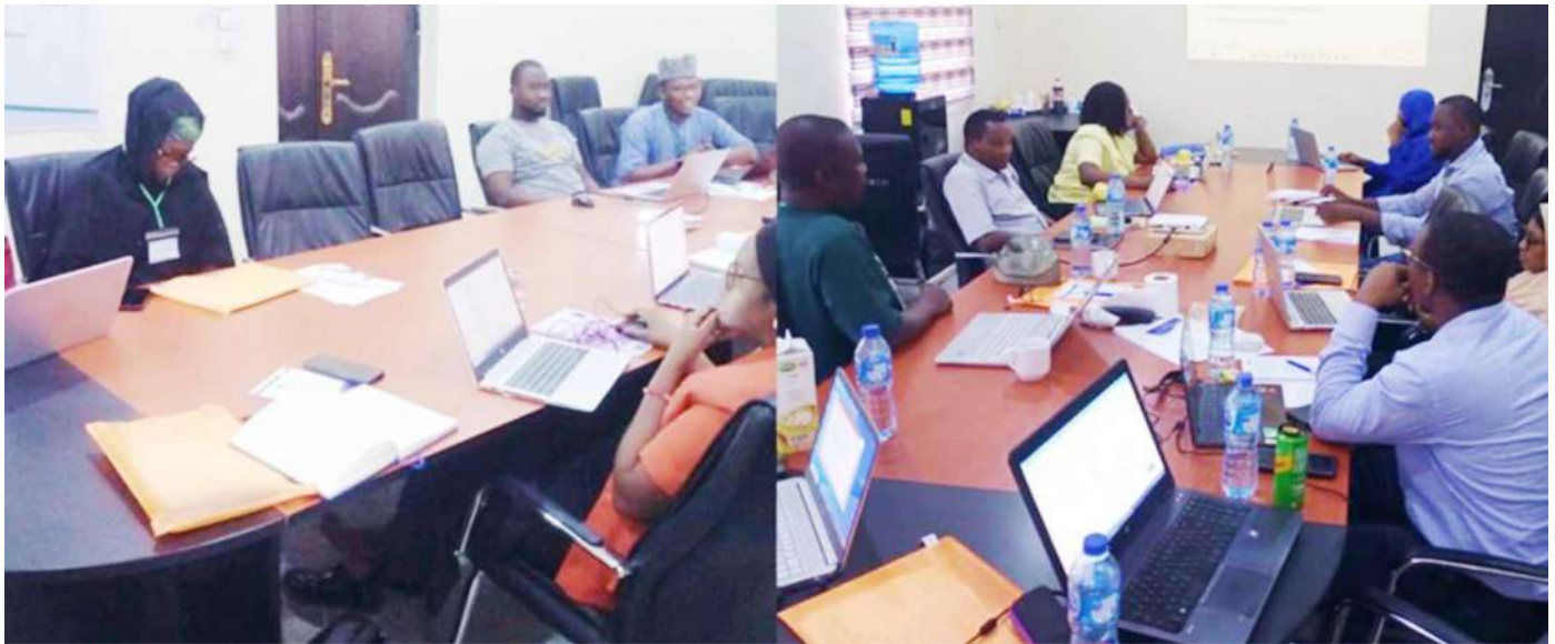
A cross section of participants at the STEM Workshop organised by the Commonwealth of Learning (COL) and the University of Abuja (UNIABUJA)

Learning (COL) and the University of Abuja (UNIABUJA) in Nigeria recently partnered to enhance STEM education outcomes in Africa and across the Commonwealth.