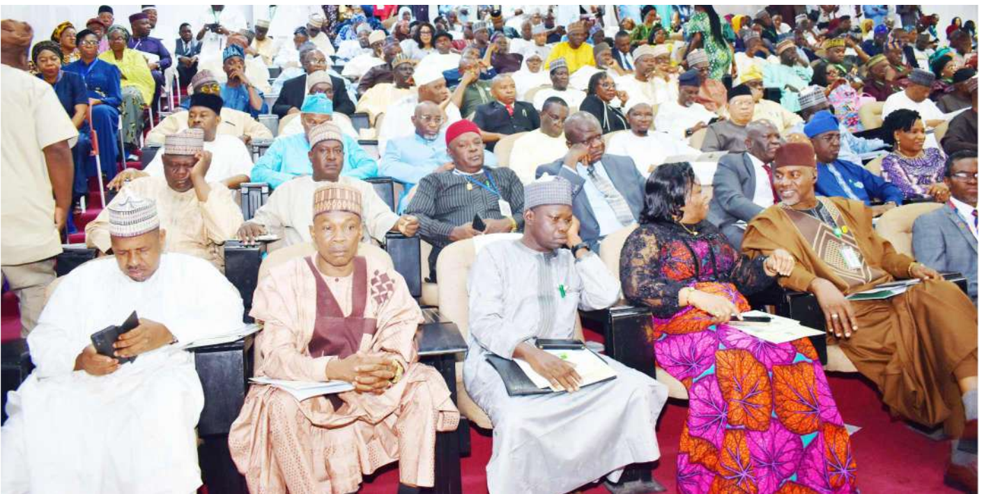
Other Council Members at the event