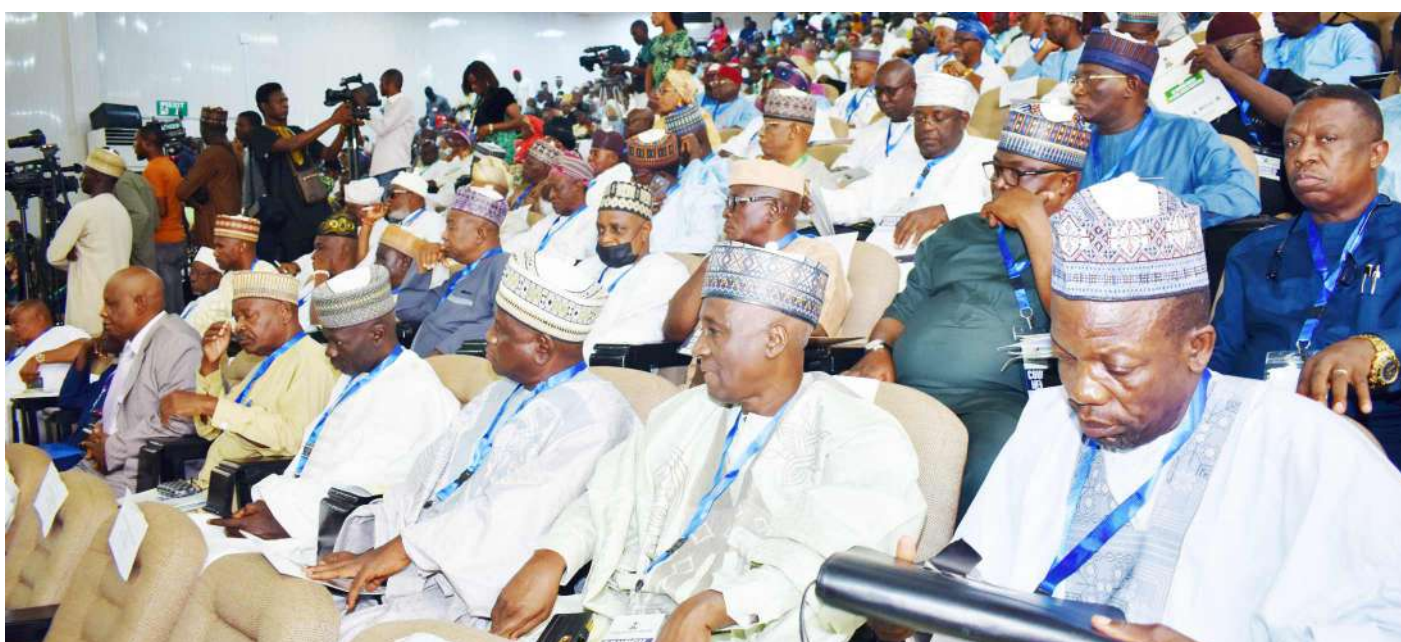
Aerial view of the newly Inaugurated Council Members at the Ceremony

He explained that the administration of President Bola