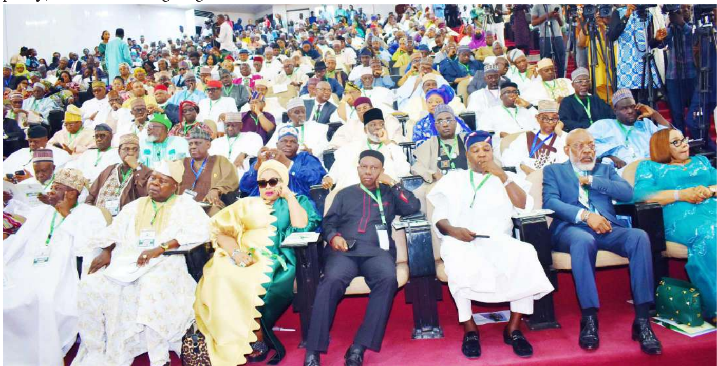
The Pro-Chancellors/Chairmen and members of the Governing Councils of the Federal Tertiary Institutions at the Inauguration held at the Idris Abdulkadir Auditorium, NUC, Abuja

He urged them to cultivate good relationship with the University-based unions, warning them against trying to stifle the activities of unions on the campuses as it is a constitutional and international right for both staff and students to unionise.