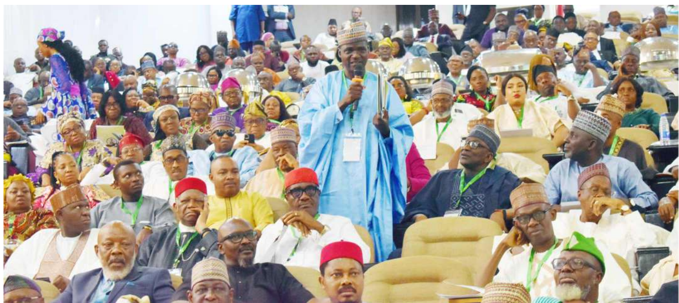
One of the Council Members asking question on emoluments for the Governing Councils

He explained that Infractions amount to abuse of office through which the Government loses lots of funds, noting that all Council members and other Principal Officers of the universities could face sanctions in addition to a refund if found guilty.