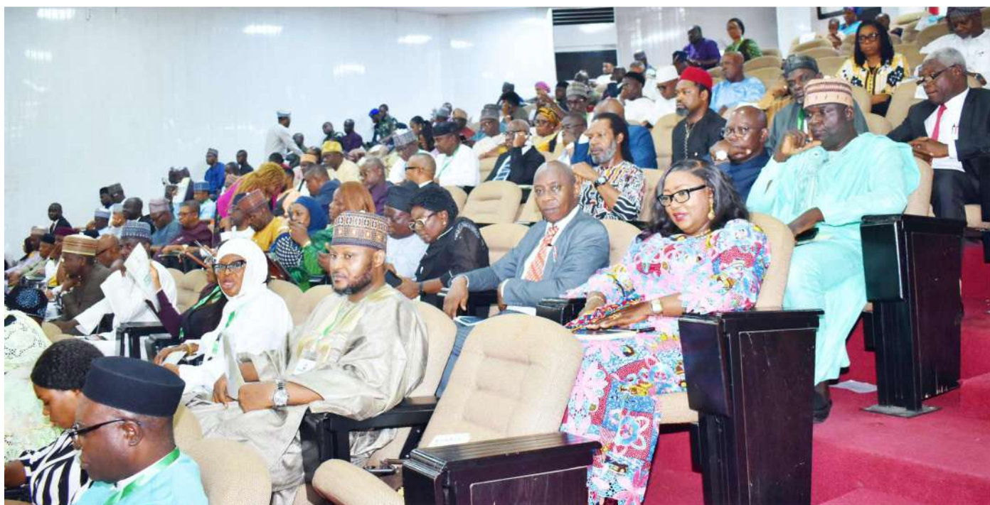
A cross section of the Universities Council Members at the Retreat

At the national level, he challenged the Committee of Pro-Chancellors to, as a matter of urgency, devise means of ensuring stability in the Nigerian University System, by serving as the bridge between the Federal Government and the various university-based unions.