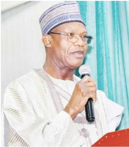
Prof. Tahir Mamman Honourable Minister of Education

members and they should thus, desist from such.