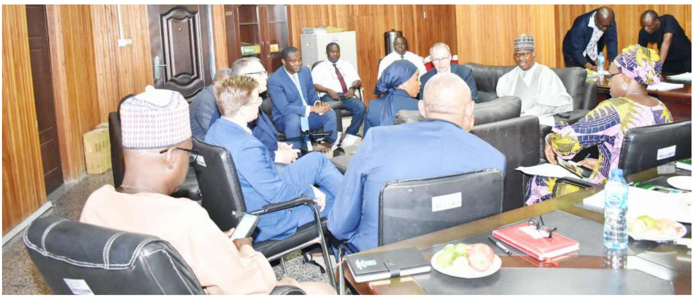
The Meeting of the Acting Executive Secretary, NUC and his Management Team with the BYU, USA delegation in session

establish BYU's presence in Nigeria since the institution had been floated successfully in 185 countries already.