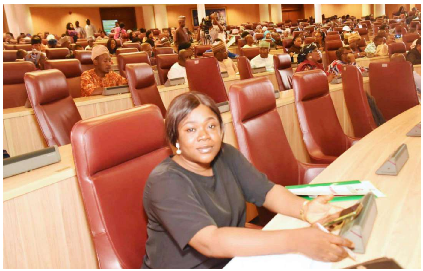
Other Participants at the event

Participants were given the opportunity to ask questions and clarify same during the sensitisation programme.