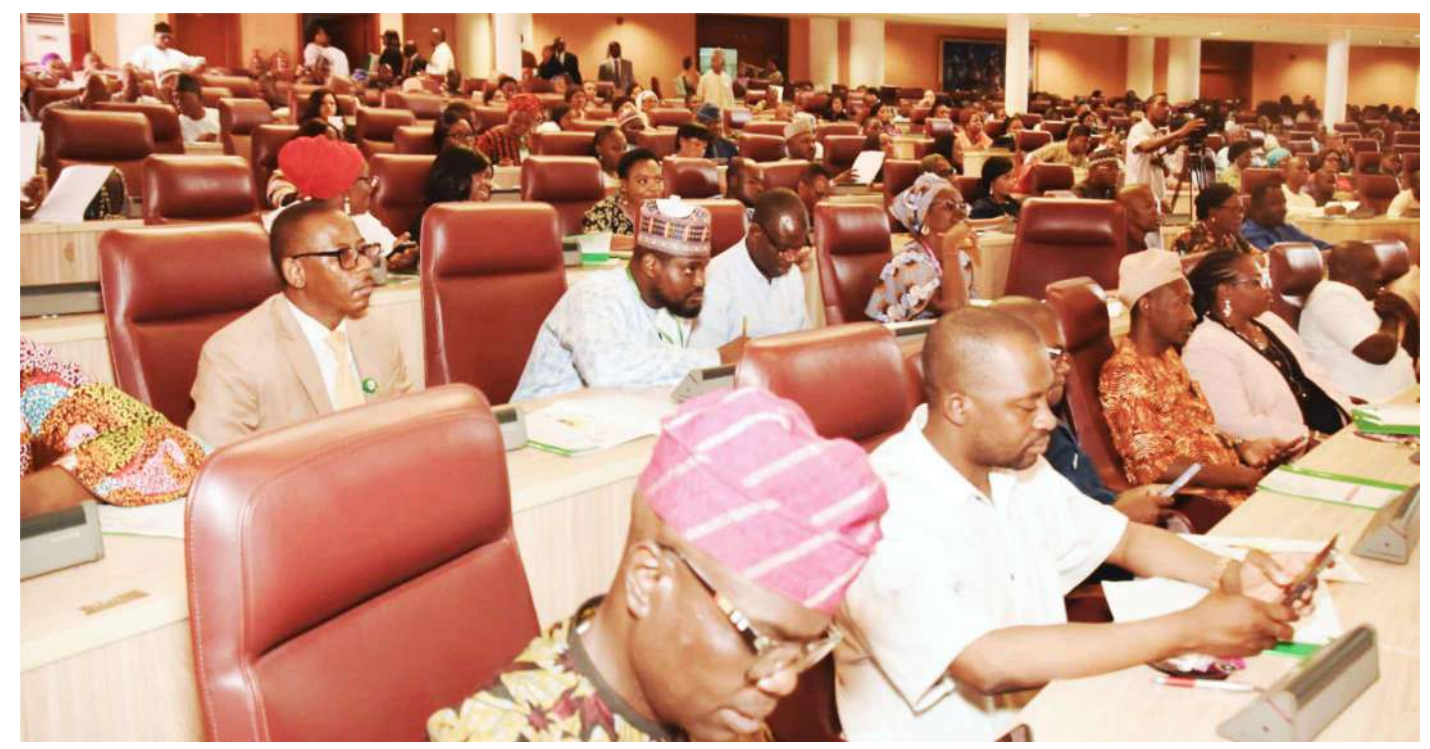
Participants at the World Bank Supported Service Wide Sensitisation Programme on IPPIS/HR Module for Grade Level 12 Officers and above

Some of these self -services included, viewing employee records; leave plan, application