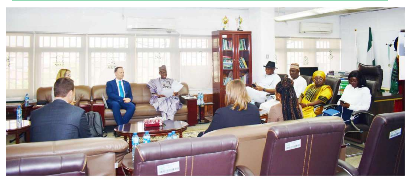
The Acting Executive Secretary NUC and his management team with the visiting German delegation in a meeting session

Parliamentarian said the IPS programme was aimed at providing young individuals from different countries with the opportunity to participate in an intern-ship at the German Parliament and learn about the German political system.