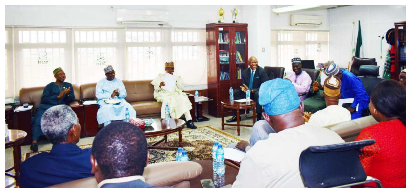
The meeting of the Acting ES and his management team with the visiting COREN delegation in session

collaboration that would benefit the Nigerian Universities.