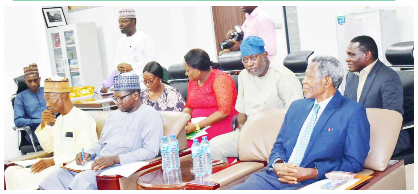
The meeting of the NUC management team with the COREN delegation on-going