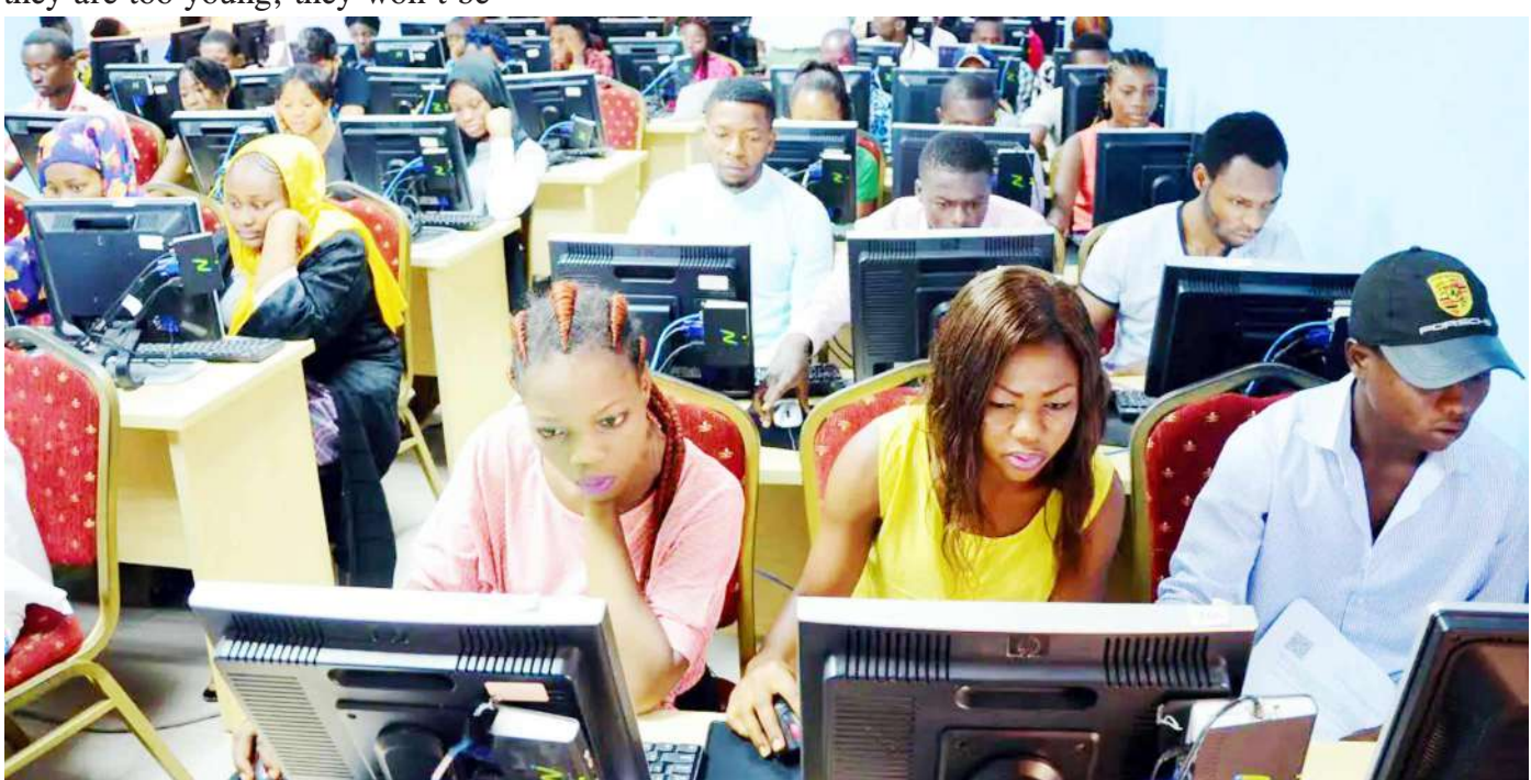
Students writing the UTME in one of the centres

Asked to explained where the other 80 percent will go, he said: "They are our children, our wards living with us. This is why the issue of skills acquisition is very important because any student who is not able to proceed to tertiary education, should be able to have a meaningful life after secondary school or even primary education."