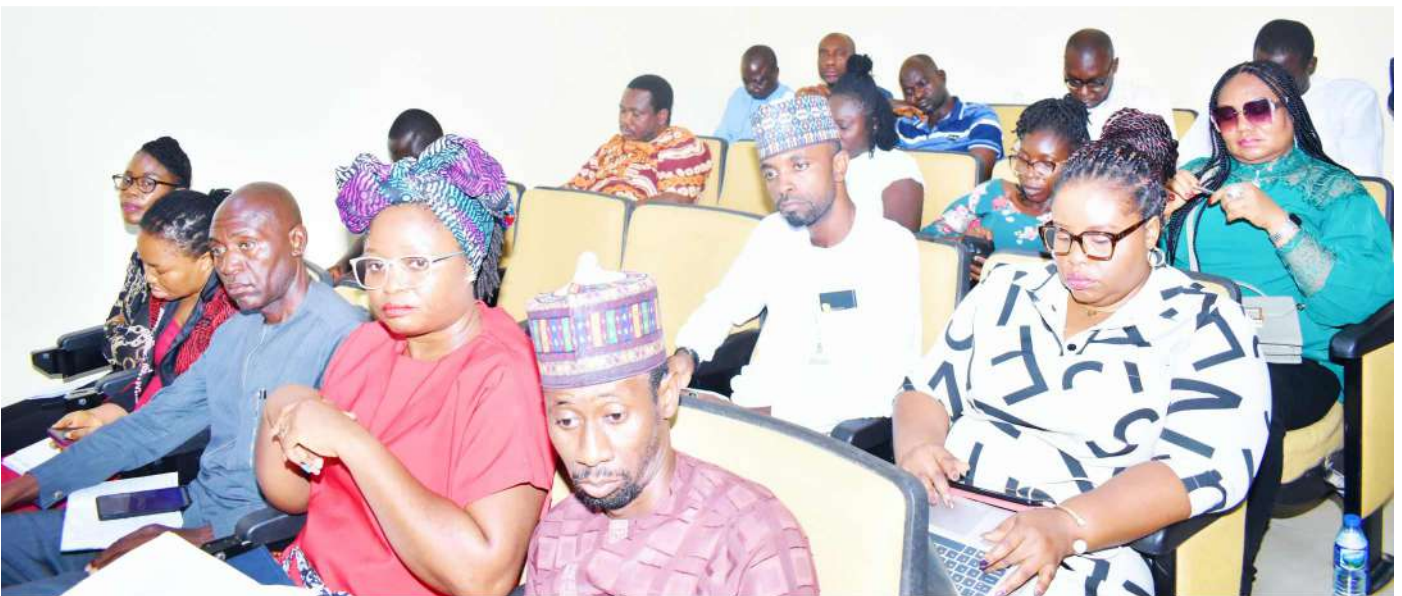
Some of NUC Staff that accompanied the Acting ES to the ECAN Congress alongside some members of the Education reporters at the event