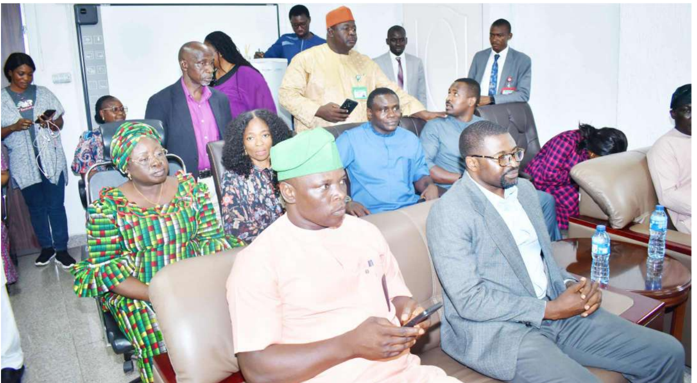
Some of the Visiting members of the Governor's entourage (front row) with other Acting Directors at the meeting