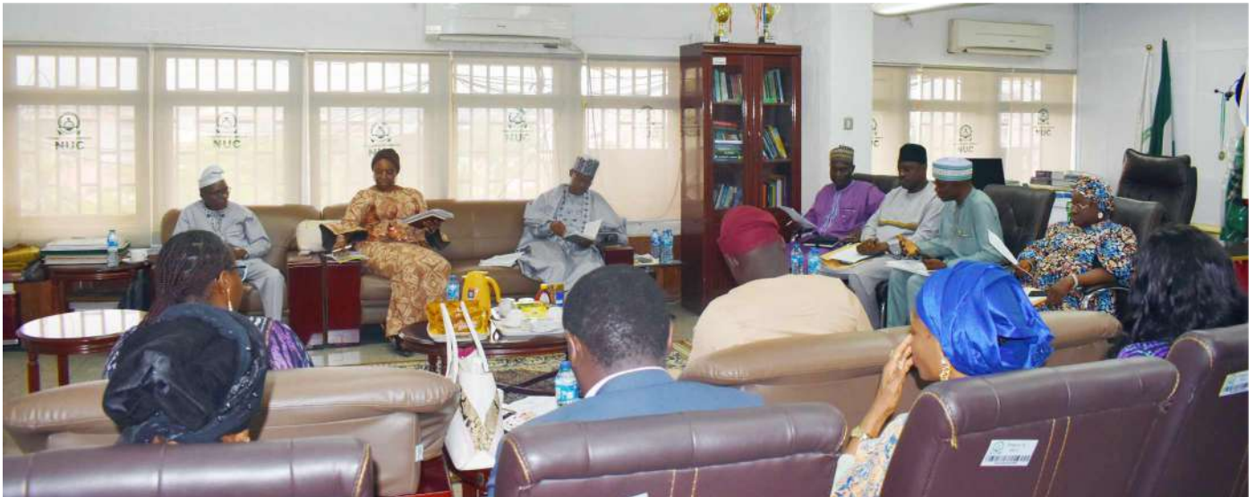
The meeting of the Acting ES, NUC and his Management with the LASG officials in session

access, there was now guidelines for operating open private universities, all meant to ensure quality is maintained in the Nigerian University System.