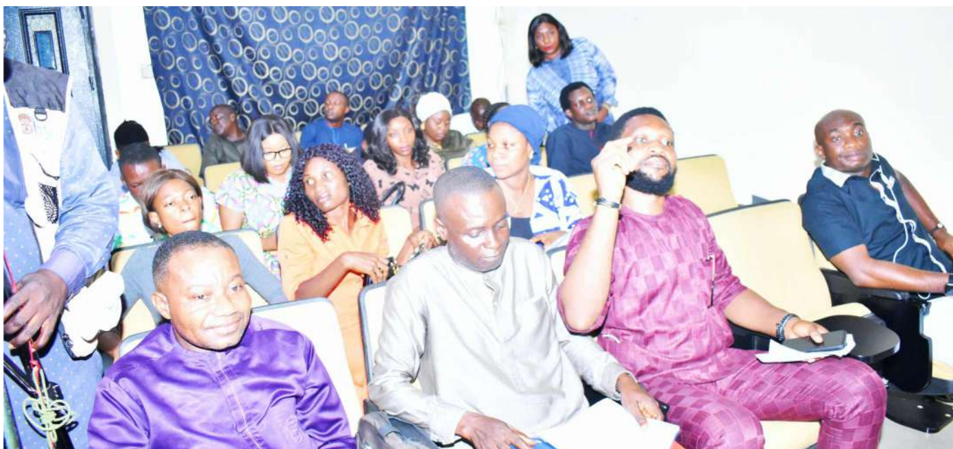
A cross section of other ECAN members at the Congress held in Abuja

curricula came into effect in September 2023, beginning from the 2023/2024 academic session.