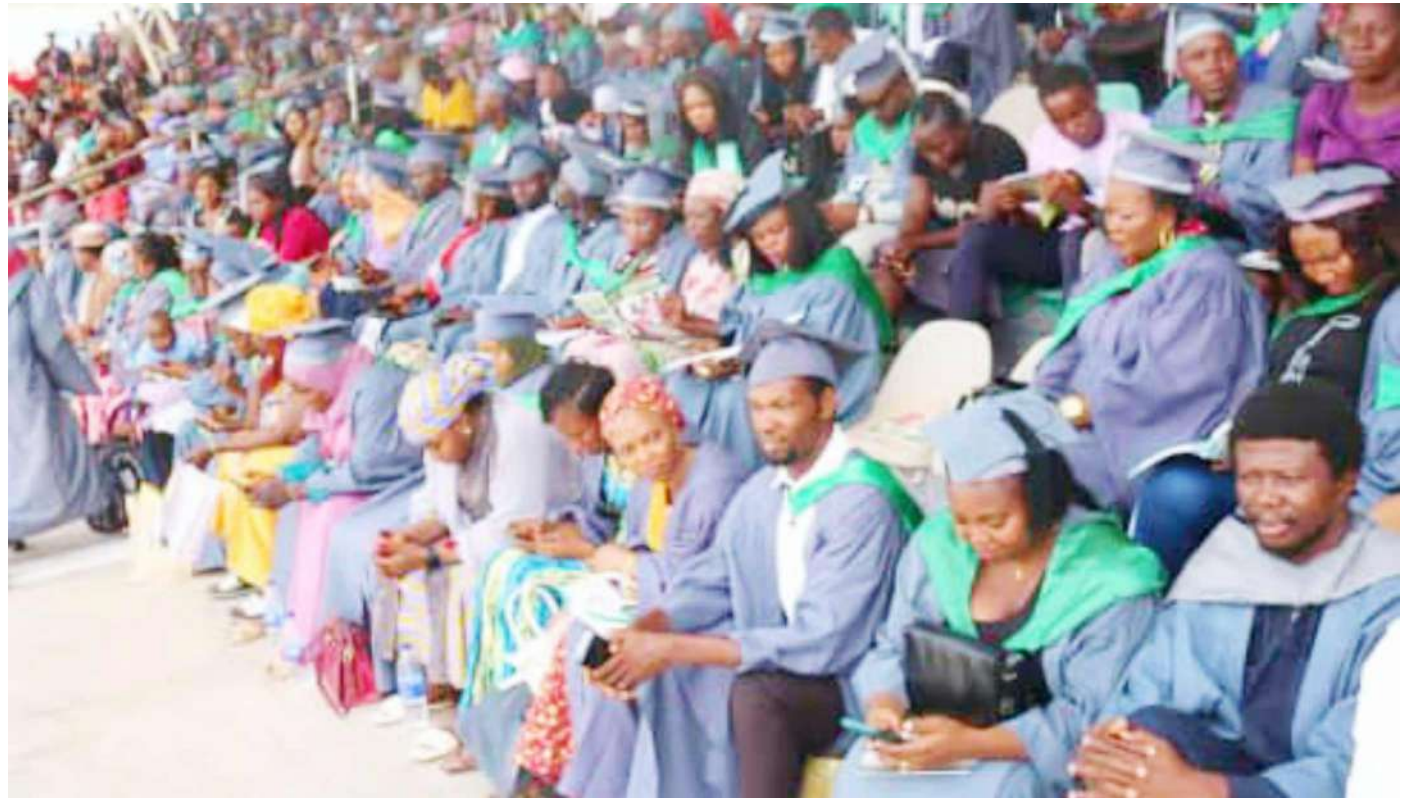
A cross section of some of the graduands at te NOUN Convocation

The traditional ruler advised the graduands in the University to be