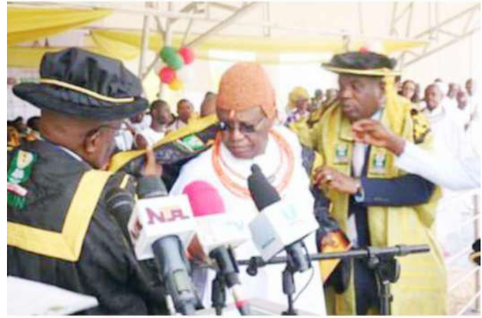
The installment of the Oba of Benin, Omo N'oba N'Edo, Uku Akpolokpolo, Ewuare II as the Chancellor, NOUN