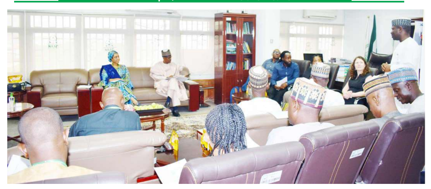
The meeting of the Acting Executive Secretary with the University of Waterloo, Ontario Canada and University of Abuja delegation in session

continued to display attributes that make it truly international as can be seen, as Nigerian students continue to dominate the university educational space in many countries including (Canada) and parts of Europe, coming out with good and productive grades.