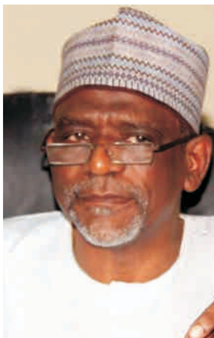
Mal. Adamu Adamu Minister of Education

I n a bid towards increasing the number of quality teachers in the country,