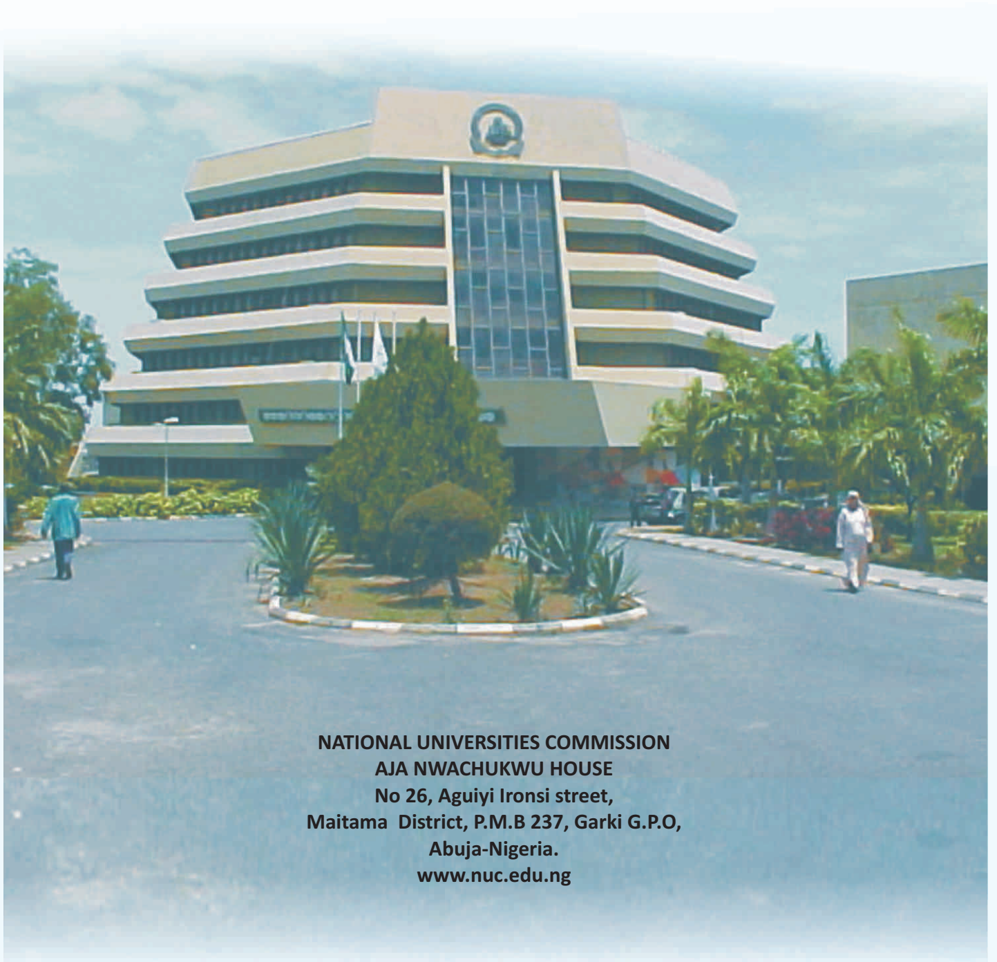
NATIONAL UNIVERSITIES COMMISSION AJA NWACHUKWU HOUSE No 26, Aguiyi Ironsi street, Maitama District, P.M.B 237, Garki G.P.O, Abuja-Nigeria. www.nuc.edu.ng