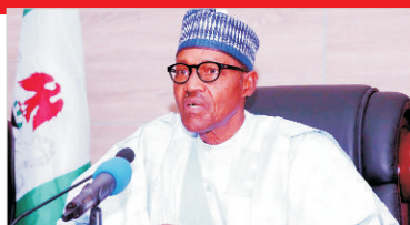
Ensure Training of Quality Agric Professionals — President Buhari to Agric Varsities Pg. 4