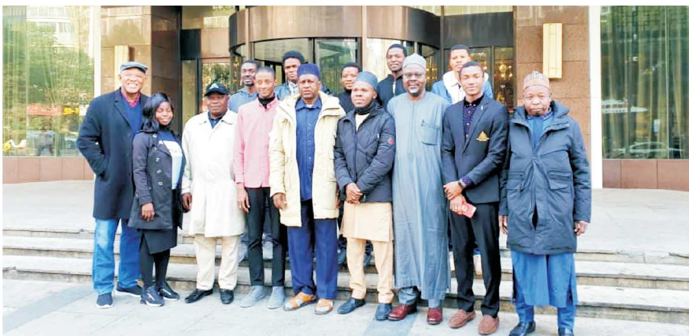
A group photo of some of the students who came to bid the team farewell at their hotel

degrees in Traffic and Transportation Engineering, Railway Equipment and Control