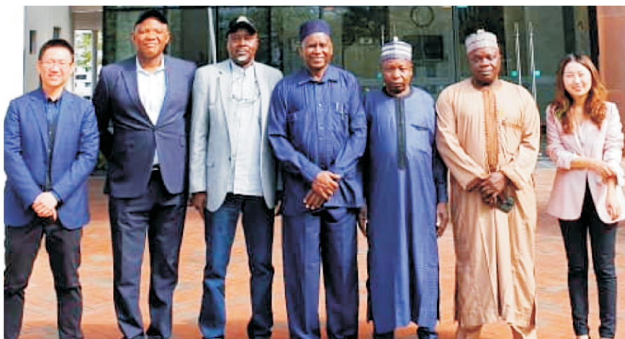
The team at Southern University of Science and Technology (SUSTech) in Shenzhen where ABU is exploring other areas of collaboration

They narrowed the challenges they were facing to cultural barriers and inclement weather. The students were pursuing bachelors and post graduate