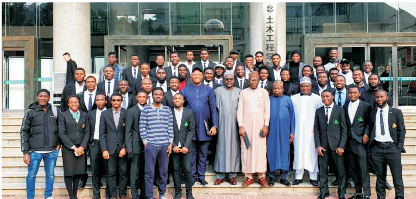
The VC, NUC and ABU Directors in a group photo with the students

them to continue to do well and “for me to bid your farewell as my tenure as Vice Chancellor is