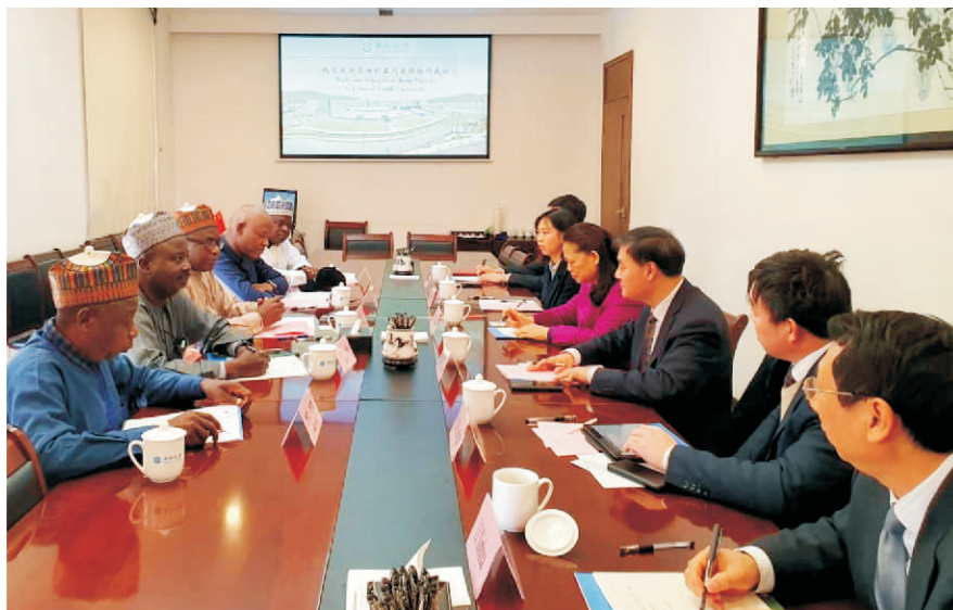
A meeting between the CSU team (right) and the Nigeria team (left)

which he said were to continue to monitor the progress of the students, continue to motivate