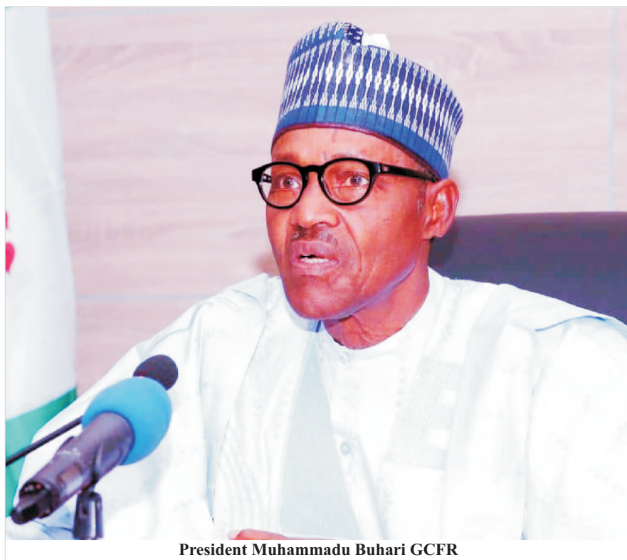
President Muhammadu Buhari GCFR President and Commander-In-Chief of the Armed Forces

especially that universities of Agriculture are expected to fast-track agricultural development for food