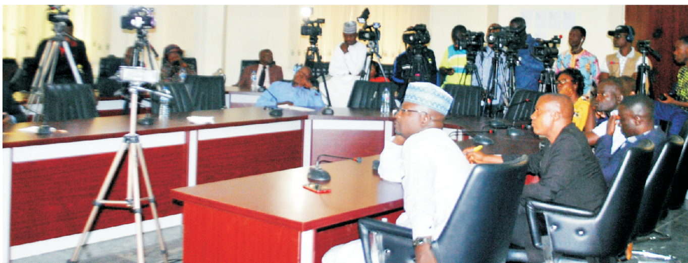
Cross section of Pressmen

He said the commission had continued to deliver on its mandate with deligent, especially accreditation of programmes offered by the universities in the country.