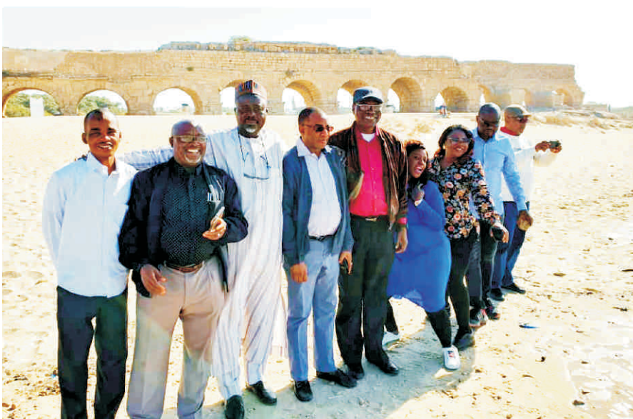
At the Caesarean Aqueduct