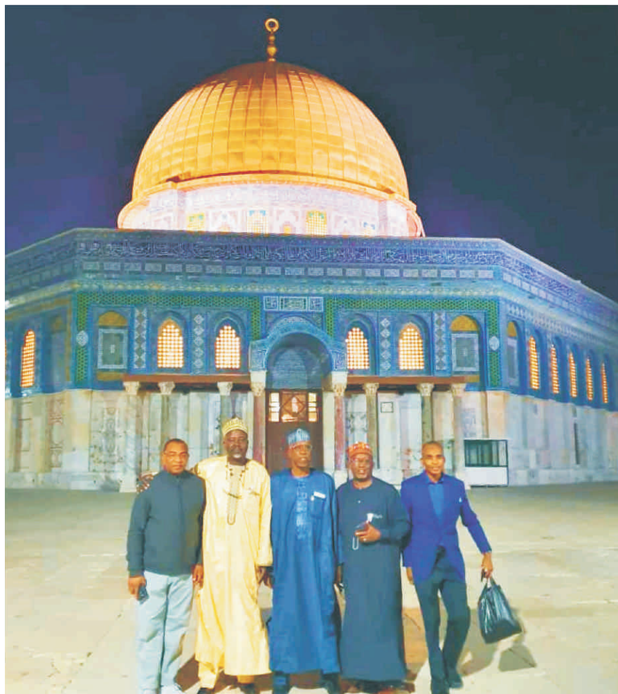
At Al-Aqsa Mosque