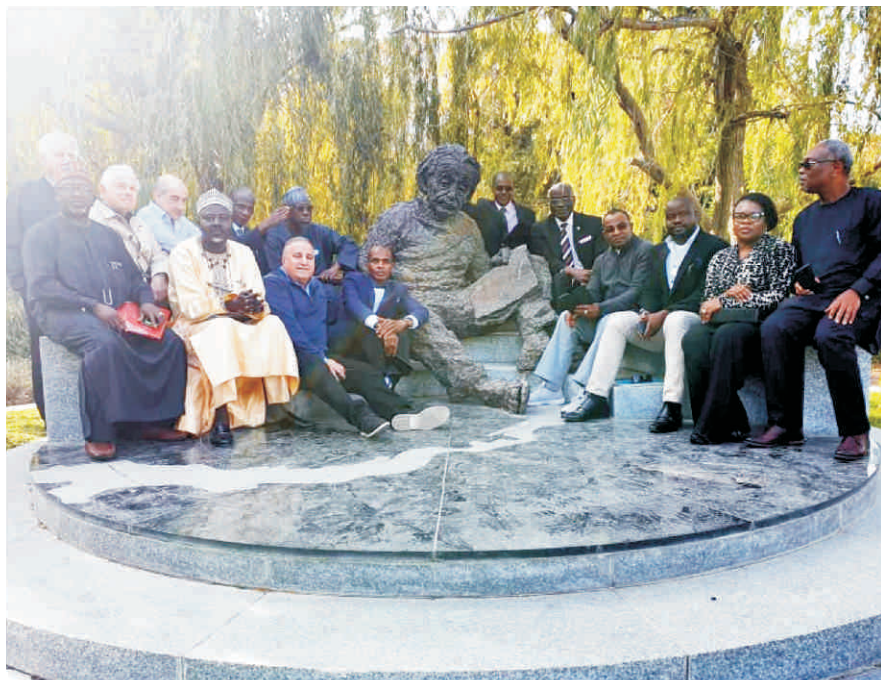
Einstein sculpture at the Israel Academy of Science and Humanities, Jerusalem

innovation and technology to fail and that was why the authority and the Israeli government did not bother about failure.