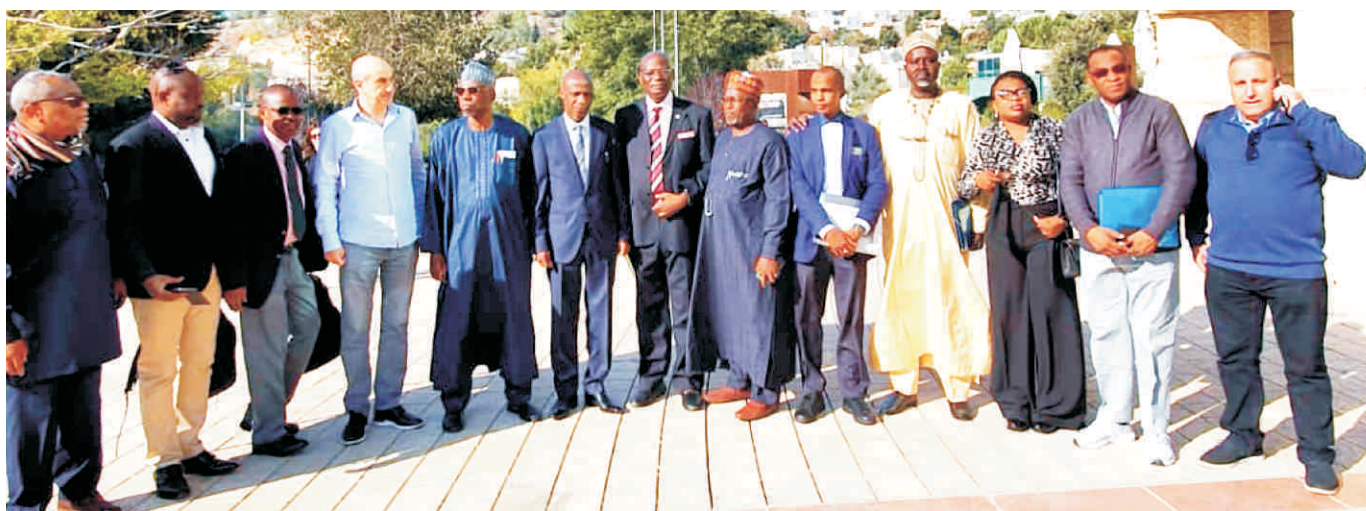
The entire delegation outside the Israel Innovation Authority