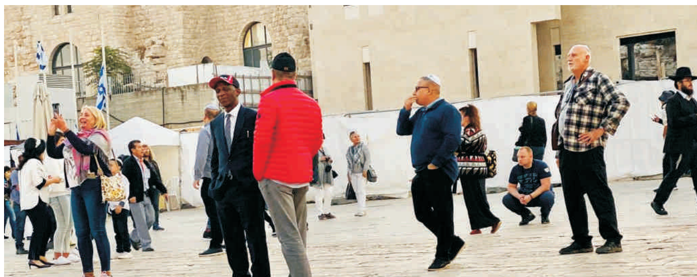
At the Wailing Wall