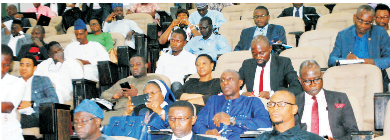
Cross section of audience at the event

University Backbone structured to comprise inter-building cabling with "Gateway"