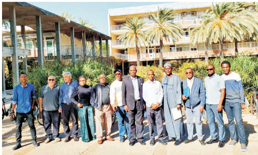
At the Faculty of Agric, Rehovot, Hebrew University