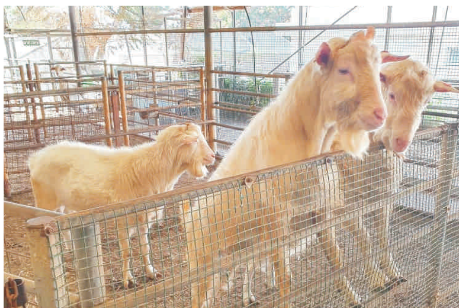
Goats at the Dept. of Animal Sciences, Rehovot

funds at least 50 per cent of the applications received, saying