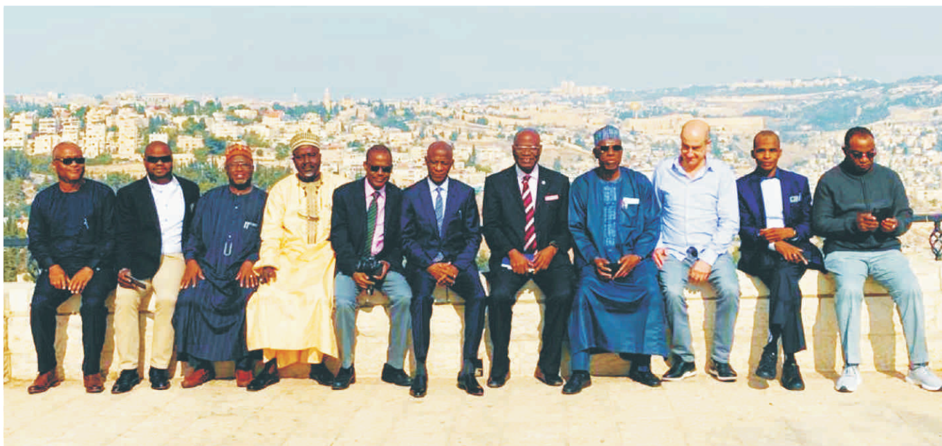
The entire Nigerian delegation in a group photo with Jerusalem as background

the day little value was added because the supervisor himself was not well informed on the issue and would therefore not guide properly.”