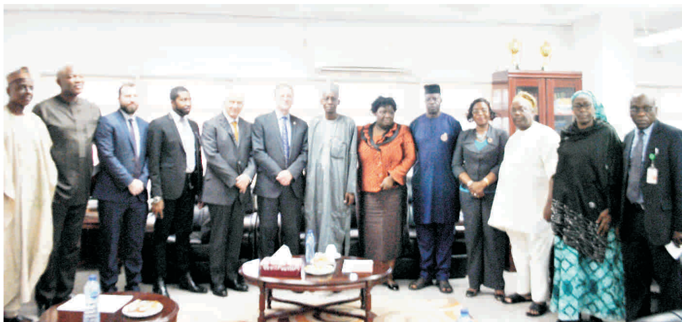
NUC, UoL Delegation in a group photo

The MoU also covered training workshops run by CDE Fellows for senior ODL practitioners and leaders in Nigerian universities