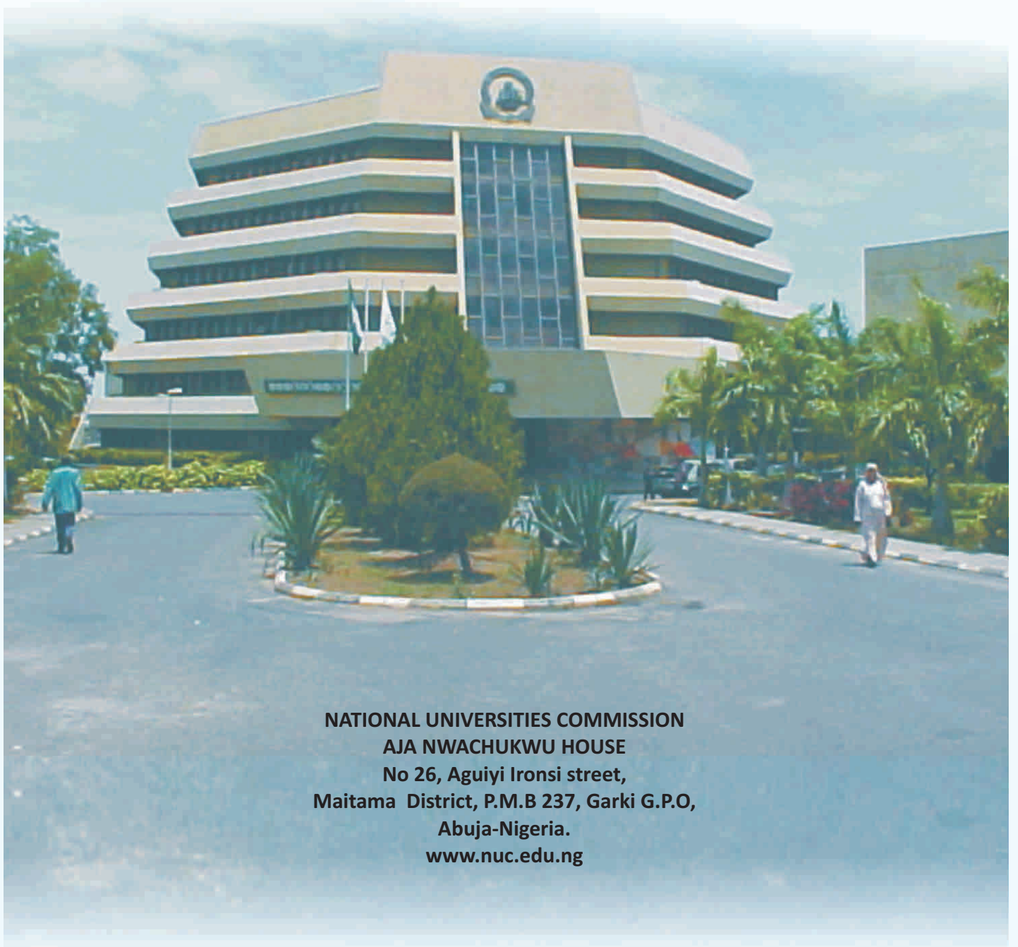
NATIONAL UNIVERSITIES COMMISSION AJA NWACHUKWU HOUSE No 26, Aguiyi Ironsi street, Maitama District, P.M.B 237, Garki G.P.O, Abuja-Nigeria. www.nuc.edu.ng