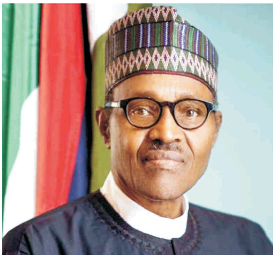
Muhammadu Buhari, GCFR President, Federal Republic of Nigeria

education and would continue to invest substantially in the