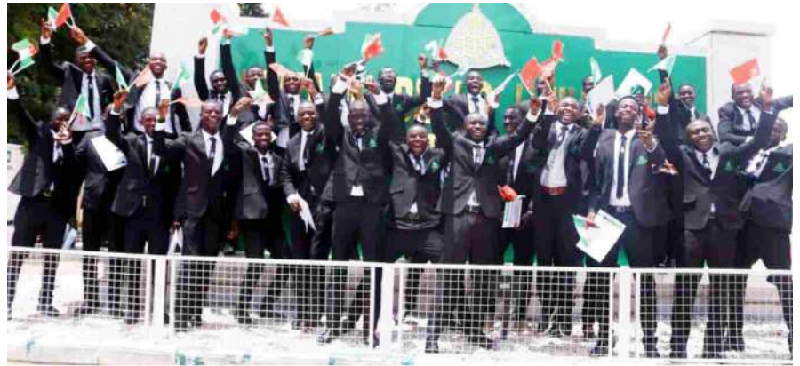
Bidding bye-bye to ABU

Nigeria as an opportunity to educate Nigerians towards building a vibrant nation that could stand the test of time.