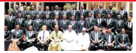
Joint Double Degree Programme: Second Batch of ABU Students Leave For China