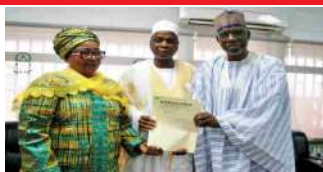
Katagum Emirate To Establish Community Varsity