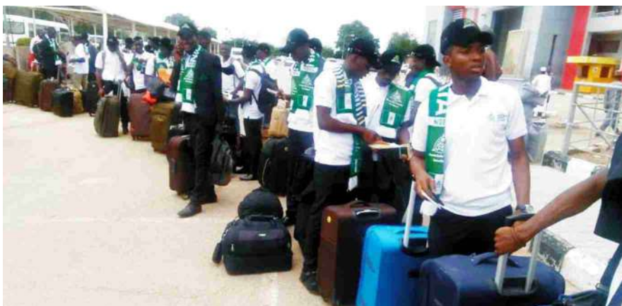
At the Airport ready to depart

amount of resources to build the railway infrastructure all over the country.