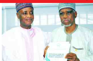
Sen. Wamako Picks Form For Private University