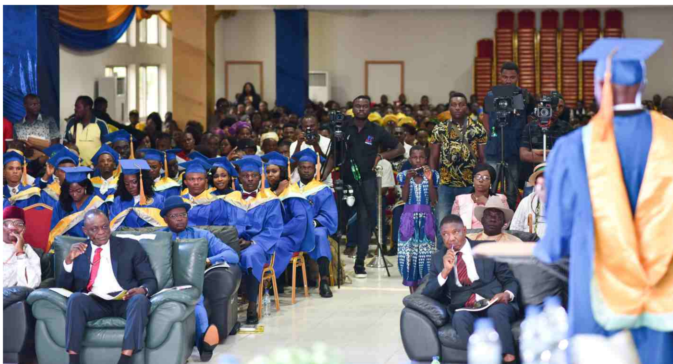
Representative of Gov. of Delta State and Commissioner for Higher Education (1st left front row) with other graduands