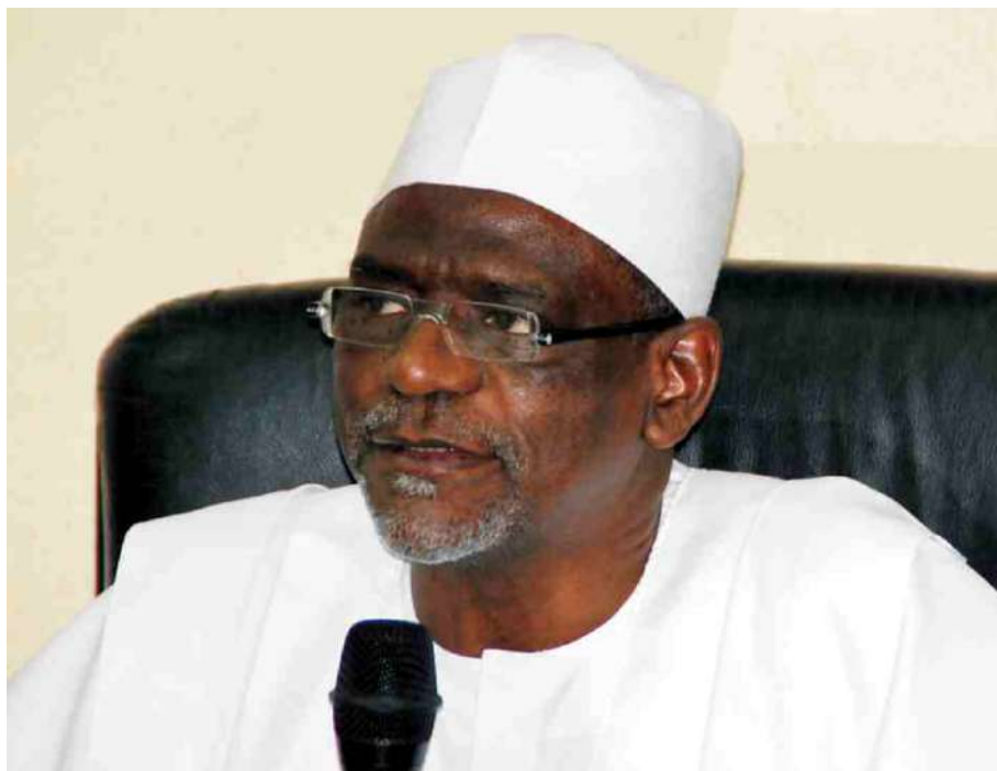
Mal. Adamu Adamu Minister of Education