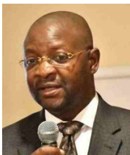
Sunday Akin Dare Minister of Youth and Sports Development

geopolitical zones and confer on them Centres of excellence and