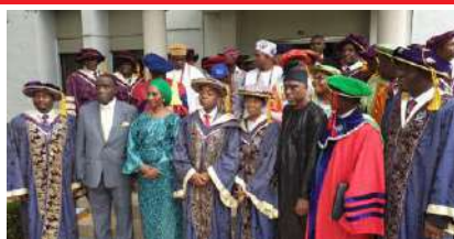
Covenant Varsity Produces 215 First Class, Out of 1,341 Pg. 4