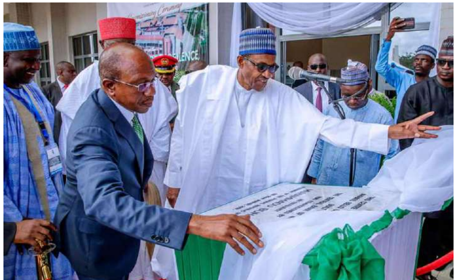
President Buhari unveiling the plaque to commission the Business School

Emefiele also said the bank’s analysis of the factors responsible for the growth of successful