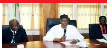
Convert National Hospital To Medical University