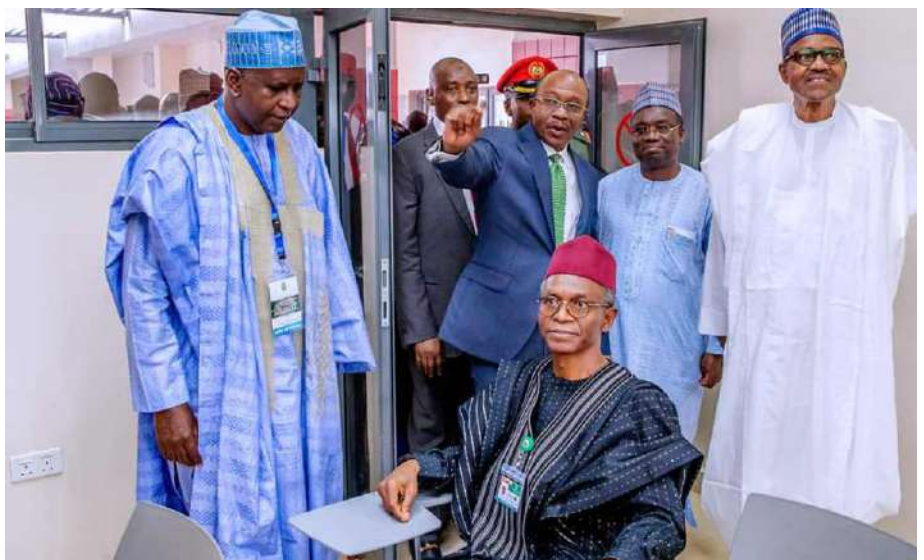
President Buhari admiring the inside of the Business School

economies indicated that investment in education sector could play a prominent role in