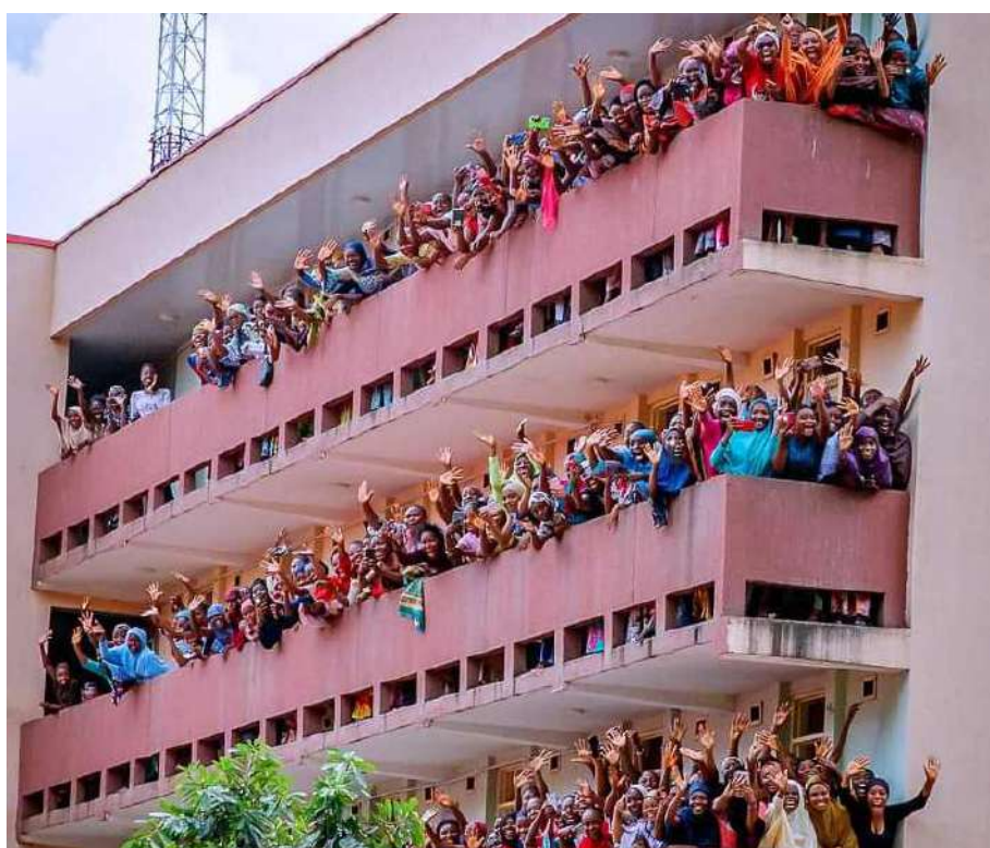
ABU students welcoming President Buhari to their Campus

which would anchor the University's postgraduate training