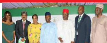
Osinbajo Commissions Solar Hybrid Project at Alex Ekwueme Varsity