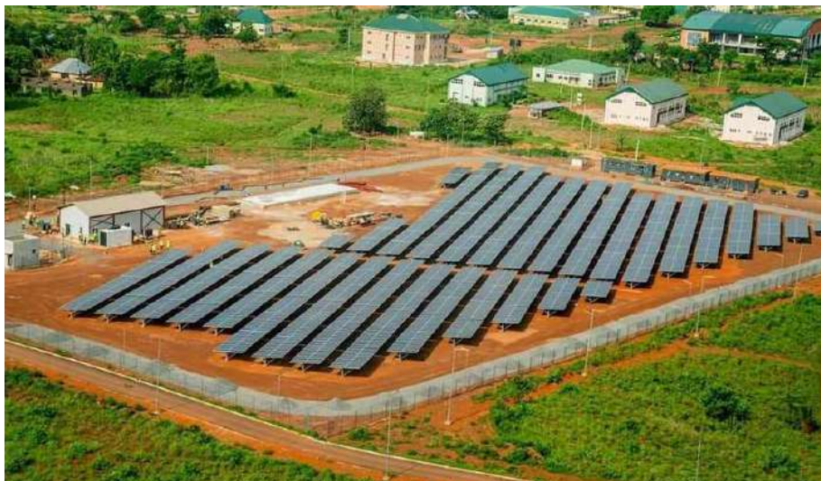
The solar project in view

The Executive Secretary, National Universities Commission (NUC),