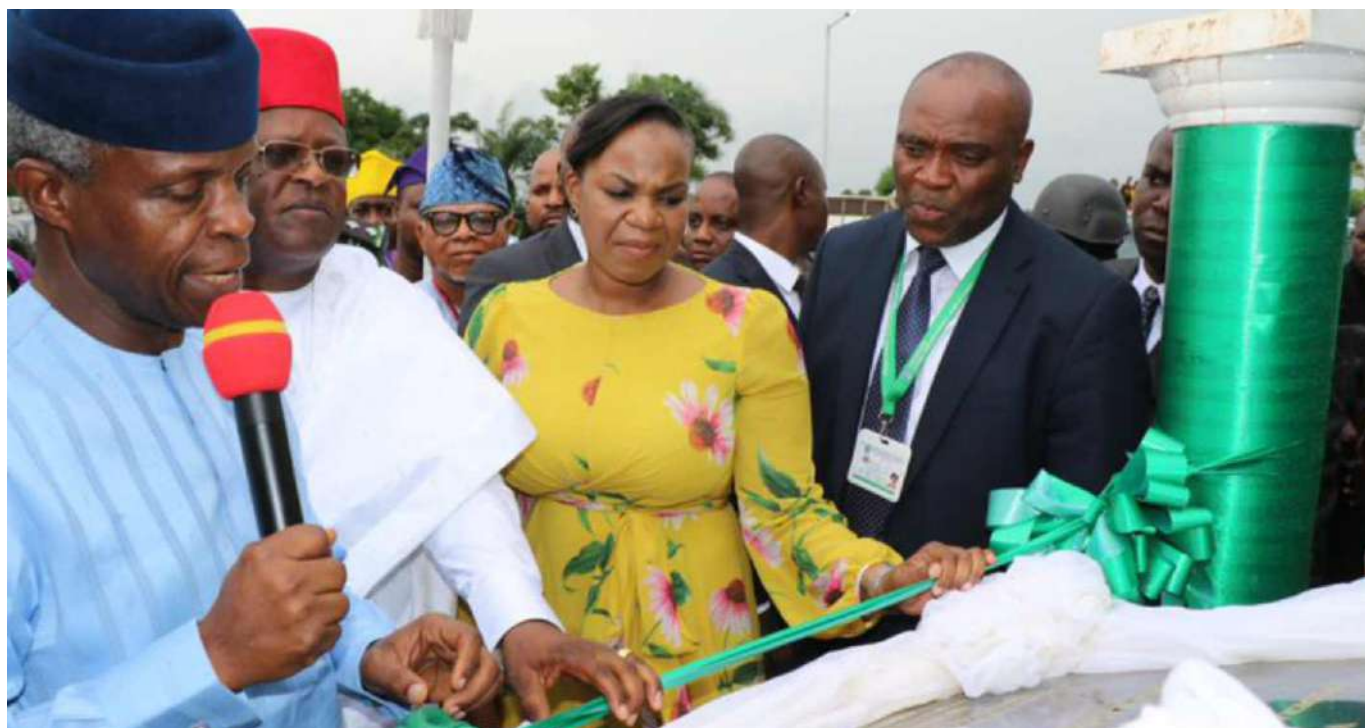
Vice President Osinbajo commissioning the Solar Hybride

She also stated that towards fulfilling one of the cardinal objectives of the Sustainable Development Goals (SDGs) of the United Nations on gender equality, the project was designed in such a way that women played key roles in the implementation of the project.