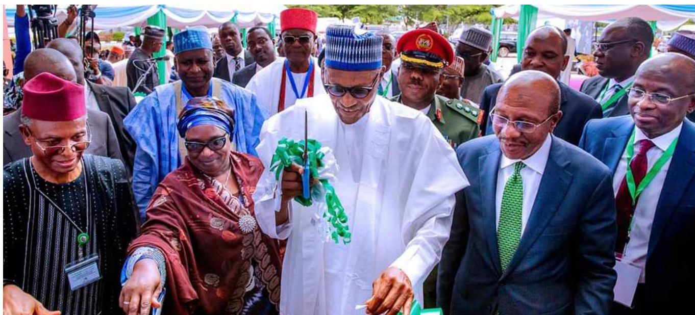
President Buhari Commissioning the Business School

“By this exercise, we are building on the vision of the founder of this