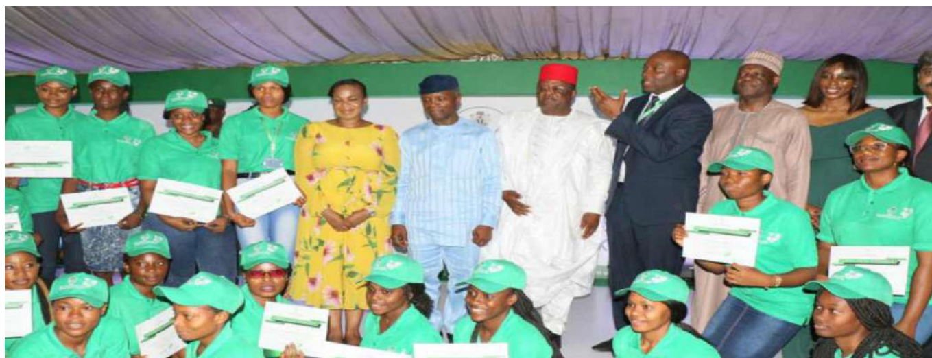
L-R: The MD/CEO REA, Vice-President, Governor Ebonyi State, VC-FUNAI, Perm-Sec of FM Education, HOD Special Project, CEO Sterling and Wilson with the 20 Female STERM student of FUNAI

Professor Abubakar Adamu Rasheed, mni, MFR, FNAL, was