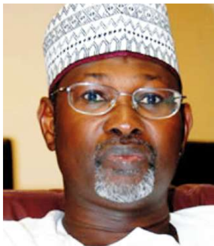
Prof. Attahiru Jega

universities to attract Nigerian education institutions.