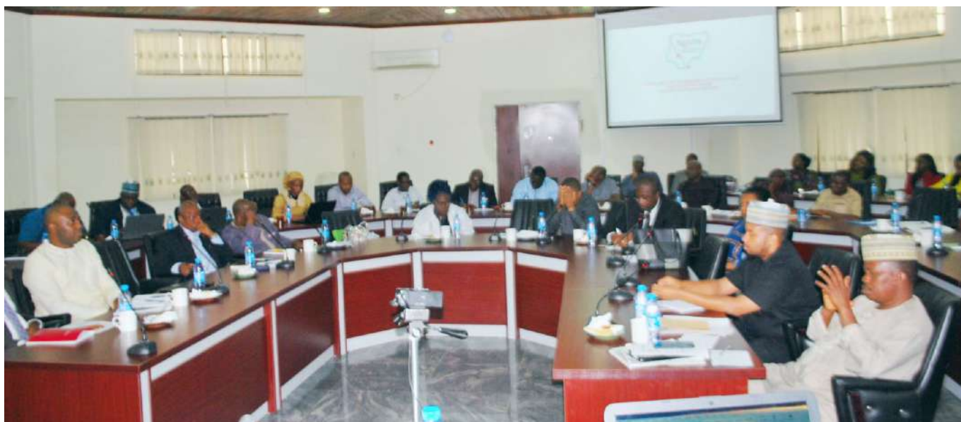
The meeting in session