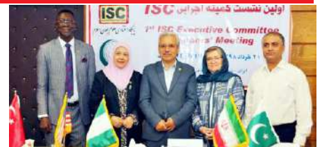
Nigeria Attends Islamic World Science Citation Forum at Iran