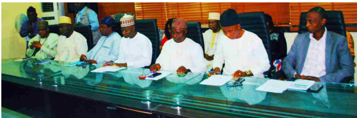
Directors of FME during the meeting

vii. To advise on any or all other aspects of the Institution that the panel consider should be of interest to: both the Nigerian Government and the public, and to the attainment of the objectives for which the Institution was licensed.