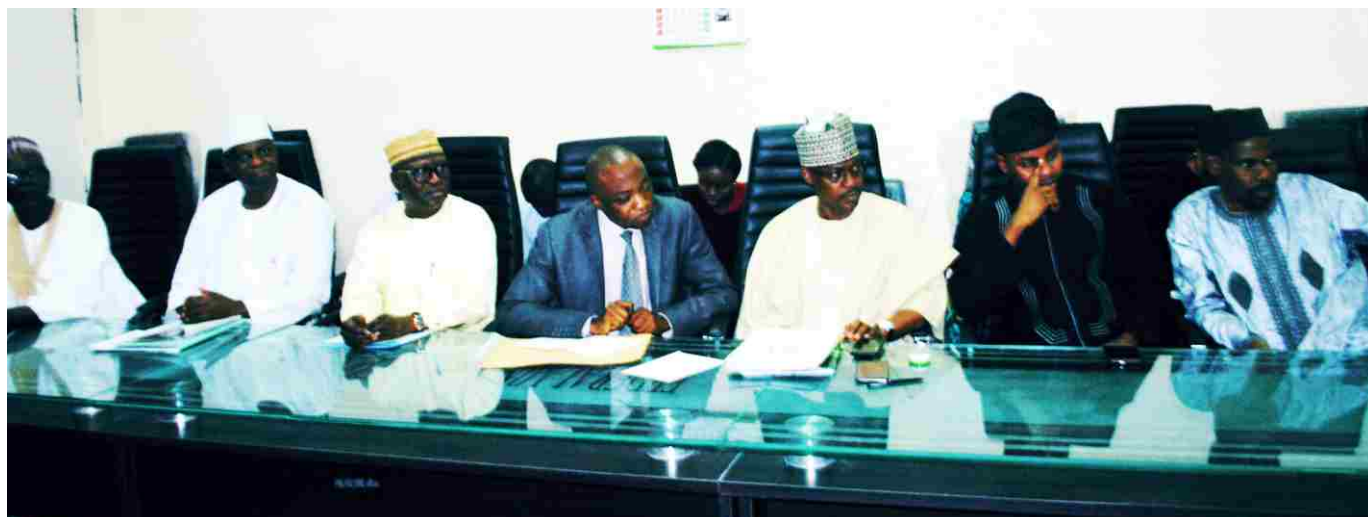
Members of the Audit Panel

It was pointed out earlier that the institution was jointly owned but the composition of the Board of