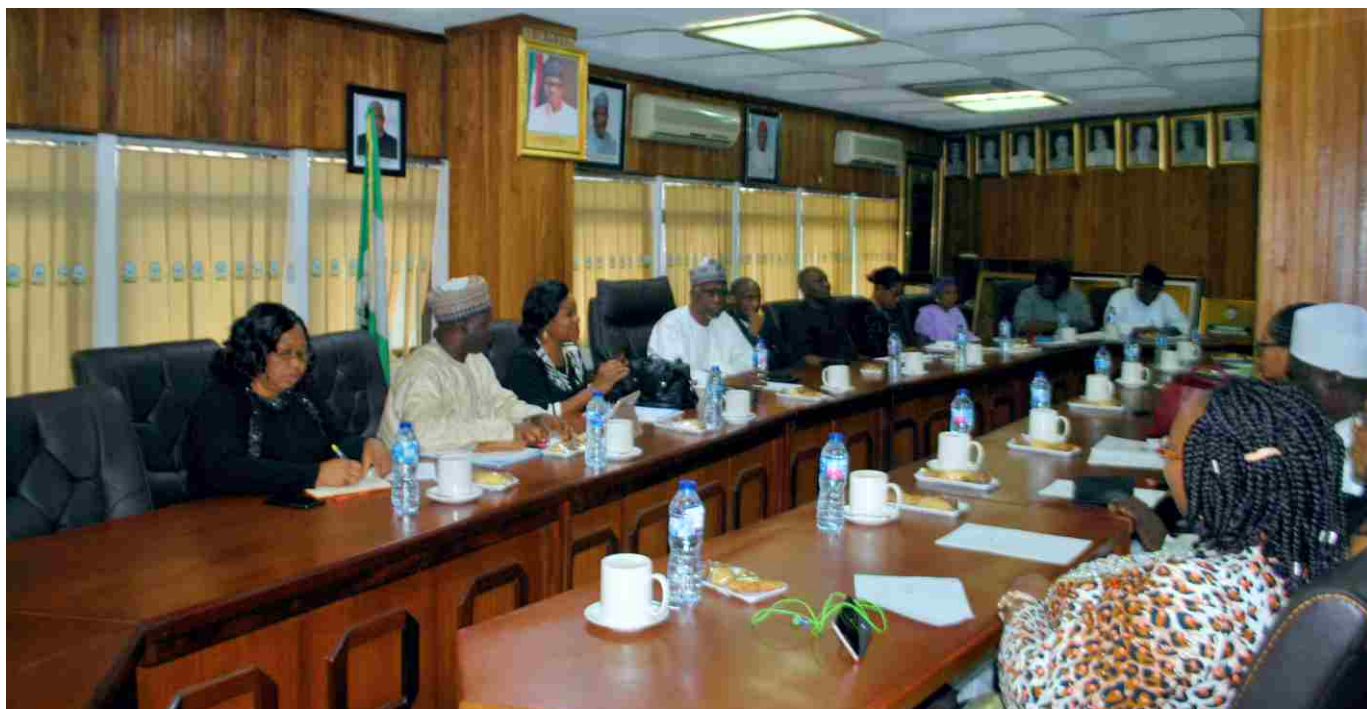
Meeting session with the NMCN