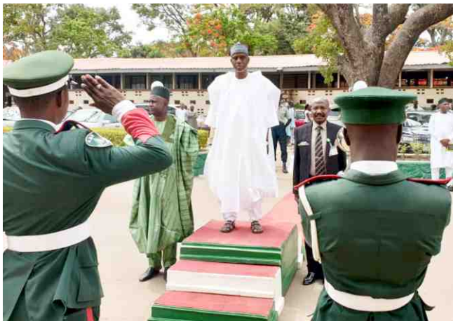
Quarter Guard for the Visitor