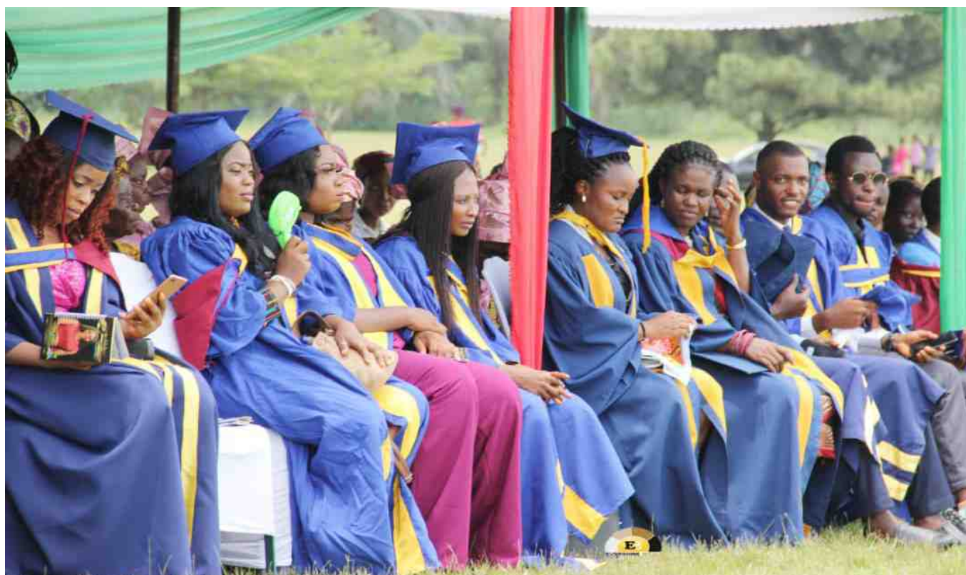
Cross section of graduands

He also admonished them to hold the ideals of the University very dearly contributing positively to the good name and brand development.