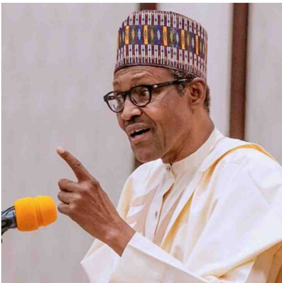
President Muhammadu Buhari, GCFR Commander-In-Chief of the Armed Forces