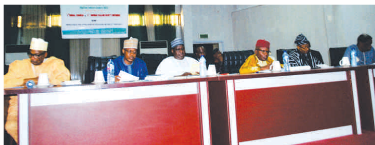
Nigerian Folklore Society Holds Annual Congress Pg. 8