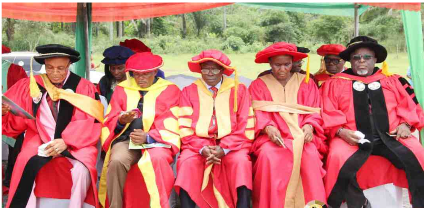
Principal Officers of Obong University