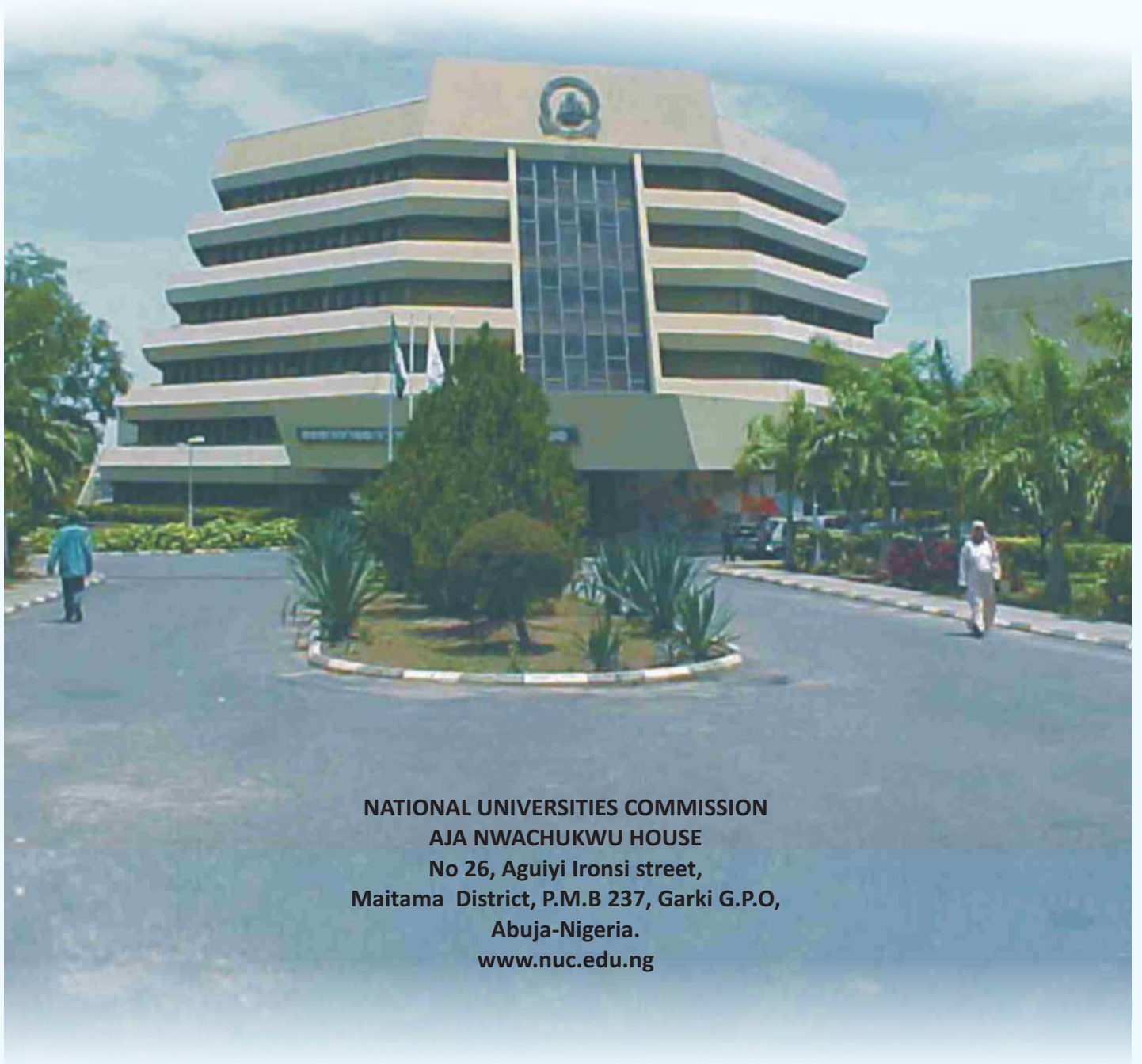
NATIONAL UNIVERSITIES COMMISSION AJA NWACHUKWU HOUSE No 26, Aguiyi Ironsi street, Maitama District, P.M.B 237, Garki G.P.O, Abuja-Nigeria. www.nuc.edu.ng