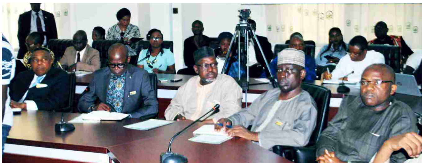
Participants at the interactive session