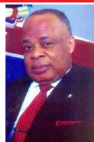
Education Creates Values for Democratic Societies