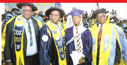
DELSU VC lists achievements at 13 th Convocation