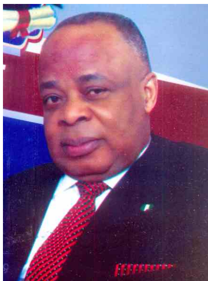
Senator (Dr.) Ken Nnamani Convocation Lecturer

The former Senate President noted with dismay that Nigeria followed the train of African