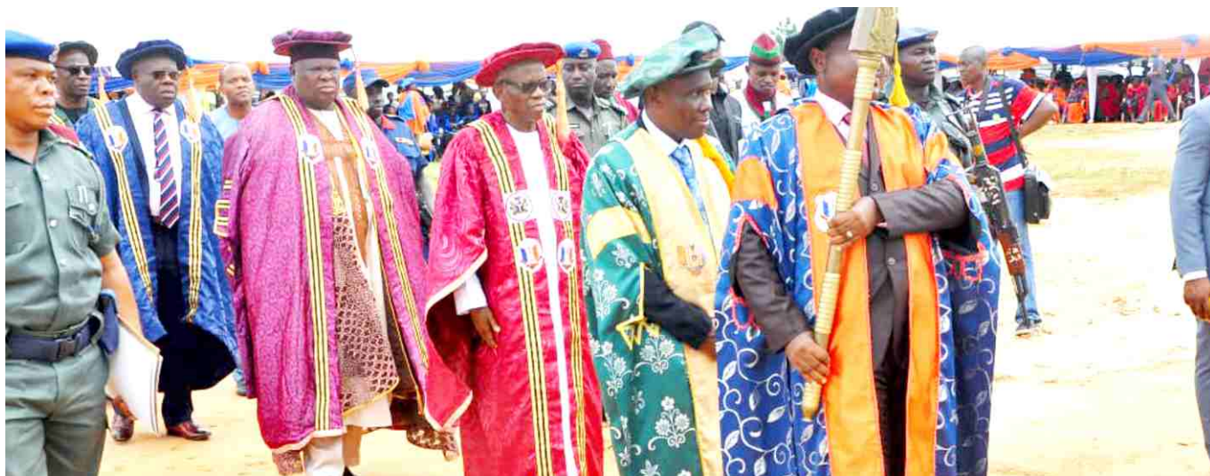
Recession after the convocation