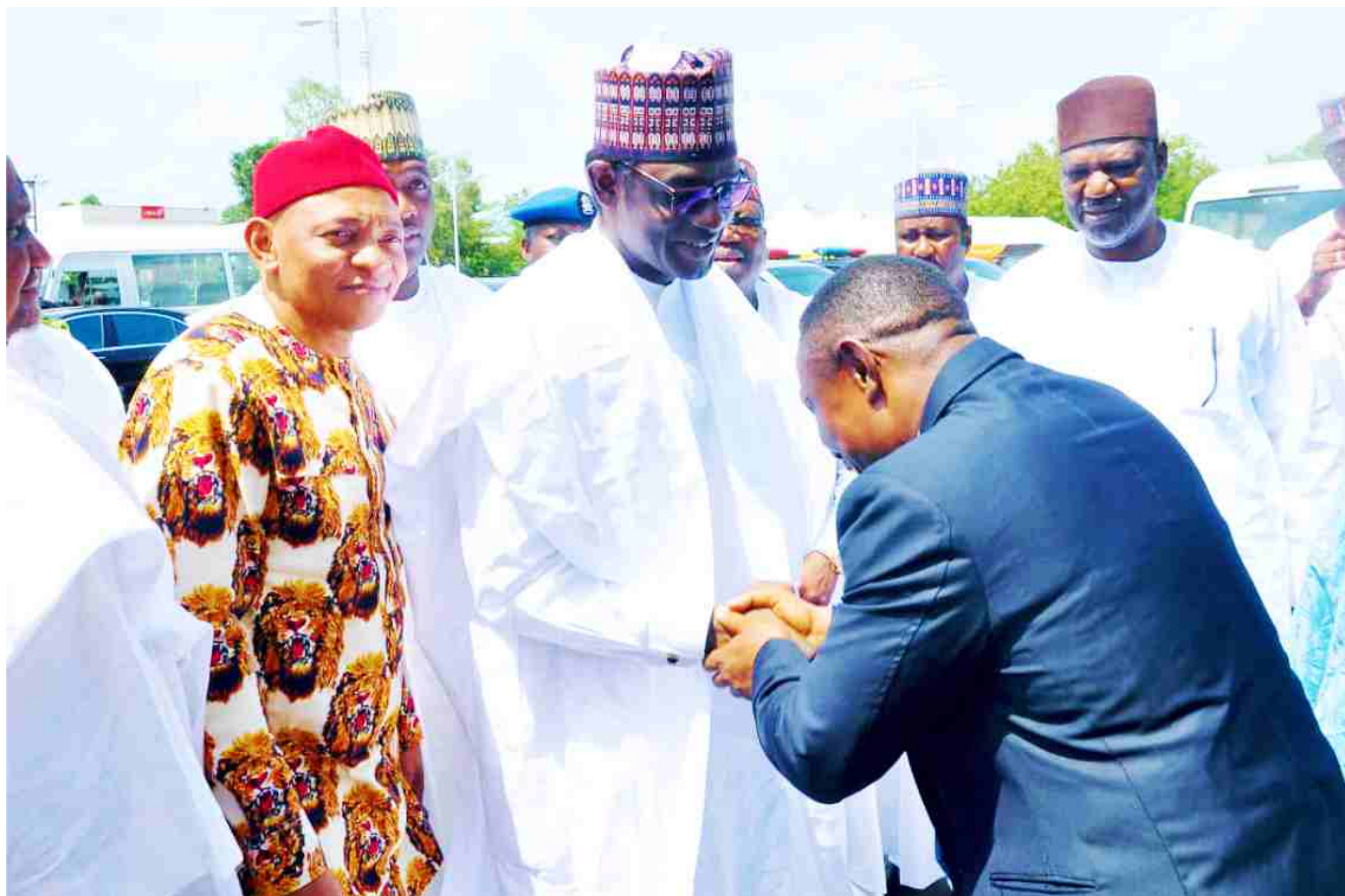
VC Ahaneku welcoming Yobe State Governor-elect, Hon. Mai Mala Buni