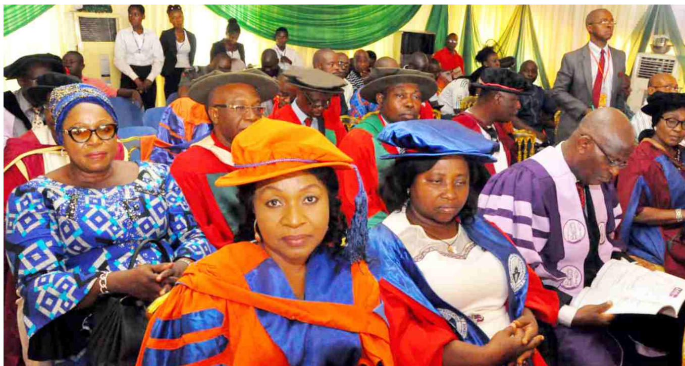
Cross section of graduands

The pro-chancellor felicitated with the graduands; their parents and guardians for being responsible and congratulated the vice chancellor for the eminent end of a successful tenure.