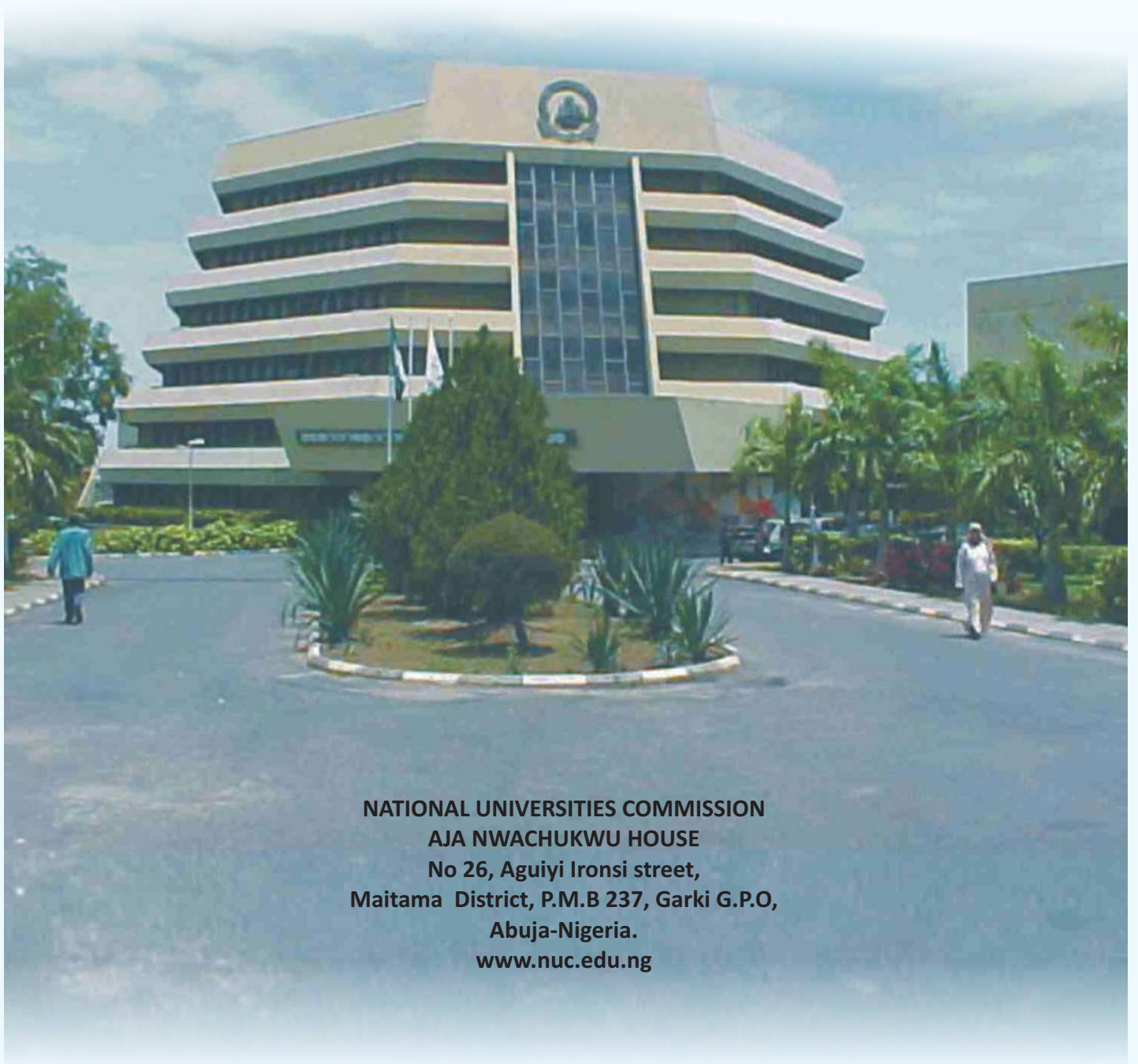
NATIONAL UNIVERSITIES COMMISSION AJA NWACHUKWU HOUSE No 26, Aguiyi Ironsi street, Maitama District, P.M.B 237, Garki G.P.O, Abuja-Nigeria. www.nuc.edu.ng