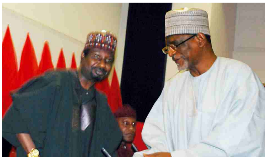
Senate committee Chairman on Tertiary Education and TETFund, Senator Jibrin Barau and Hon. Minister of Education, Mal. Adamu Adamu