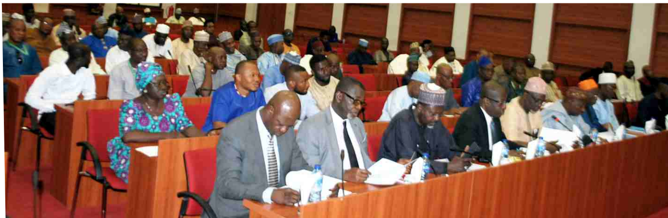
Cross section of Stakeholders at the Hearing