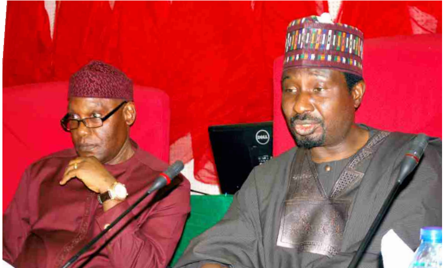
Senator Clifford Odiah and Senator Jibrin Barau during the 2019 Budget defence

children, youth and adult literacy, Science, Technology,