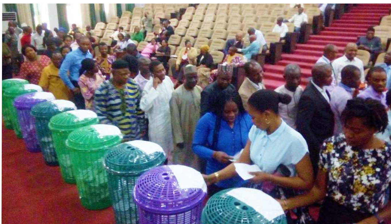
The voting exercise in process

Before the election, the various contestants had the opportunity to sale their candidacy during a Manifesto presentation held on the 12 th of February, prior to the election on the 26 th of February, 2019.