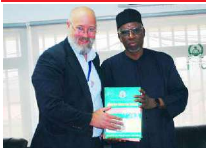
UNODC Wants To Partner NUC On E4J Pg. 5