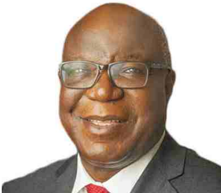
Professor Oyewusi Ibidapo-Obe,

According to him, nine per cent of the total 304 graduating students from across three colleges of the