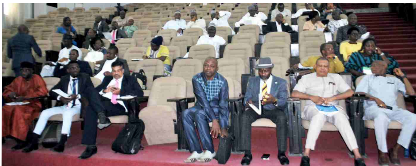
Stakeholders at the event