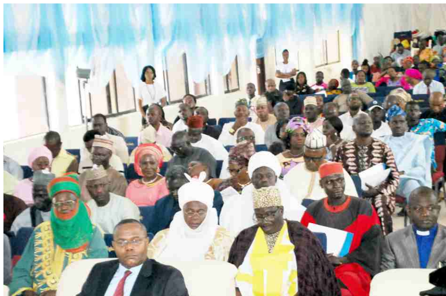
Traditional rulers at the event

University has a great future looking at the Educational System in Nigeria today calling all well-meaning individuals to avail their