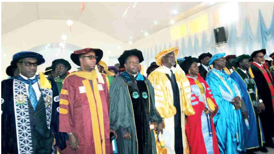
Cross section of Visiting Vice Chancellors

The Vice Chancellor emphasized that if the dream of Bingham University to be a world class university would be realised, the Management must evolved a