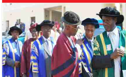
NUC Has Not Ranked Nigerian Universities