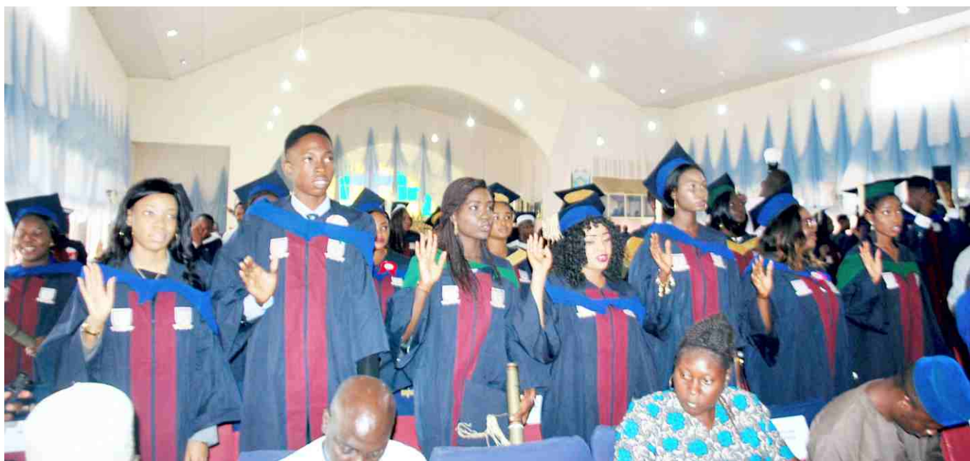
Cross section of graduands

support to the fund being suggested for infrastructural development as well as purchase of learning equipment, among others to build on the future of our children.