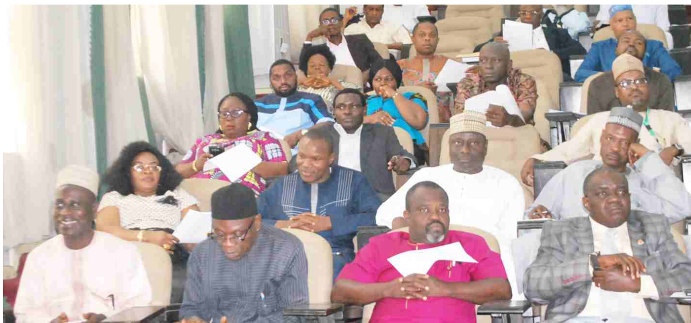
Participants at the event