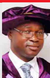
Varsities Must Imbibe Global Best Practices —VC MTU

....Prof. Rasheed at Bingham Convocation Pg. 7