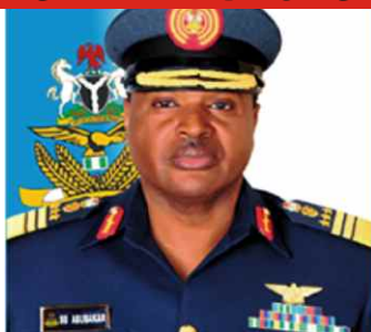
NAF Partners Varsities, Institutes On Research