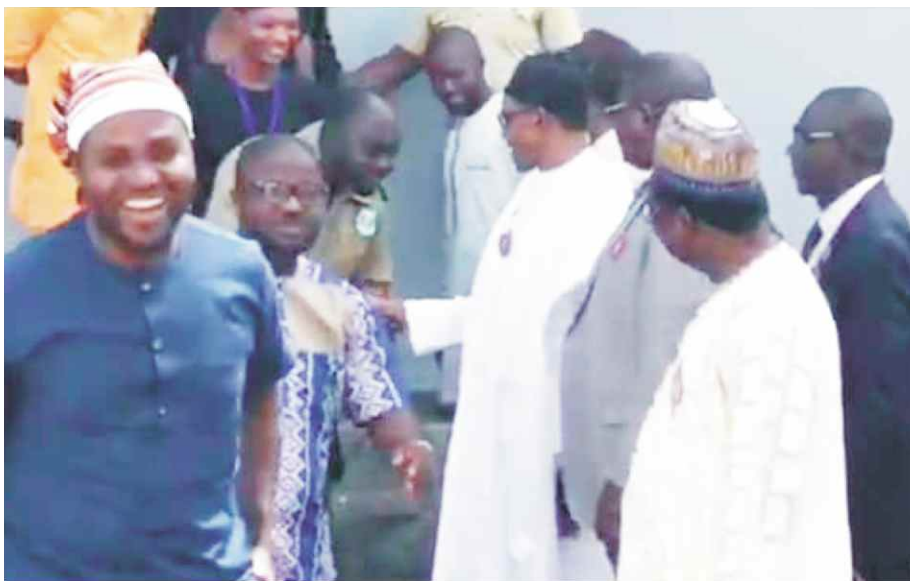
President Muhammadu Buhari with NANS members

"It is the responsibility of the government to look after the employed as well as the