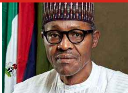
President Buhari approves 161b 2018 TETFUND Intervention Guidelines