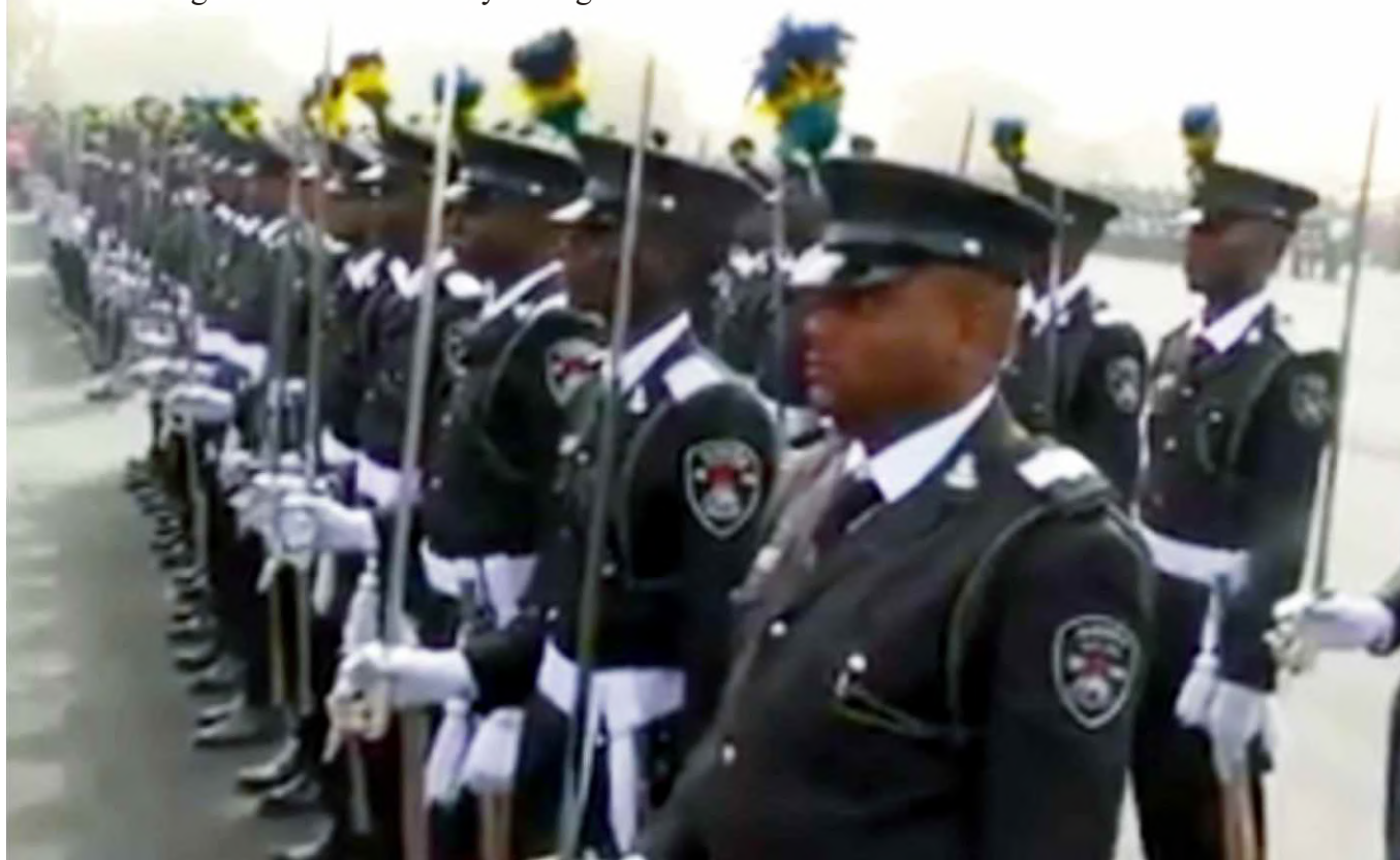
Graduating Cadet officers