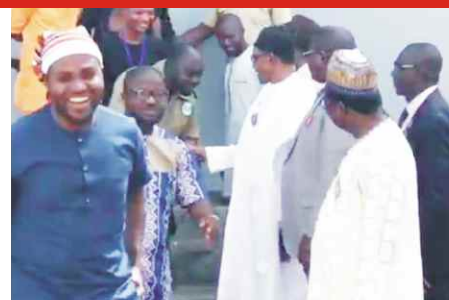
Strikes Distract Govt. from Development — Buhari tells unions