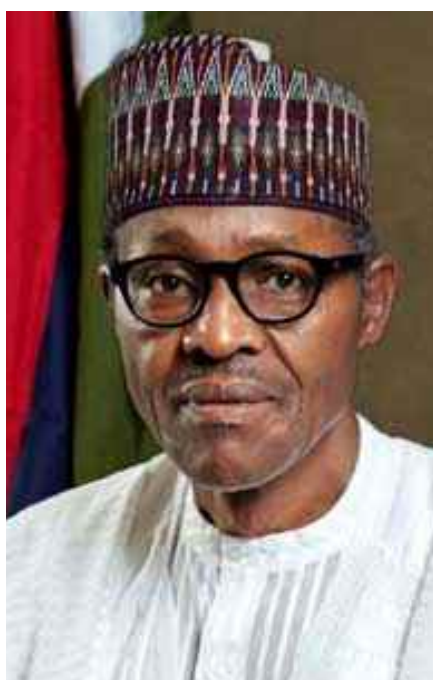
President Muhammadu Buhari, GCFR

President for the approval, describing it as a massive boost to higher education institutions, especially at a time when the country was just recovering from recession.