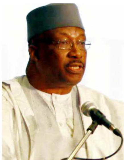
Abdulrahman Dambazau Minister of Interior

He warned them to avoid those acts capable of jeopardizing their careers and could be harmful to the nation. Mr Buhari called on