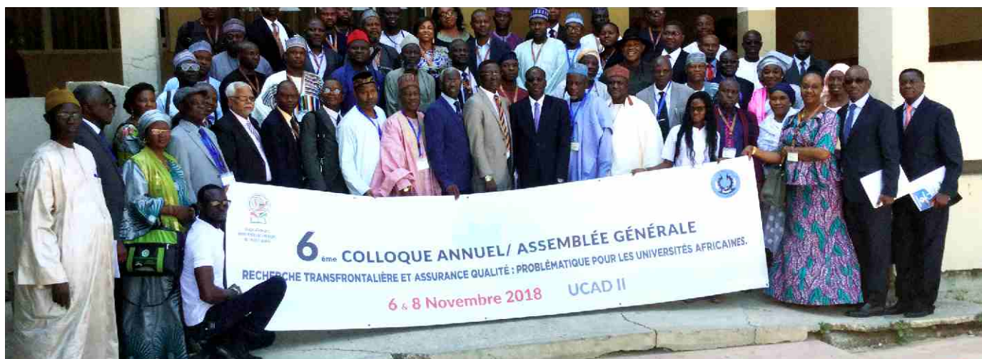
Participants at the 6th AWAU Conference held in Dakar, Senegal

The AWAU should liaise with member States to ensure that teaching and research in their