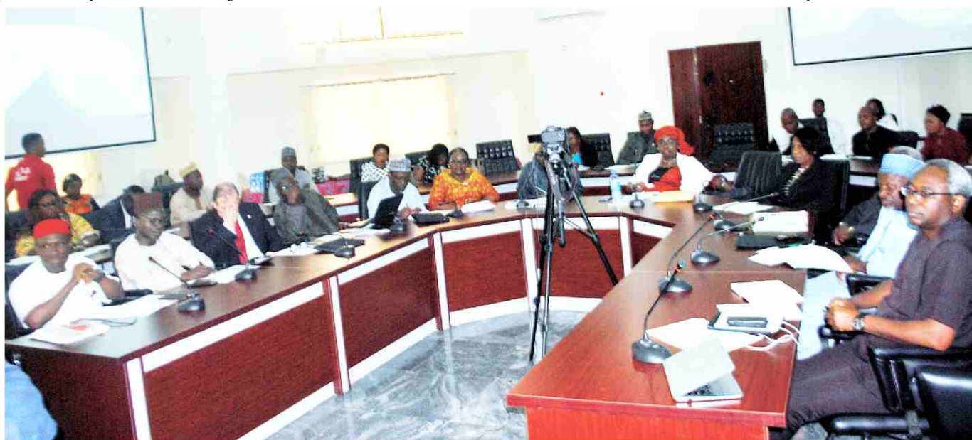
Roundtable with Vice-Chancellors of Nigerian Universities at NUC