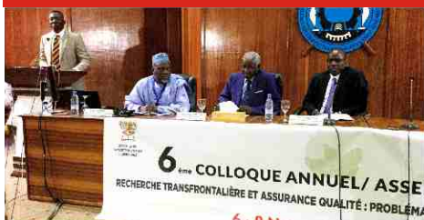
AWAU Holds 6th Conference, AGM in Dakar