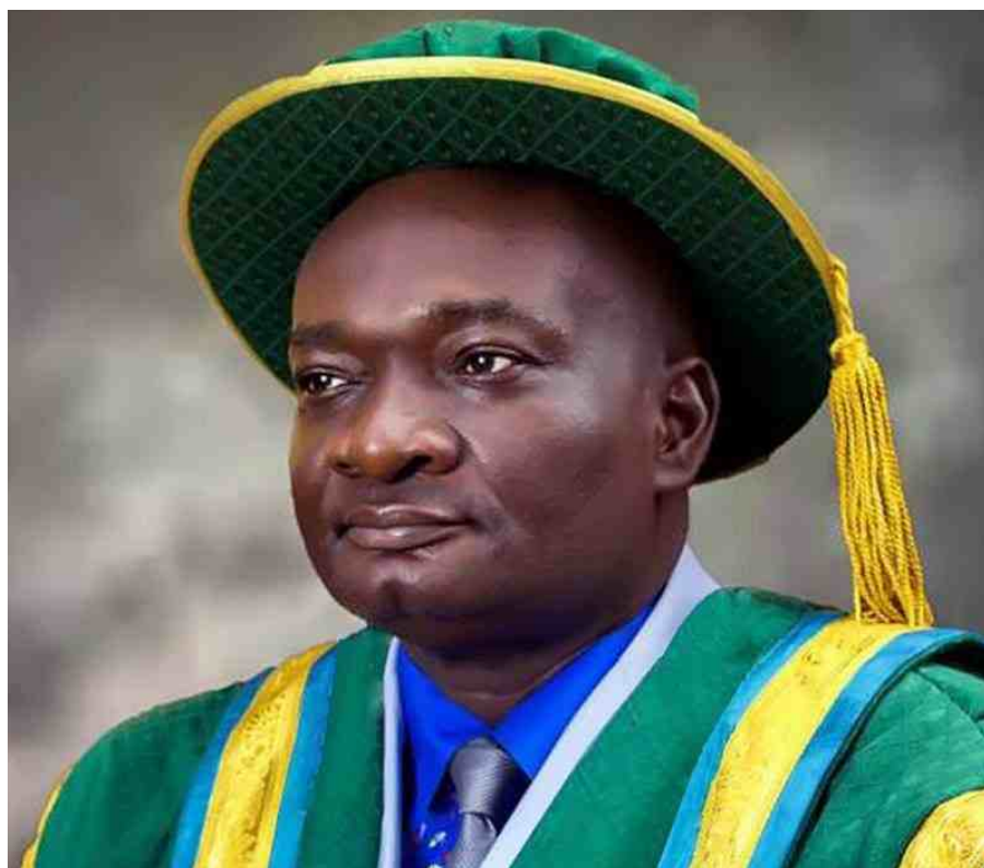
Prof. Kolawole Salako VC, FUNAAB

successfully placed on the Nigerian poultry market a dual purpose breed of chicken, tested under rural house-holds from September 2016 to December 2017, and was found to be one of the breeds preferred for egg production under semi-