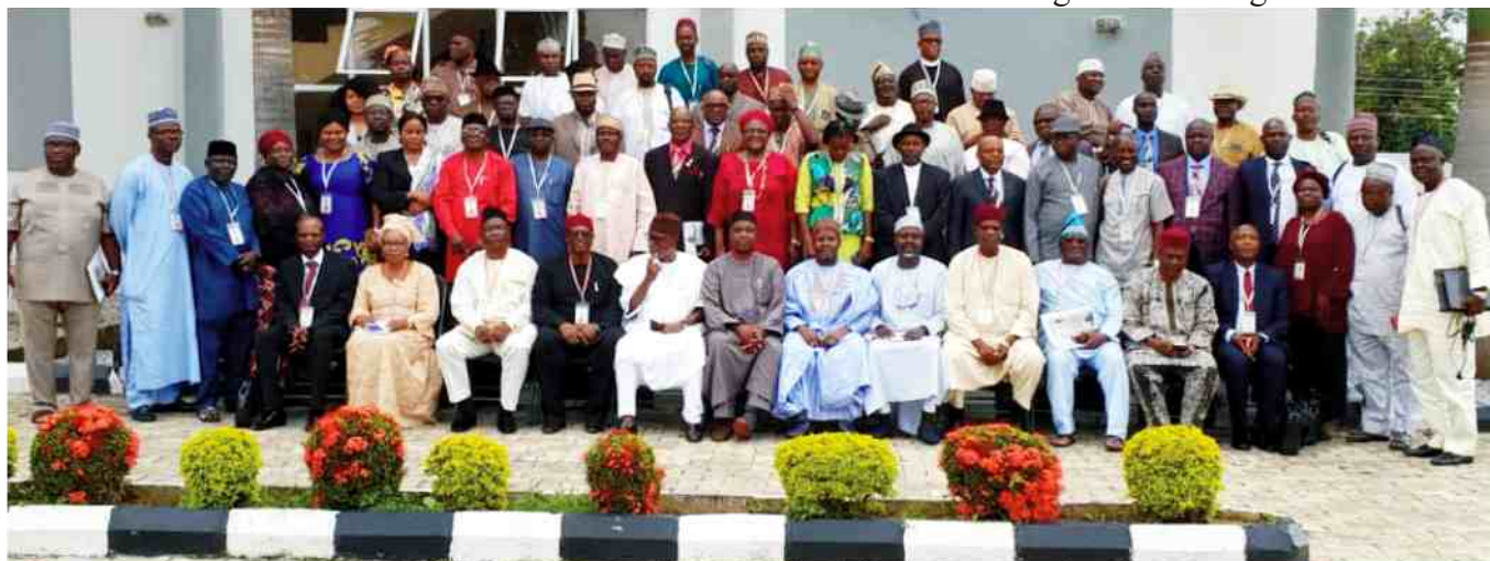
Group photo after the lecture

"I have made it clear that the success or failure of national security architecture rests on the nature of the country's education in general and higher education in