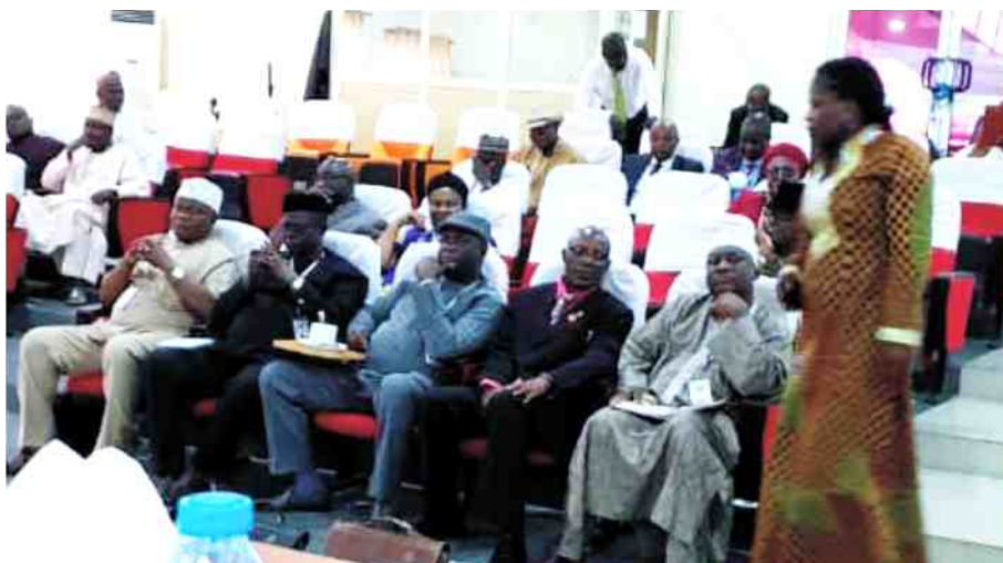
More Course participants

While expressing disappointment with the liberal nature of Nigerian campuses, the Scholar noted that such unrestrained situations might be exploited to steal technical information and expensive