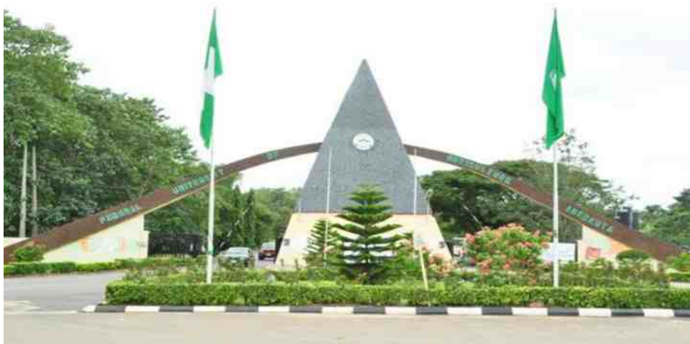
Federal University of Agriculture, Abeokuta (FUNAAB)

He said FUNAAB was one of the few universities that came up to register its crop varieties and advised it to work with relevant agencies so as to popularize the chicken breed.