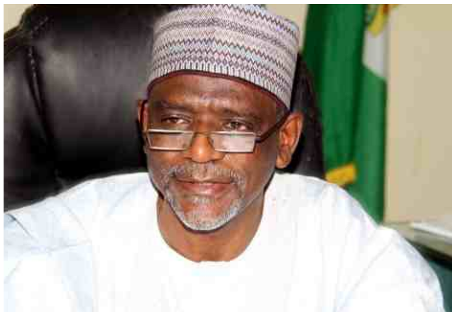
Mallam Adamu Adamu Minister of Education

According to him; "there is an important innovation which we intend to bring about in the Nigerian Army in particular. This day you cannot fight just within the conventional sense, warfare has transformed greatly and it requires more science and intellectual approach than it used to be in those days".