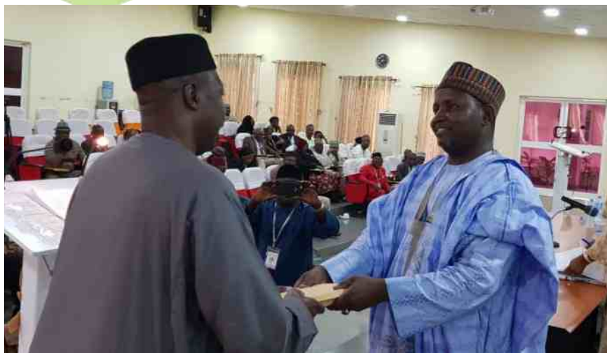
Dep. Director Security Institute, presenting some publications to the Guest lecturer