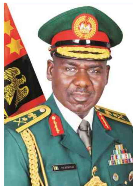
Gen. Tukur Buratai Chief of Army Staff

General Buratai said the Nigerian Army has gone ahead to see to the need for such University that will tailor their specific innovation