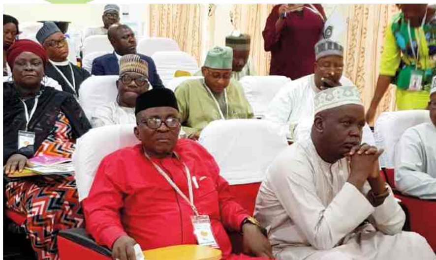
Cross section of course participants

democratic society, reiterating that this would remain one of the core objectives of any education policy in any society.