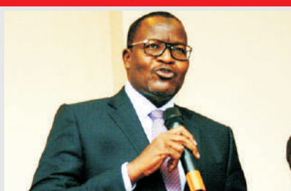
NDA Partners NCC in Military Technology, Cyber Security Pg. 6