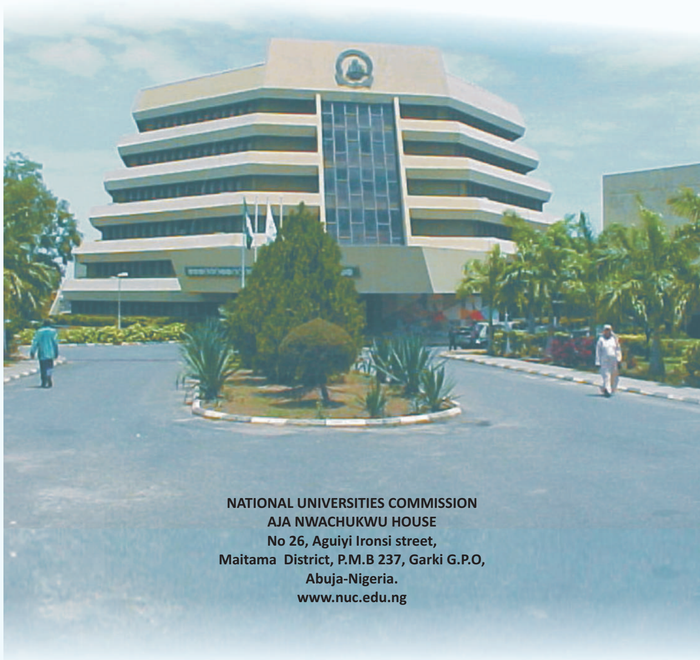
NATIONAL UNIVERSITIES COMMISSION AJA NWACHUKWU HOUSE No 26, Aguiyi Ironsi street, Maitama District, P.M.B 237, Garki G.P.O, Abuja-Nigeria. www.nuc.edu.ng