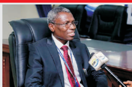
US Mission Salutes ACEGID Pg. 7