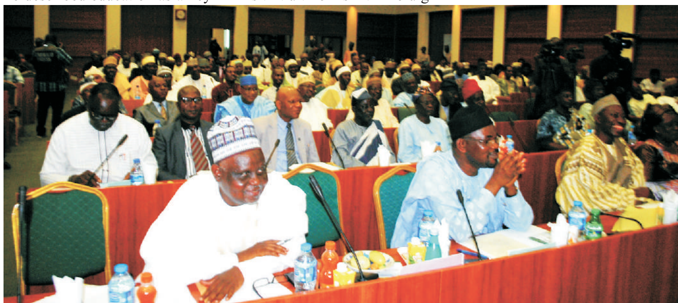
Cross section of participants at the event