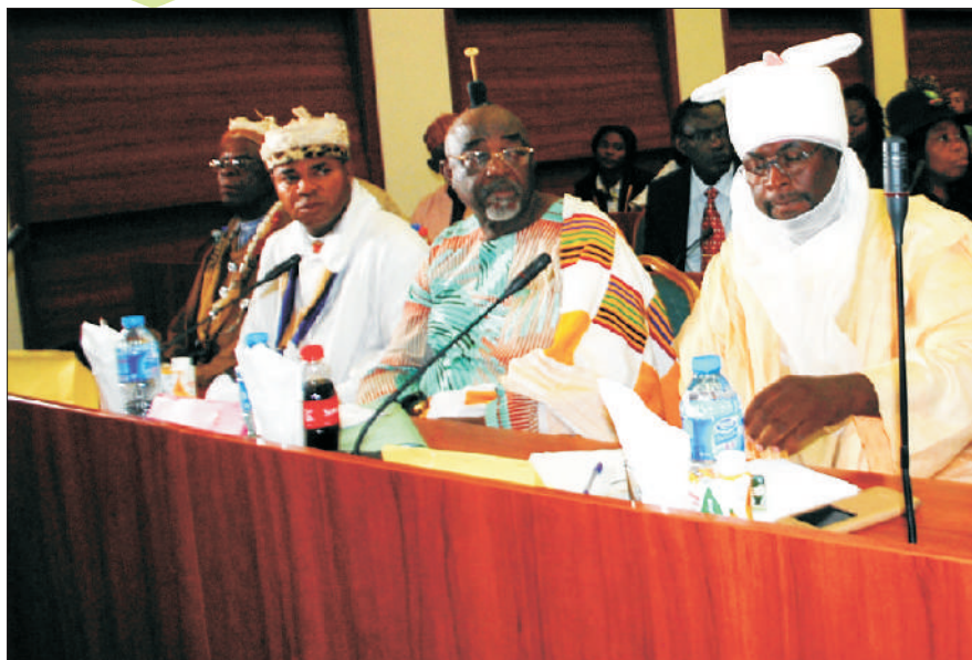
Traditional rulers at the event

appropriation of more funds to enable them operate optimally.