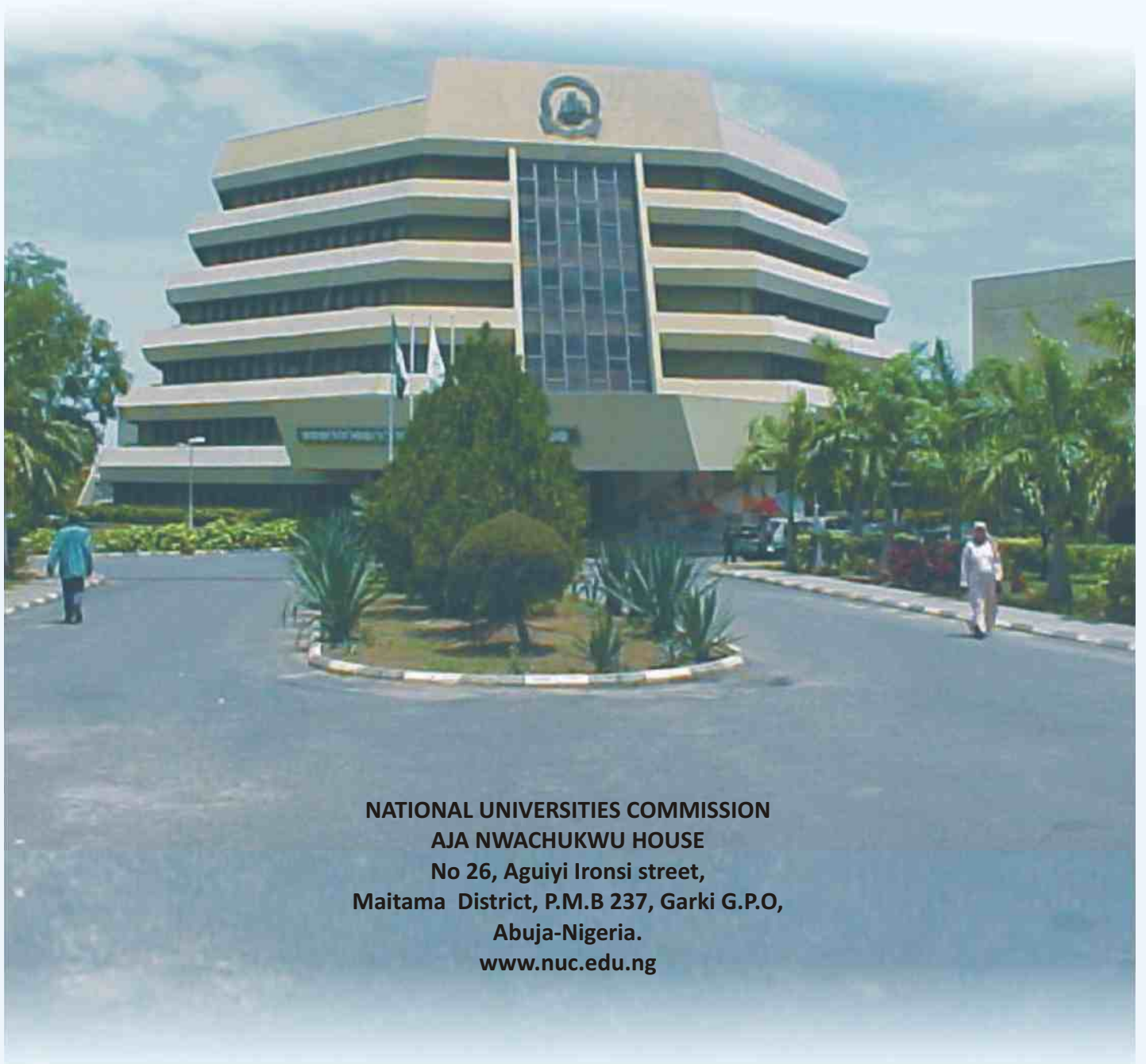
NATIONAL UNIVERSITIES COMMISSION AJA NWACHUKWU HOUSE No 26, Aguiyi Ironsi street, Maitama District, P.M.B 237, Garki G.P.O, Abuja-Nigeria. www.nuc.edu.ng