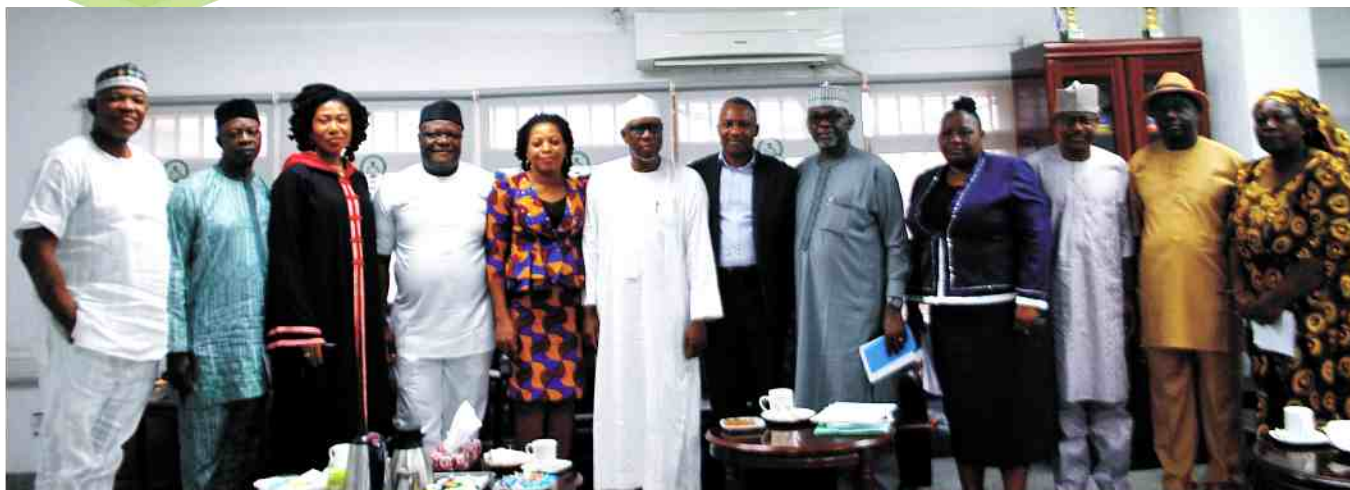
Group photograph of NUC Management and the Chevening delegation

the Commission only provided the necessary regulatory guidance and materials for the exercise.