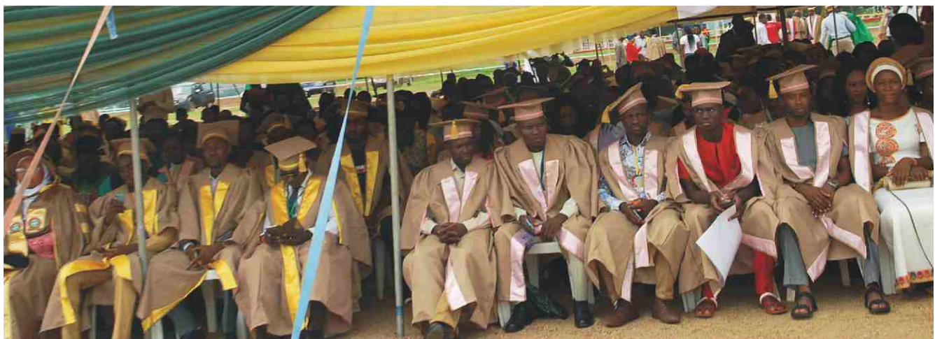
Cross Section of Graduands