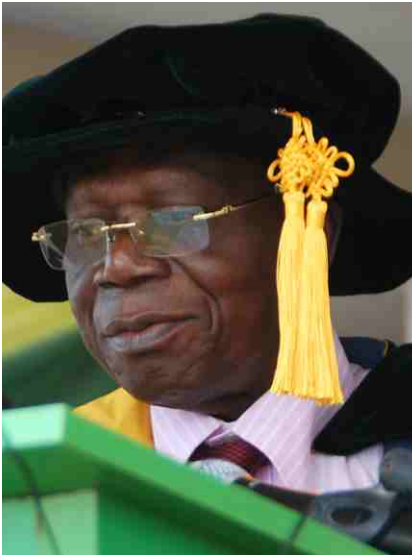
Chairman, Governing Council, Prof. Godwin Sogolo

training. Let me therefore, remind and urge you all, to be up and doing and to key into the transformation agenda of the Federal Government. This transformation is possible only when we have acquired massive capacity that our country need as well as the desired industrial and agricultural revolution.”