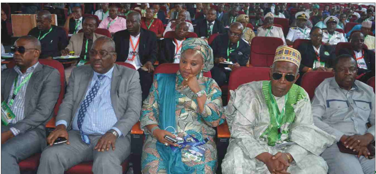
Cross Sections of Participant

The Registrar assured that the Board would implement the federal government guidelines with regards to admissions on part time, sandwich, NOUN and Distance Learning.