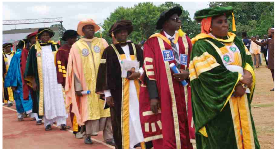
Procession of Visiting Rectors

Enumerating the challenges facing the Polytechnic, Alh. Alhassan said that inadequate funding had slowed down the activities in certain key areas of its operations, lack of perimeter fencing around the campus, which had been posing security challenges to the institution, especially in the area of encroachment and trespass. He also lamented that too few applications, especially from