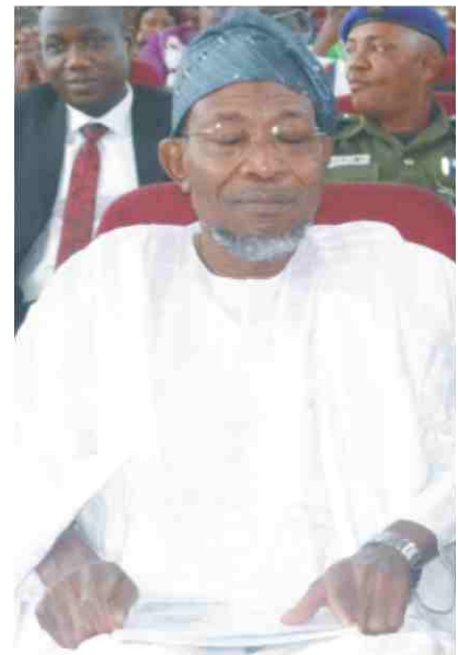
His Excellency, Rauf Aregbesola Executive Governor, Osun State

Mal. Adamu also directed JAMB to reactivate the National Matriculation list for proper data of enrolment into higher institutions. “It is mandatory to keep proper valid register of all matriculated students in the nation's tertiary institutions. Therefore, the Joint Admissions and Matriculation Board (JAMB) and the regulatory agencies should resume their joint monitoring of the matriculation and admissions exercises. The Joint Admissions and Matriculation Board is to reactivate the practice of the production and publication of