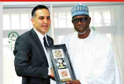
Girne Varsity, Cyprus Visits NUC Pg. 9