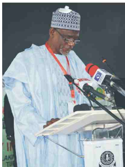
Malam Adamu Adamu Honorable Minister of Education

The Federal government has directed all Federal universities operating on temporary campuses to move to their permanent sites for effective coordination.