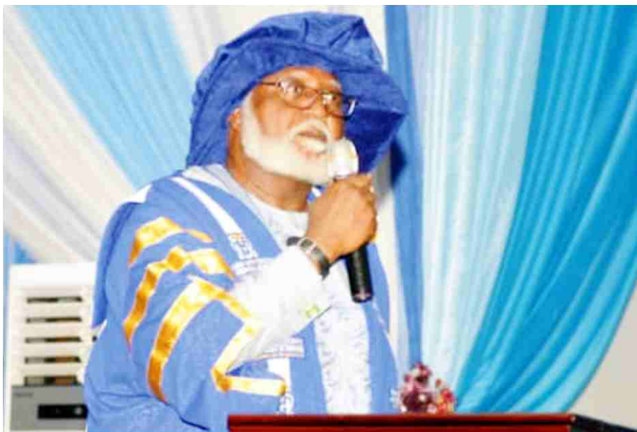
Former Head of State, Gen. Abdulsalam Abubakar, GCFR , Chancellor of the University,

He informed that with the encouragement of the NUC, the Planning and Implementation Committee swung into action