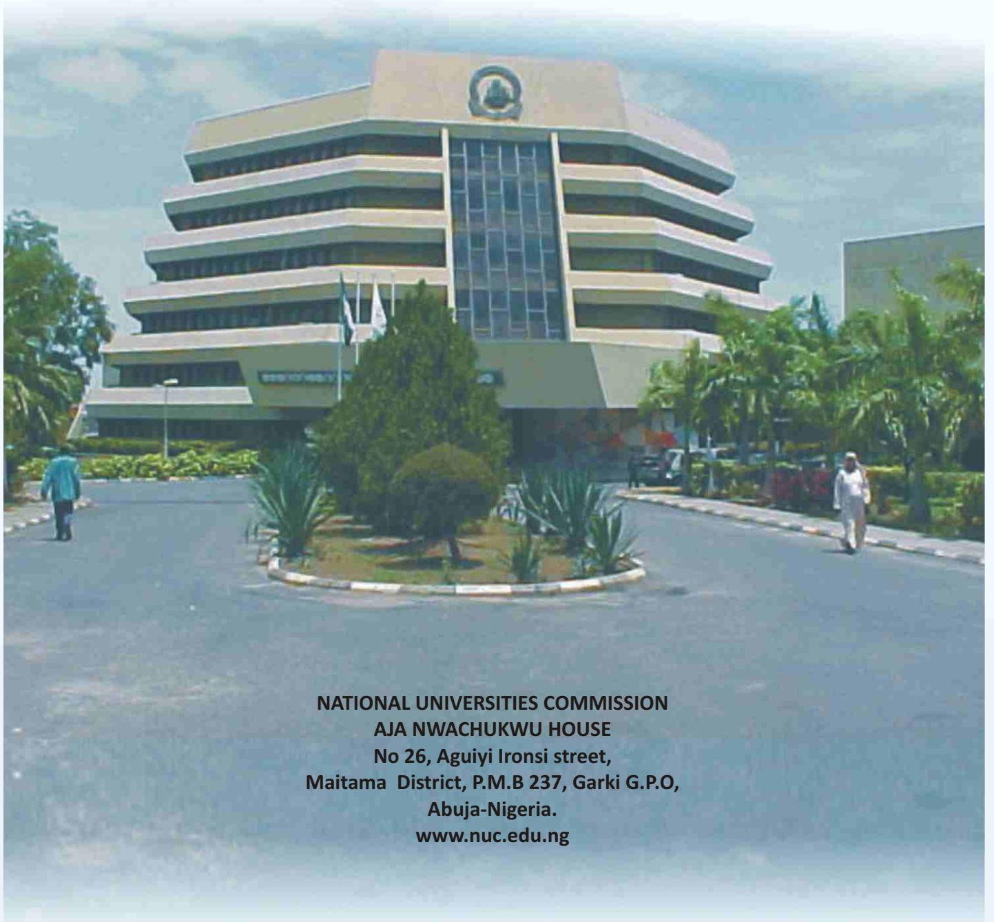
NATIONAL UNIVERSITIES COMMISSION AJA NWACHUKWU HOUSE No 26, Aguiyi Ironsi street, Maitama District, P.M.B 237, Garki G.P.O, Abuja-Nigeria. www.nuc.edu.ng