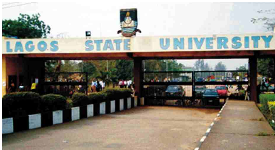
Lagos State University

He charged TEIs to take to the challenge of creating national elite that would facilitate the emergence of a truly united nation.