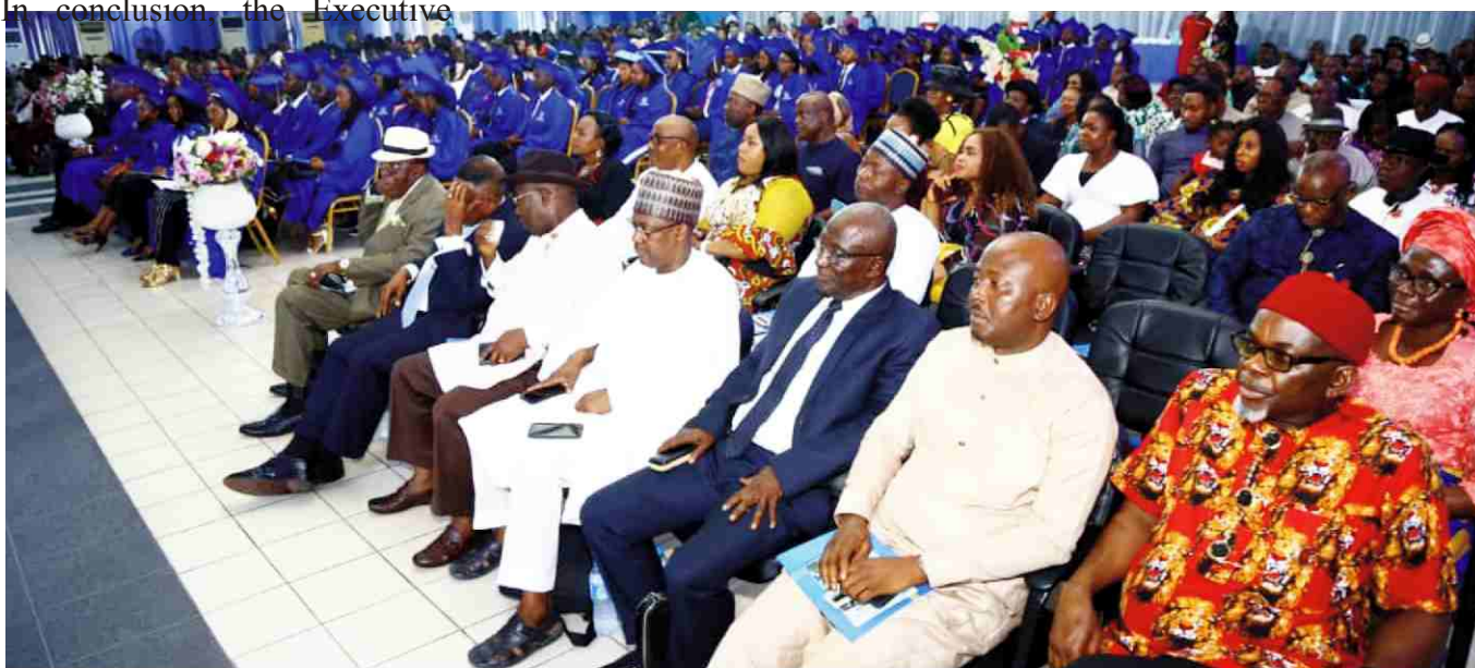
Cross section of guests at the event