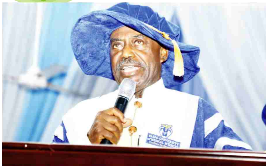
H.E. Dr. Peter Otunuya Odili Former Gov., Rivers State and Founder of the University

commended the founder for embarking on a noble cause of providing services to humanity by training the next generation of medical personnel.