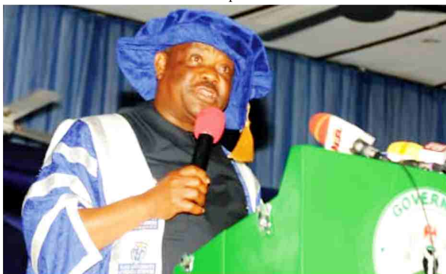
Chief Nyesom Wike Executive Governor, Rivers State

In his own goodwill message, the Executive Governor of Ebonyi State, His Excellency, Engr. David Omahi congratulated the founder, students and management of the new university for contributing in no small measure in expanding the frontier of knowledge. He promised to send a number of