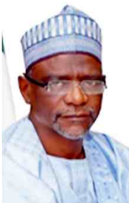
Malam Adamu Adamu Honourable Minister of Education

He enjoined all stakeholders in the education sector including the private sector, civil society organisations, communities and parents to cooperate with the National Planning Committee of the 2018 NPA, to ensure the success of the exercise, as Government cannot do it all alone.