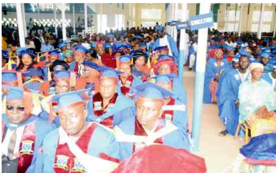
Cross section of students