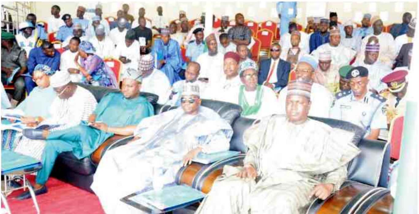
Cross section of invited guests at the convocation