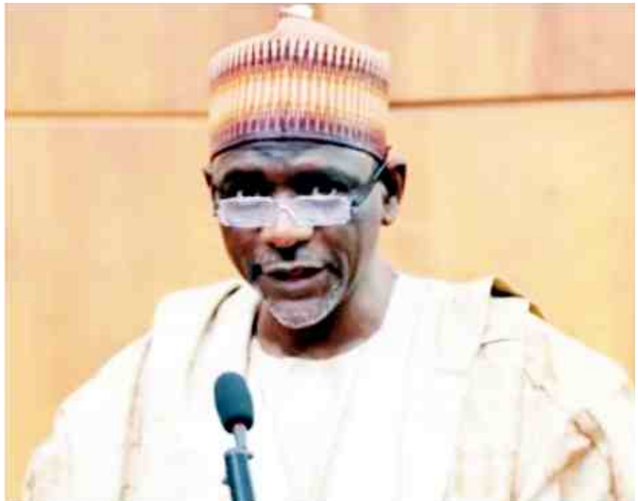
Malam Adamu Adamu Honourable Minister of Education

represented by the Permanent Secretary of the Ministry, Arch. Sonny Echono stressed that the idea that education could and should continue during and despite conflict was not evident for many people, especially compared to basic life- saving services such as medical assistance, shelter, food or water and sanitation.