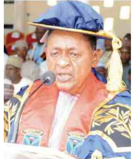
His Majesty, Oba Lamidi Olayiwola Atanda Adeyemi III, Oyo Chancellor of the University,

He therefore, pledged that the Government would devote attention to technical and vocational training, to impart the youth in a bid to provide the