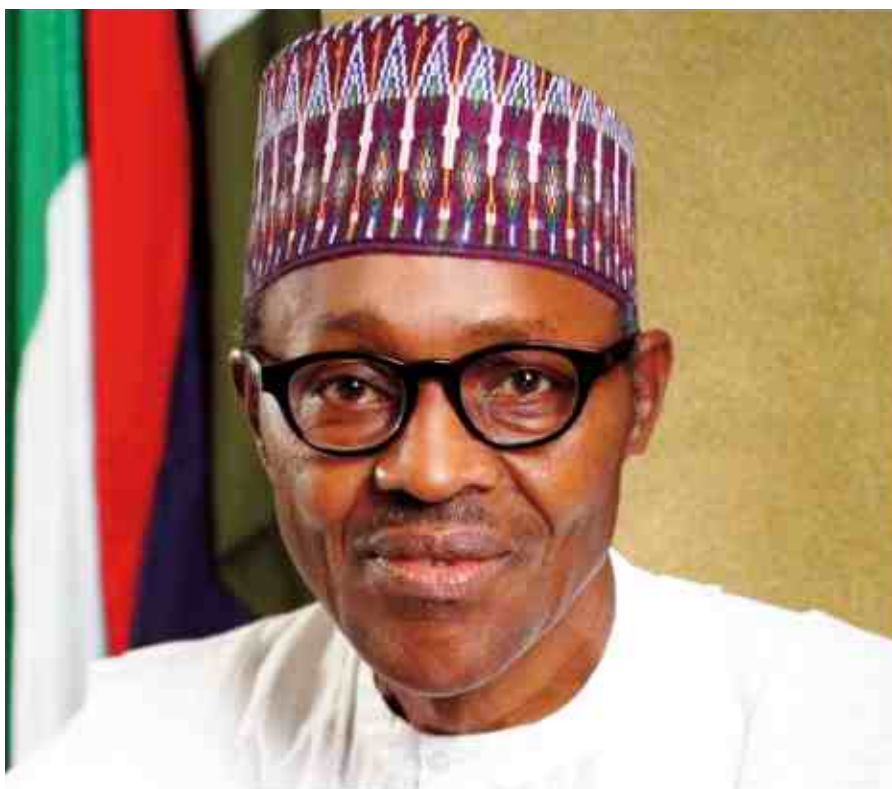
President Muhammadu Buhari, GCFR Commander-in-Chief of the Armed Forces, Federal Republic of Nigeria

He reemphasised that globally, universities through their