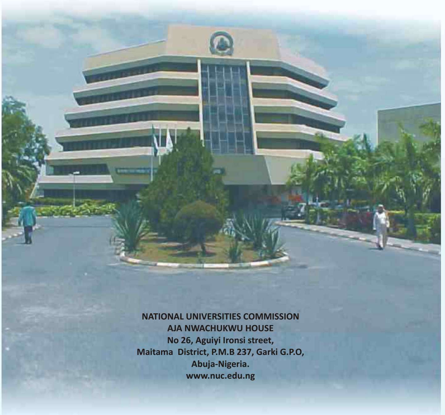
NATIONAL UNIVERSITIES COMMISSION AJA NWACHUKWU HOUSE No 26, Aguiyi Ironsi street, Maitama District, P.M.B 237, Garki G.P.O, Abuja-Nigeria. www.nuc.edu.ng