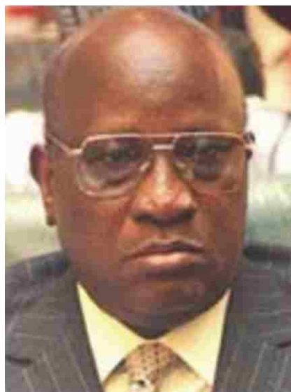
Hon. Justice Alfa Belgore Chancellor