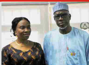
SERVICOM, NUC Partner on Service Delivery in NUS