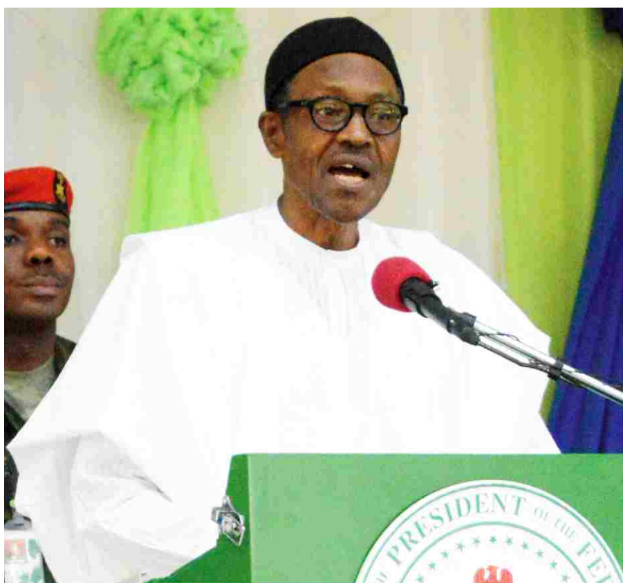
Muhammadu Buhari President and Commander-in-Chief of the Armed Forces Federal Republic of Nigeria