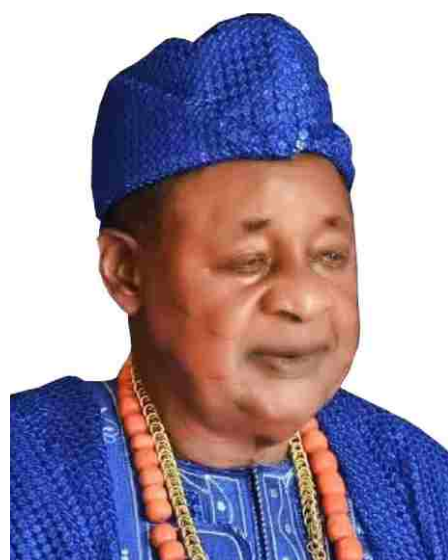
His Imperial Majesty, the Alaafin of Oyo, Oba Lamidi Adeyemi Royal Father of the institution

The authorities of the newly established ATIBA University, Oyo, had appointed key officers for administrative structure and running of the University.