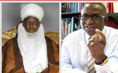
Unical Honours Emir of Borgu, two others with Honorary Degrees