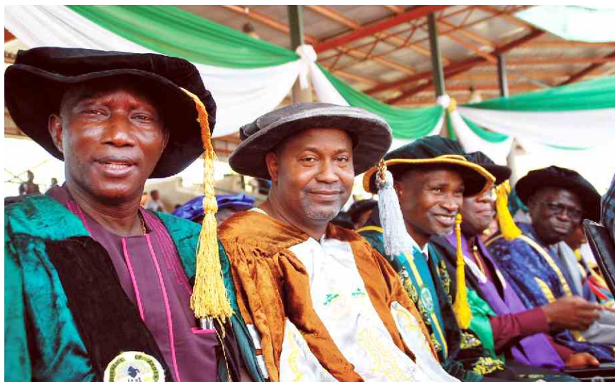
Cross Section of Vice Chancellor

President Muhammadu Buhari, recognized the role of universities in grooming the youth, stating that as custodians of these students, the university must not abuse the trust of the society by disorienting the students for selfish interests. He identified some of the vices that universities must steer students away from, to include cultism,