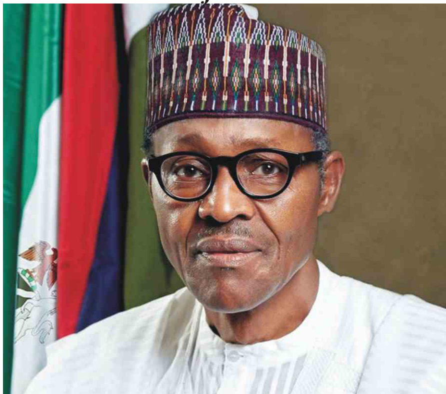
His Excellency, President Muhammadu Buhari, GCFR Commander-in-Chief of the Armed Forces, Federal Republic of Nigeria

In the Visitor’s address read on his behalf by the Deputy Executive Secretary, National Universities Commission