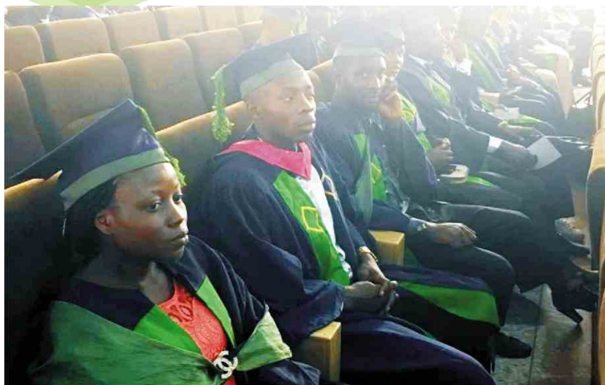
Cross section of some graduands

Excellency, Senator Ibikunle Amosun, CON, FCA in his speech assured the University and the congregation that he would leave no stone unturned to ensure that the University moves up in its Webometric Ranking of 23rd position to become one of the best in Nigeria. He charged the people of Ogun State to support his administration in its quest to develop education at all levels.