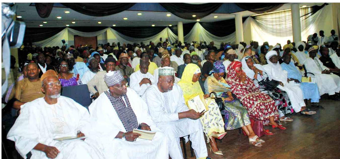
Invited guests at the event