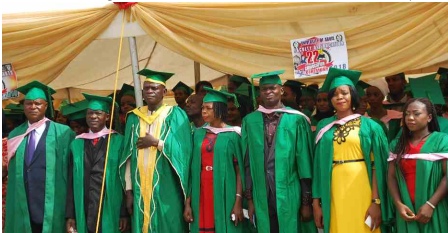
Cross section of graduands

The Vice-Chancellor informed the gathering that there were many ongoing projects, such as the main office of the Centre for the Distance Learning and Continuous Education, the