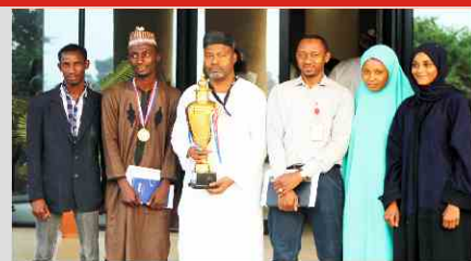
SLU Wins West African University Debate Championship