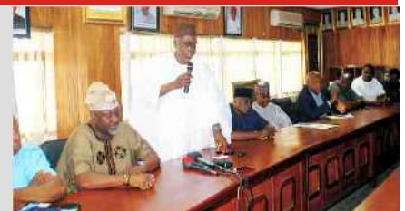
Okun Development Association Visits NUC