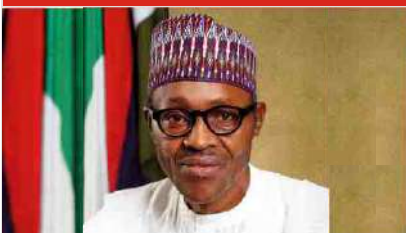
Buhari Ask Varsities to Promote Democracy, Good Governance