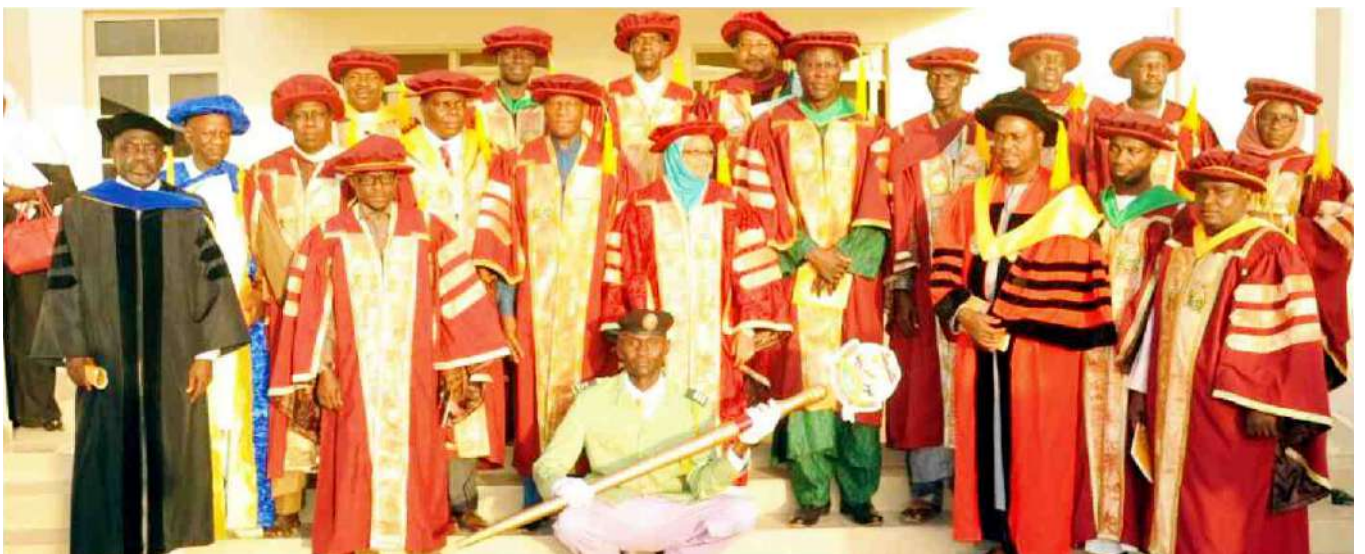
Members of Senate of the university