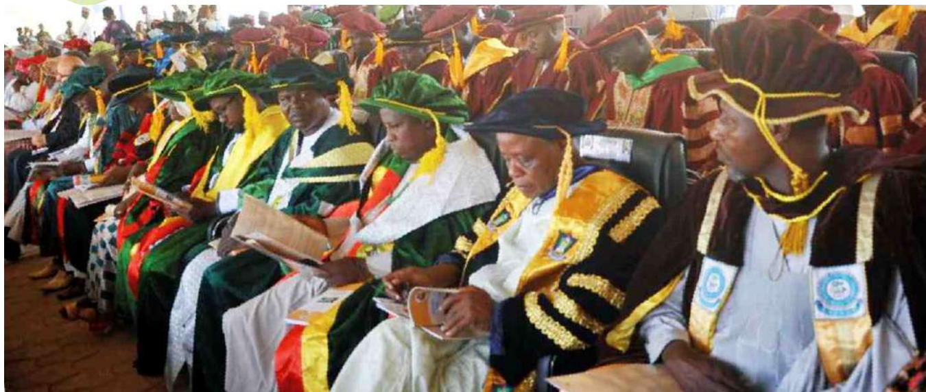
Cross section of Visiting Vice-chancellors at the convocation

the environment that remained tragically unexplored, that need to be spurred to demonstrate good sense of social responsibility as well as commitment to community service. The Vice-chancellor said “it was deemed most expedient to tap into the great endowment and transform them into great assets at both local, national and international levels.”