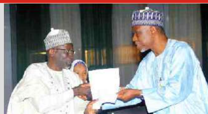
NUC Sends Forth Deputy Executive Secretary and Four Others