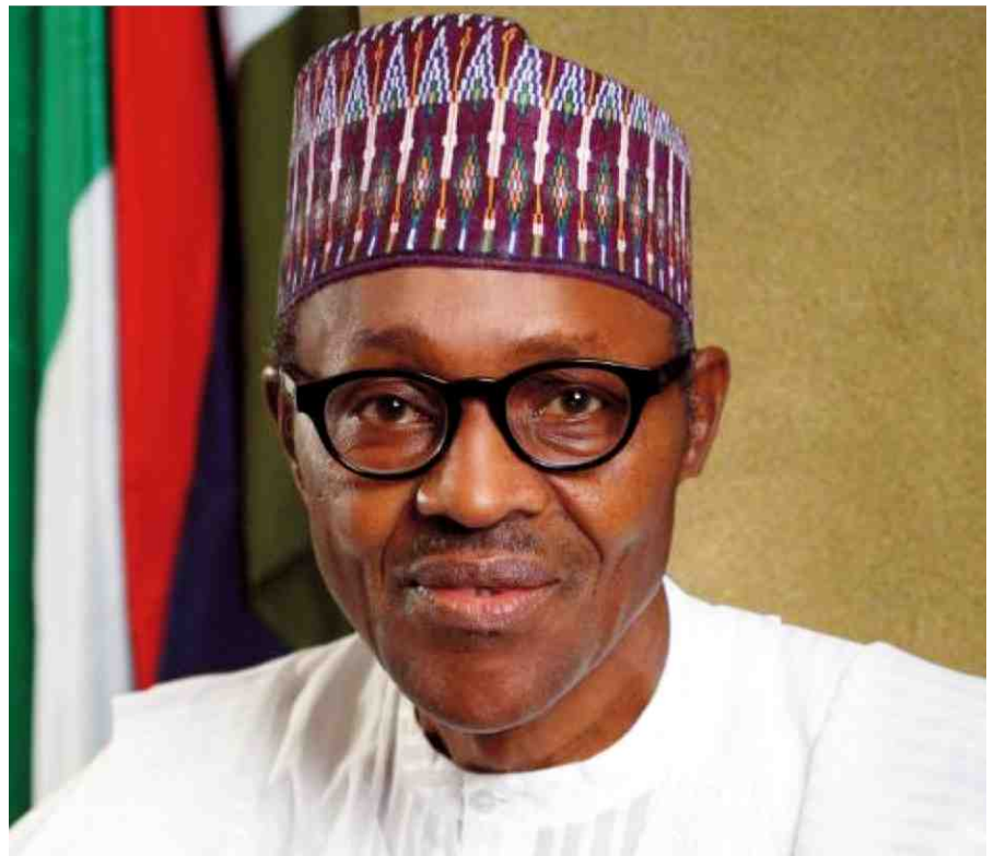
His Excellency, President Muhammadu Buhari, GCFR Commander-in-Chief of the Armed Forces, Federal Republic of Nigeria

The Visitor expressed happiness and optimism for the sufficient training and knowledge in terms of learning and character acquired by the grandaunts and urged them to deploy the use of knowledge and skills they