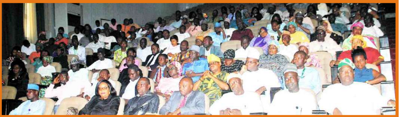
Cross section of NUC staff and guests