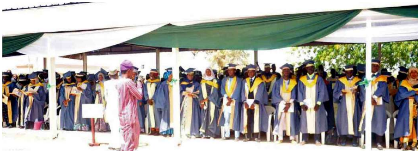
Cross section of graduands