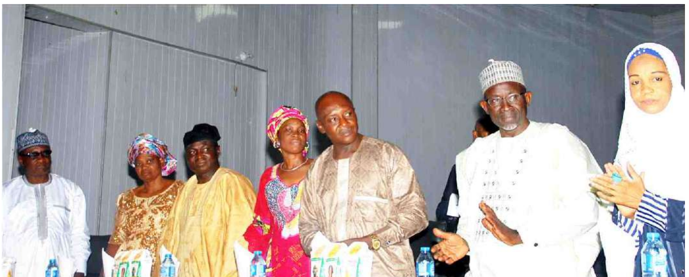
Celebrants and their families at the event