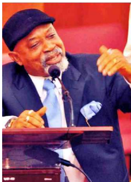
Dr. Chris Ngige Minister of Labour and Productivity

The over three months old strike of the non-teaching staff of the Nigerian Universities was called off, 14th March 2018.