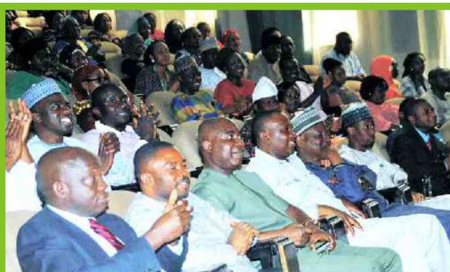
Other NUC staff and guests