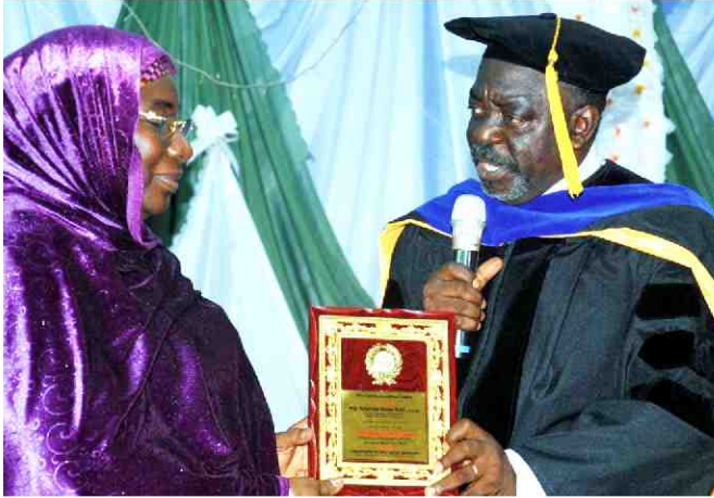
Guest lecturer receiving a plaque