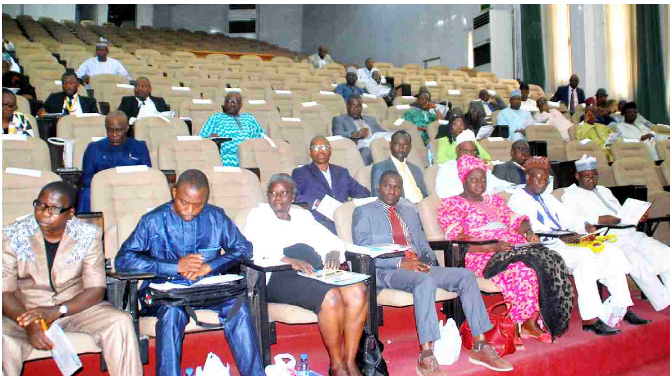
Some stakeholders at the event

At the meeting were Management members of NUC, Representative of SAFE, Vice-Chancellors, Deans of Faculties and stakeholders.