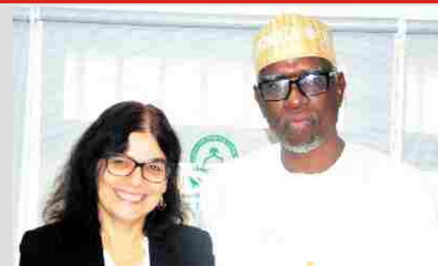
French Delegation Visits NUC