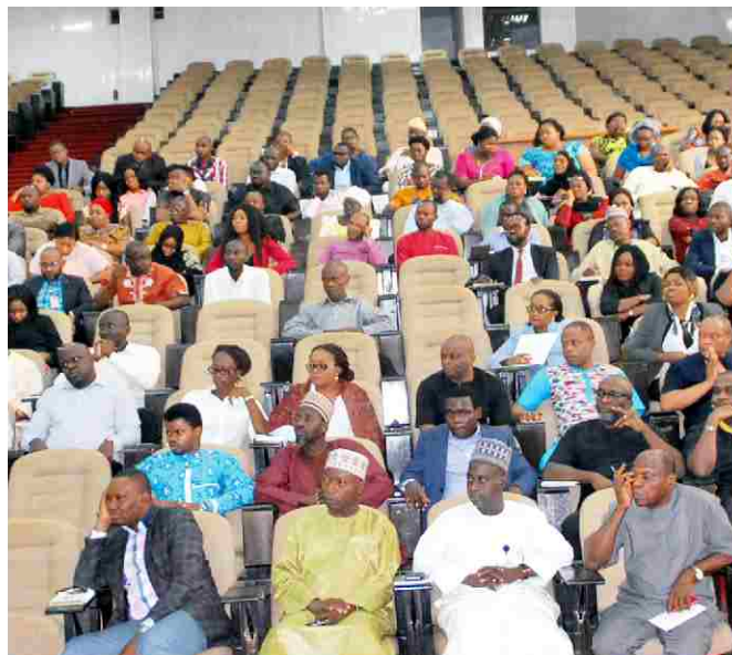
Staff at the event