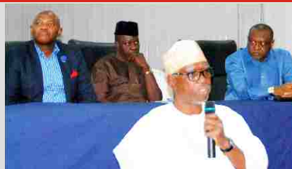
ES Charges Staff on Self Development