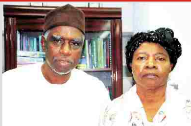
ES Reiterates NUC's Commitment to Review BMAS Documents Commends SAFE