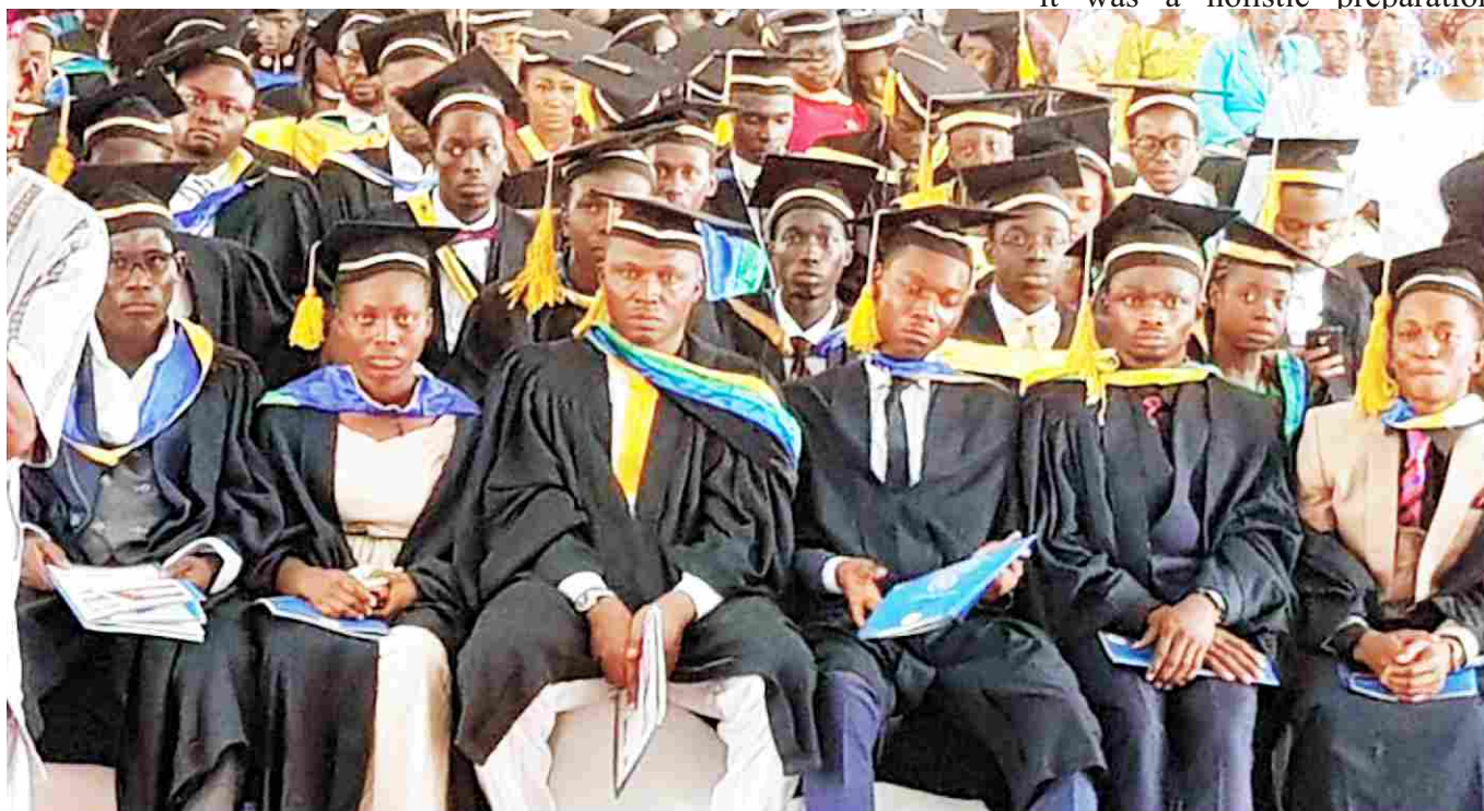
Cross section of graduands