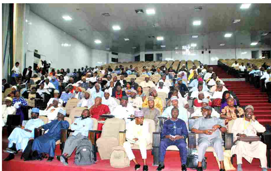
A cross section of participants at the workshop

Enago Academy is a United Kingdom based knowledge platform offering up-to-date resources on scholarly publishing for researchers, authors, publishers and academic societies. Enago Academy provides assistance to researchers and authors, help journals and publishers to produce quality articles and collaborate with Universities and academic institutions by conducting author workshops for first-time authors and researchers; improve the quality of publications from universities by training experienced authors to publish in high impact factor journals and increases the awareness of the scholarly publishing industry among graduate students.