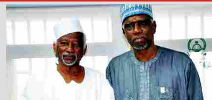
Zangon Daura Leads Al-Qalam on Courtesy Visit to NUC