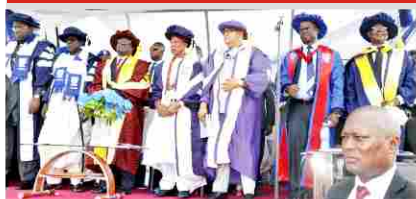
CRUTECH Holds 10th Convocation — graduates 6,632