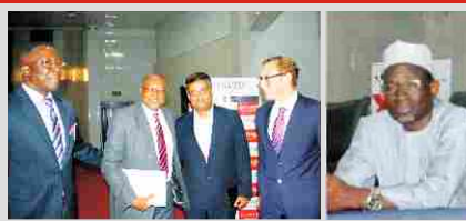
NUC Holds Workshop on Academic Publishing