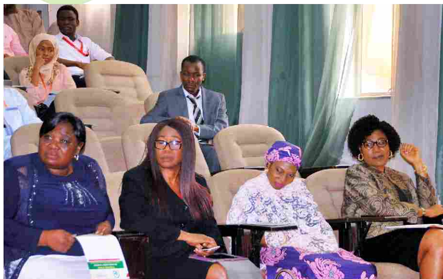
Some NUC Directors

“Today’s workshop, which is targeted at Universities in the Northern region will be replicated across the remaining four geo-political zones of Nigeria with the University of Lagos hosting the South-West region, University of Port-Harcourt hosting the South-South region and the Nnamdi Azikiwe University, Awka hosting the South-East region during the course of the week.”