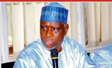
OER Policy Underway