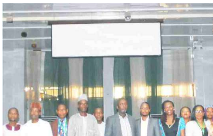
Group Photograph of DES (Admin), (4th Front row) with the Celebrant, (3rd Front row), Management and the Departmental Staff