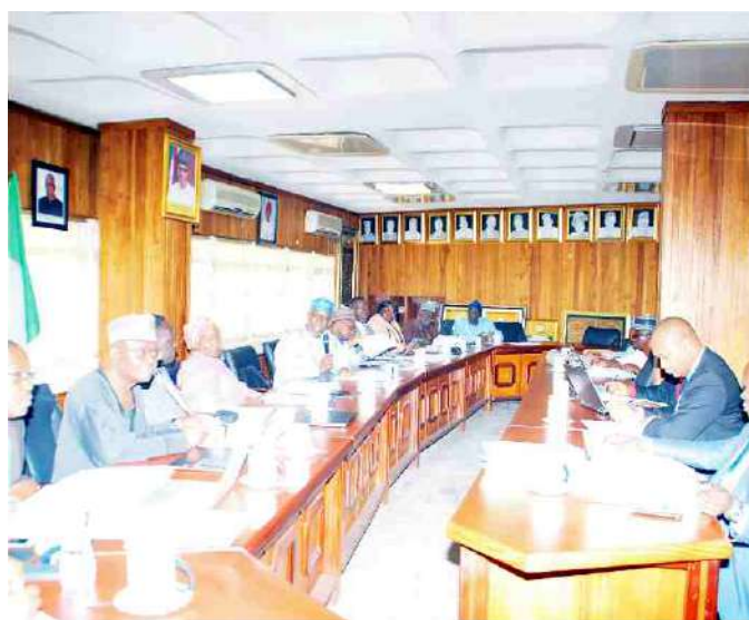
Prof. Rasheed addressing the inaugural meeting of the National Steering Committee on Open Educational Resources (NSC-OER)