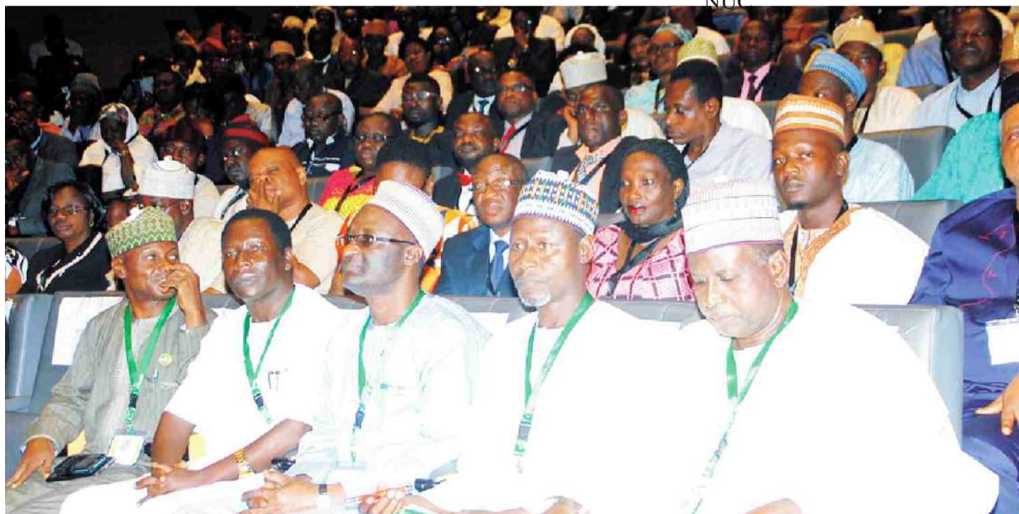
Some Vice-Chancellors and Heads of Tertiary Institutions at the Meeting