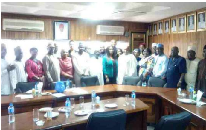
The celebrant in a photograph with members of the NUC Management, friends and other colleagues