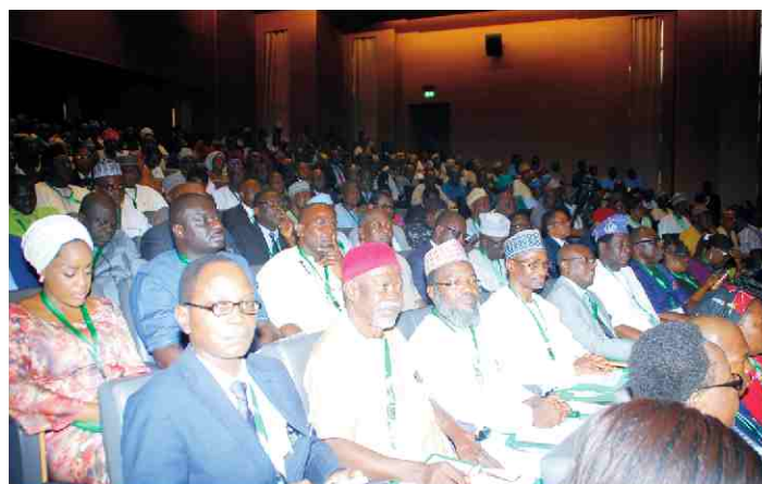
Some Vice Chancellors, Registrars and Provosts