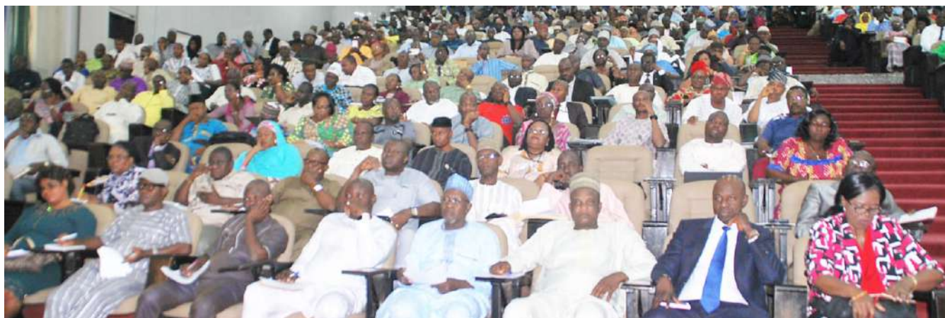
Participants at the one day retreat on Economic Recovery and Growth Plan on the 2018 Budget organised by the FME