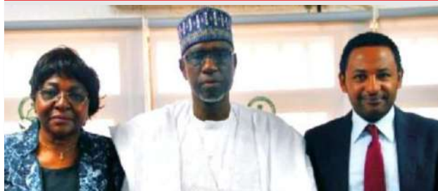
100 New Varsities likely in Next Five Years – Prof. Rasheed