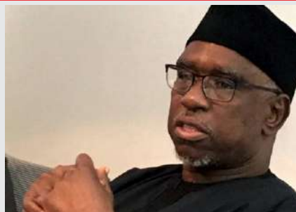
NUC, UoL to Collaborate on ODL