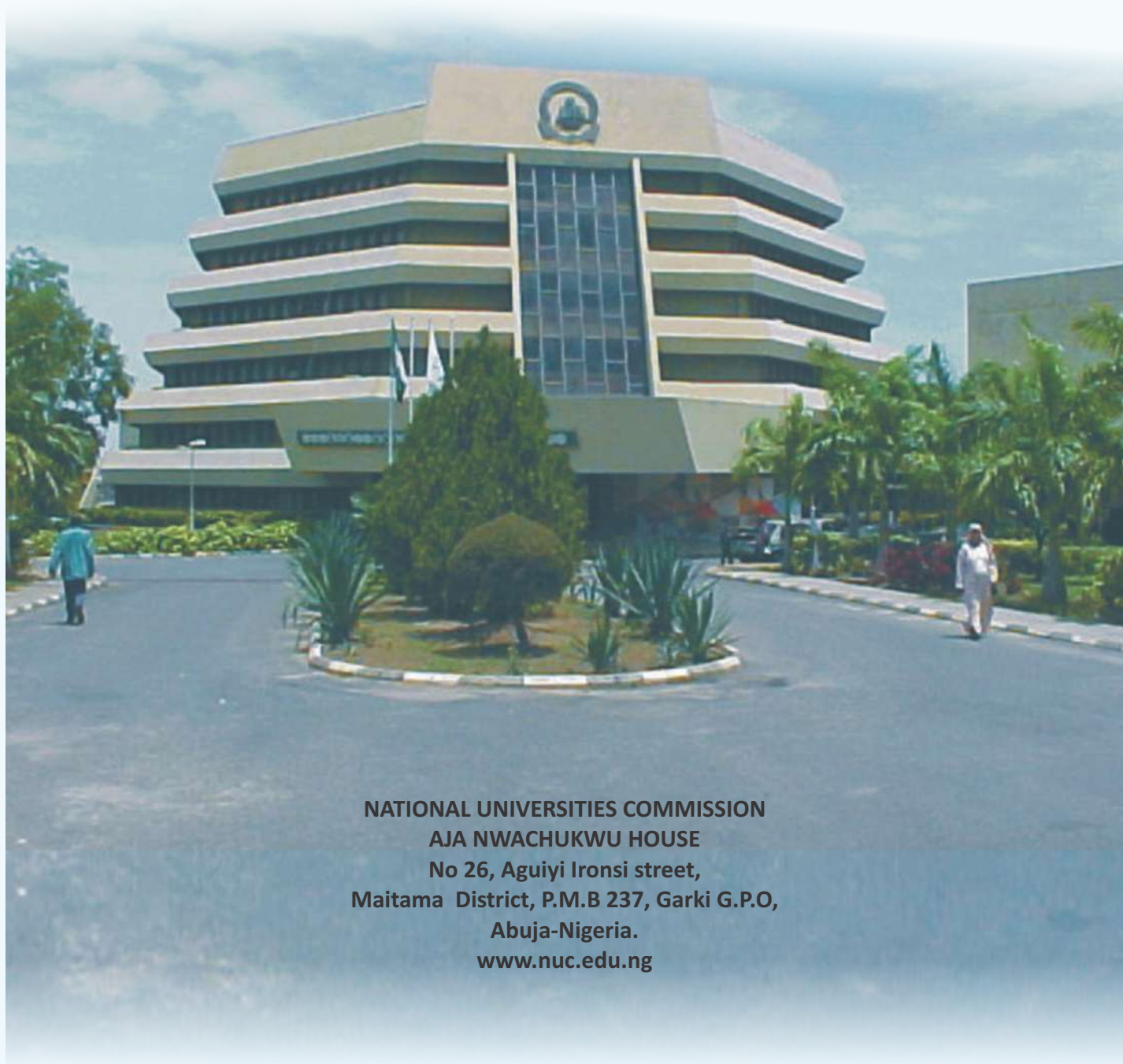
NATIONAL UNIVERSITIES COMMISSION AJA NWACHUKWU HOUSE No 26, Aguiyi Ironsi street, Maitama District, P.M.B 237, Garki G.P.O, Abuja-Nigeria. www.nuc.edu.ng