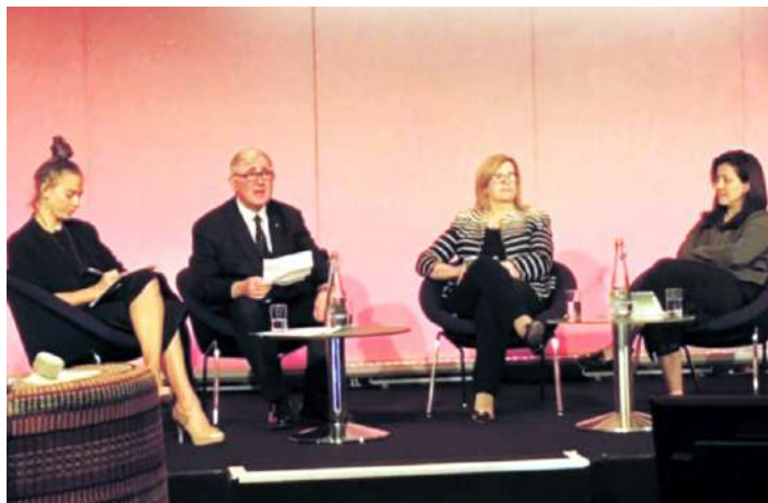
Panel on Innovation Districts