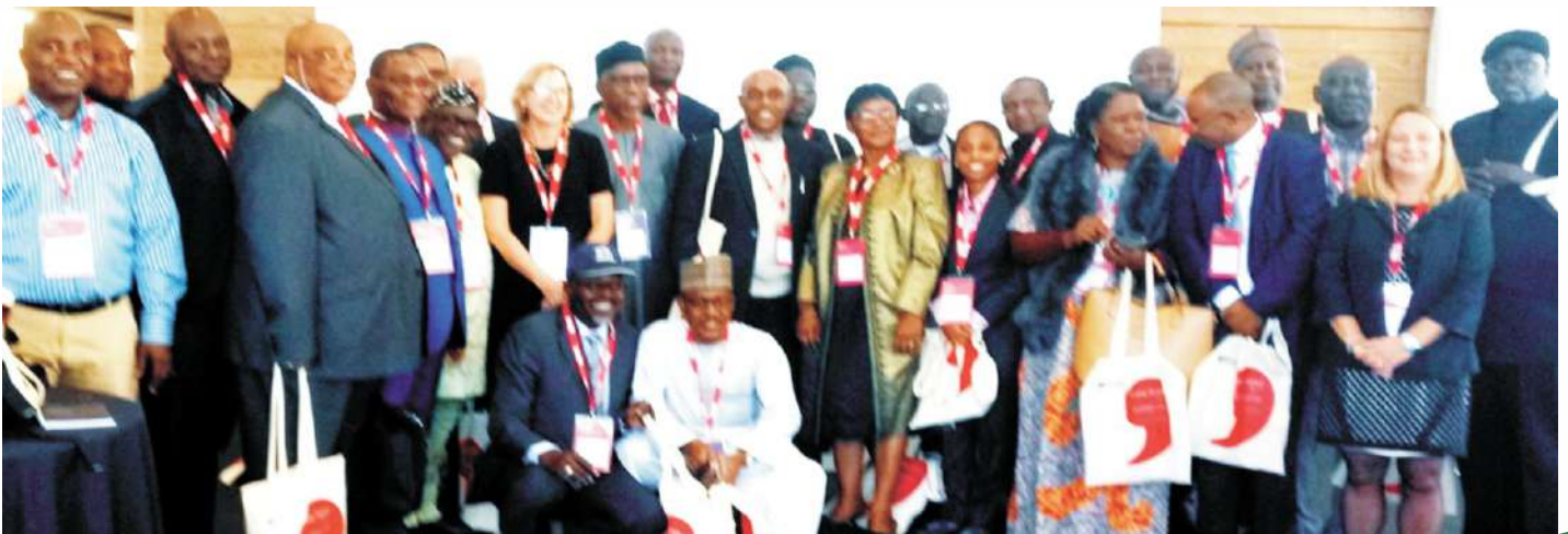
Group photo of Nigerian delegation to 11th Annual Going Global Conference in London

Universities, he said, play a fundamental role in attracting, training and connecting skilled