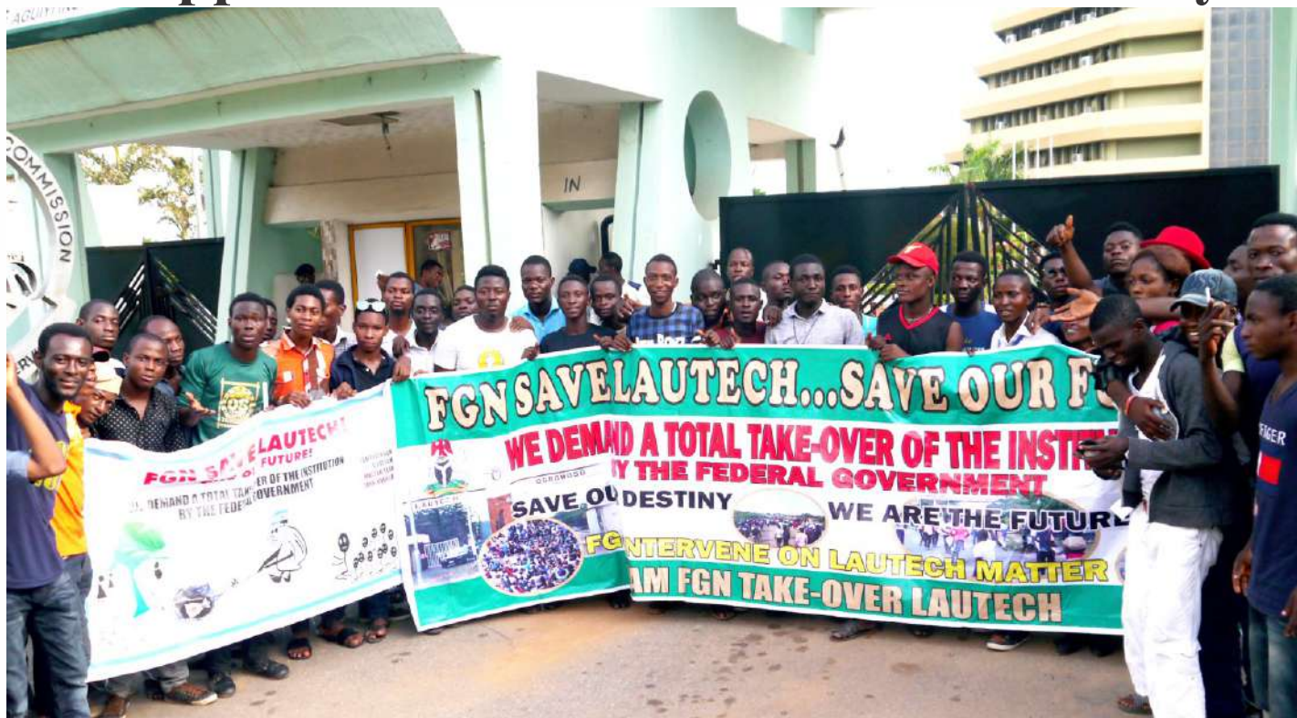
Students of Ladoke Akintola University of Science and Technology, Ogbomoso, Protesting in front of the NUC