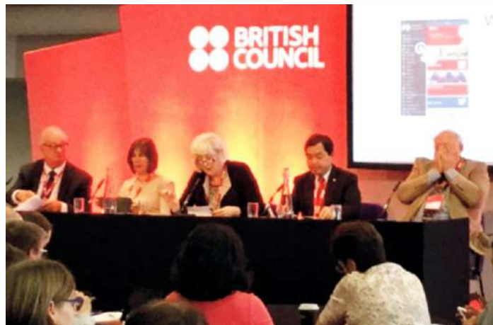
Panel on Internationalization