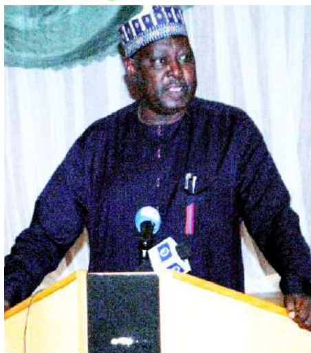
Engr. Babachir David Lawal, Secretary to the Government of the Federation,

SGF said, were: to seek ways to continually enhance citizen-focused service delivery, by providing a platform for the exchange of ideas to advance improved service delivery as a direct outcome of the Change Agenda; to sensitise key policy and decision makers in the public and private sectors on citizens' expectations and provide a greater support for social accountability in service delivery; and to improve government's connection with the citizenry.