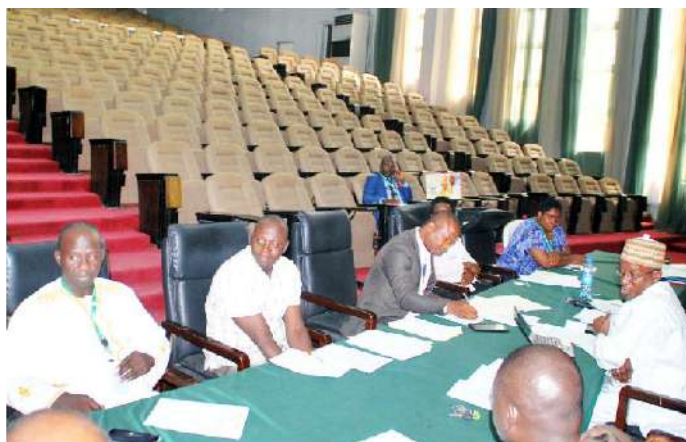
The SERVICOM Desk Officers reviewing NUC Departmental Reports