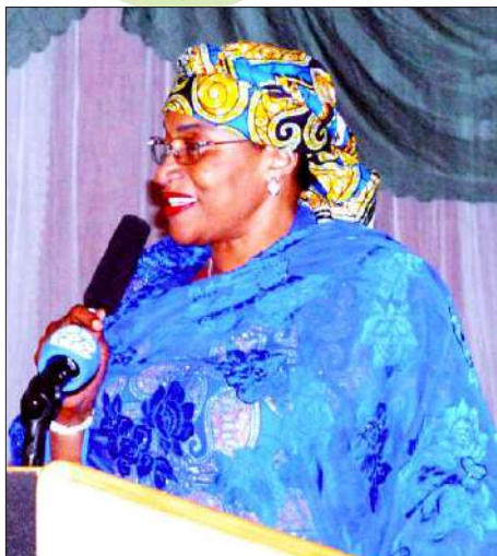
Hajia Aisha Jummai Alhassan, Honourable Minister of Women Affairs

Lending her voice, former HOCSE, who also chaired the opening session, Ms. Ama Pepple, said that SERVICOM, which was initiated by former President Olusegun Obasanjo in 2004, was meant to address the epileptic service delivery in the country, remarking that the Service Charter had so far failed to achieve what it was created to do.