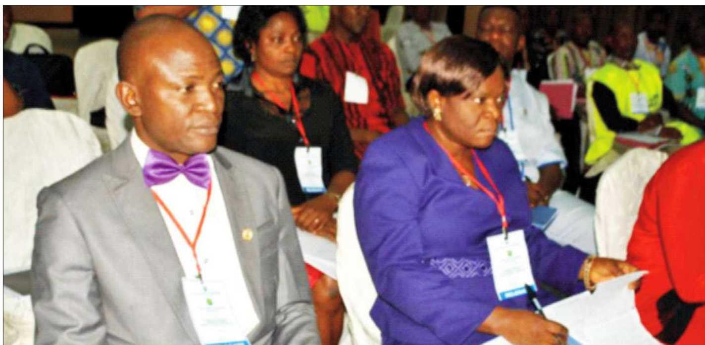
Some of the delegates at the conference