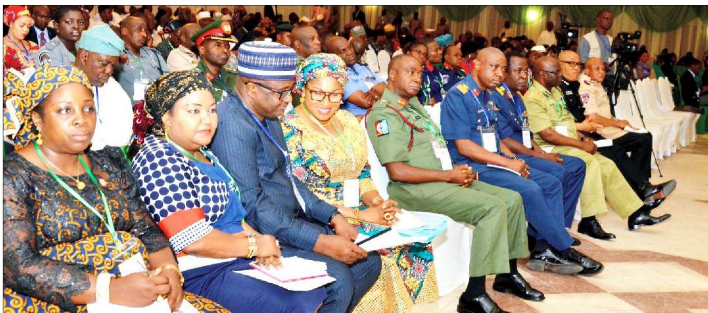
Participants at the First SERVICOM National Policy Dialogue, held at State House Conference Centre

Affairs, Hajia Aisha Jummai Alhassan, observed that 80 per cent of Service Delivery was performed by women in service, lamenting that only about 20 per cent attended the event. She submitted that more efficient and reliable service delivery would be accomplished if more women are given the opportunity to take charge of SERVICOM units of the MDAs.