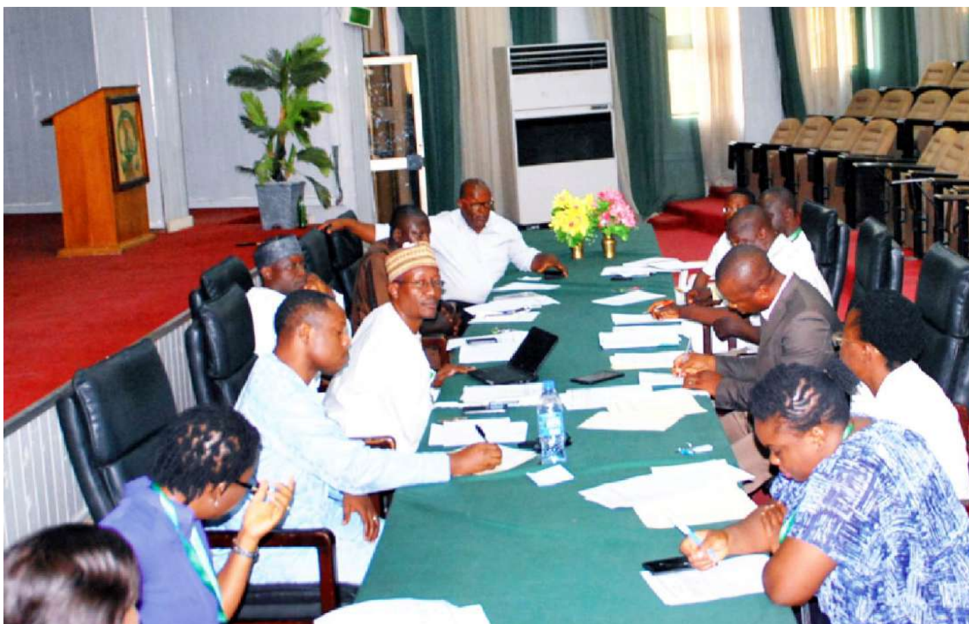
NUC SERVICOM Desk Officers at a Roundtable on Service Delivery held at the NUC Auditorium