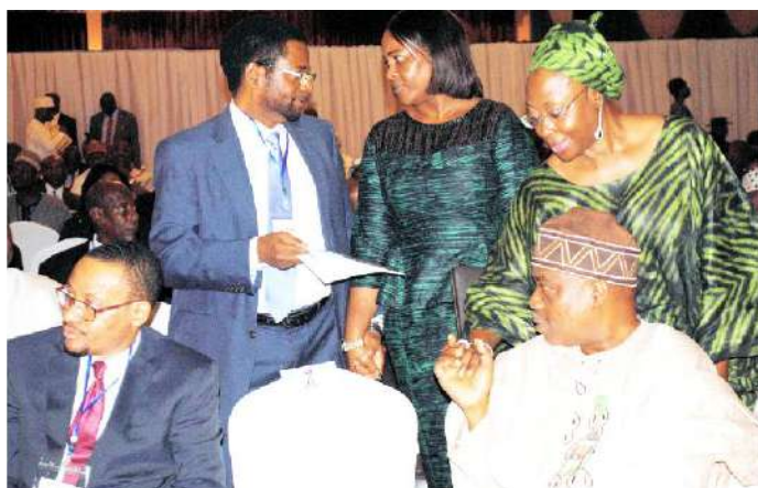
Some of the participants at the conference