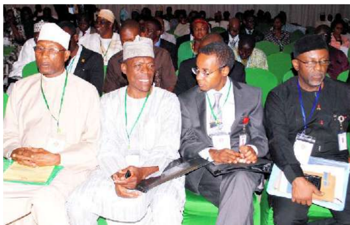
Other participants at the Conference