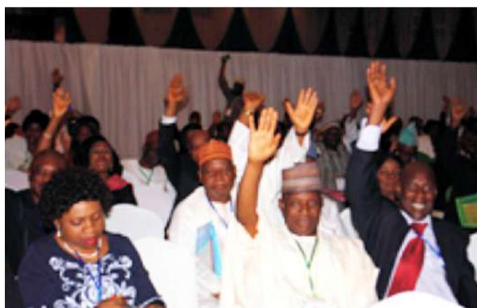
Participants during the question and answer session