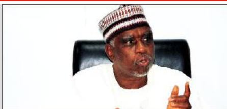
Oil Company Canvasses Review of Engineering Curriculum