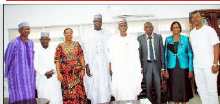
'Data Management Crucial for Decision Making'