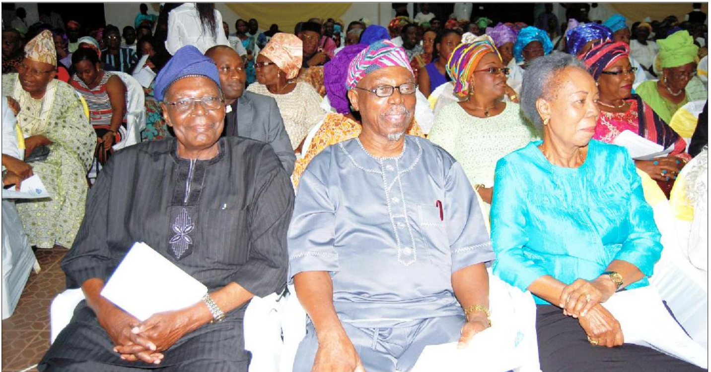
Guests at the ceremony